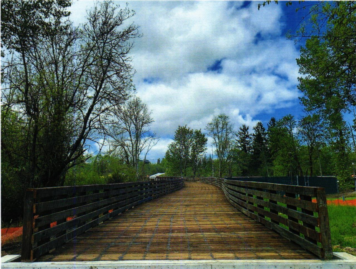
Cedar Creek Trail