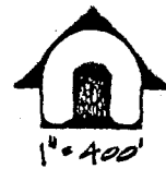
S.W. SCHOLLS-SHERWOOD ROAD WATER L.I.D.