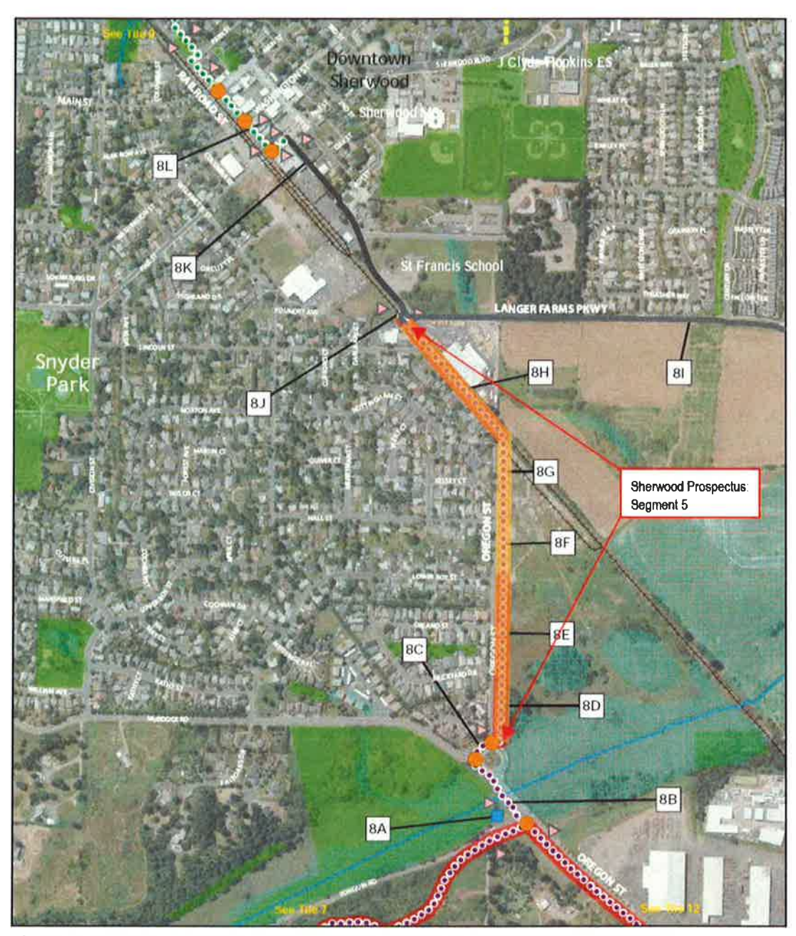
Map 14: Tile 8 - Tonquin Road/Oregon Street to Downtown Sherwood