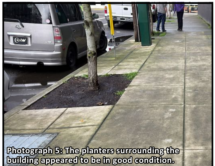
Photograph 5: The planters surrounding the building appeared to be in good condition.