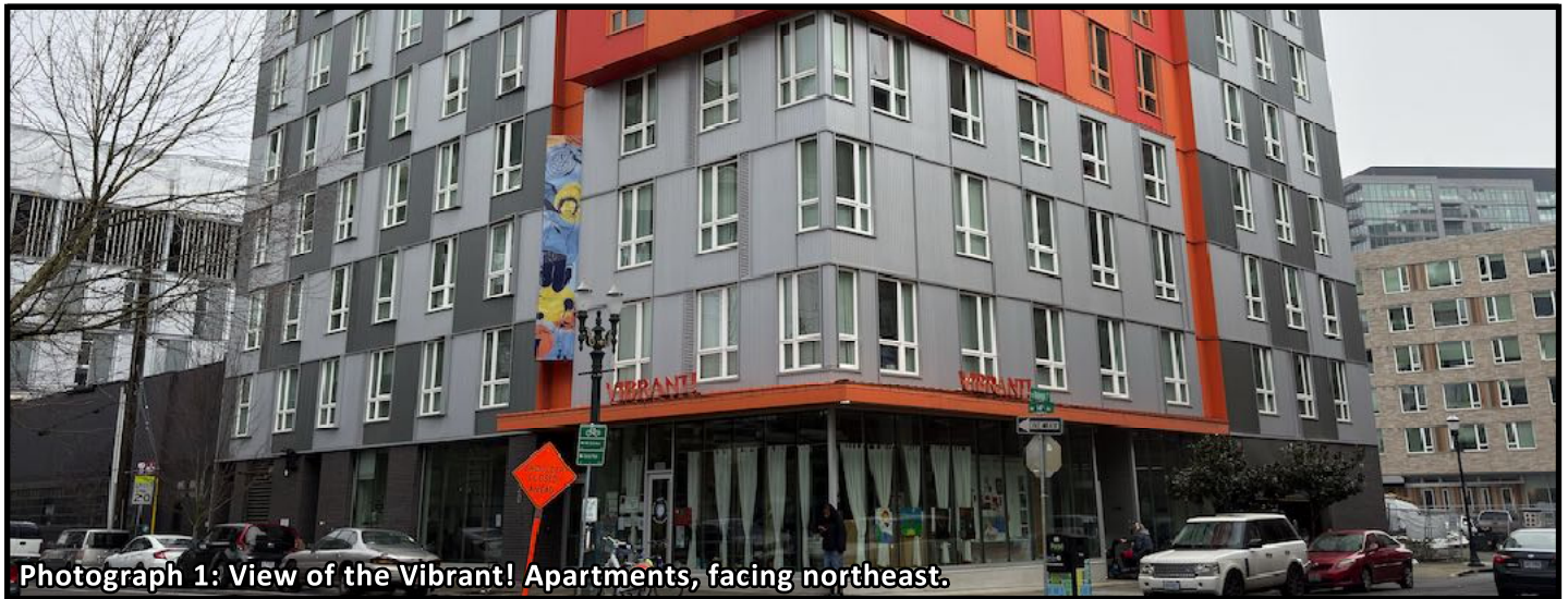
Photograph 1: View of the Vibrant! Apartments, facing northeast.