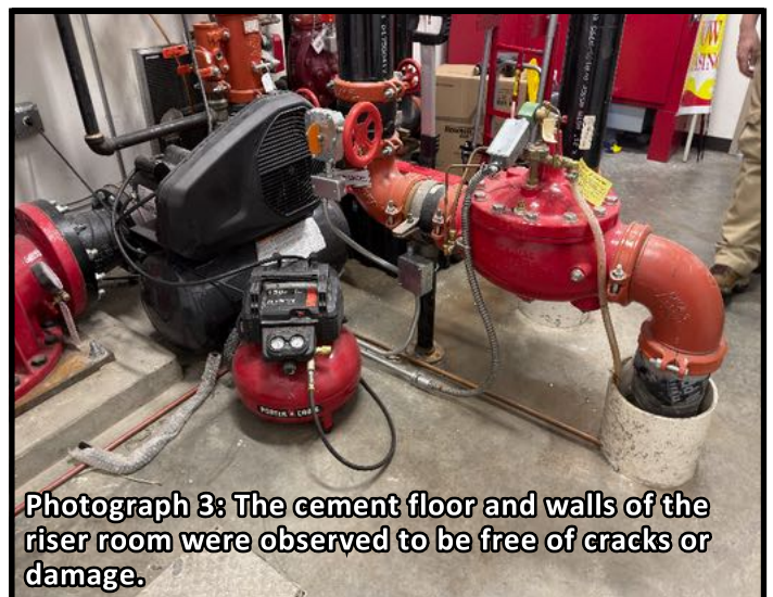
Photograph 3: The cement floor and walls of the riser room were observed to be free of cracks or damage.