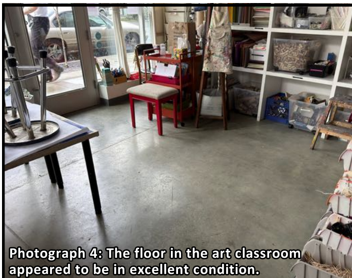
Photograph 4: The floor in the art classroom appeared to be in excellent condition.