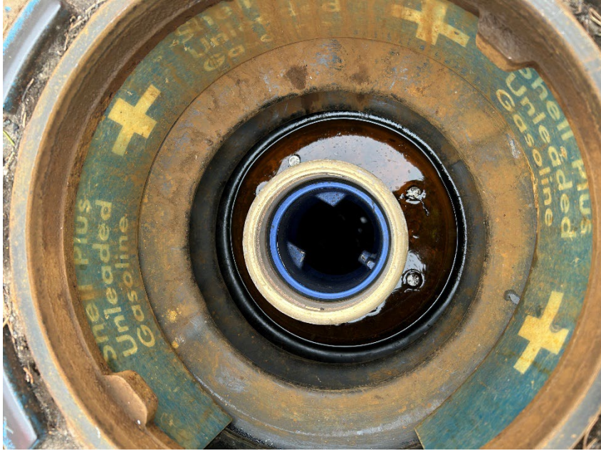
13: Unleaded plus fill