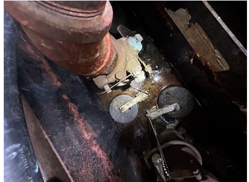
26: UDC #5/6