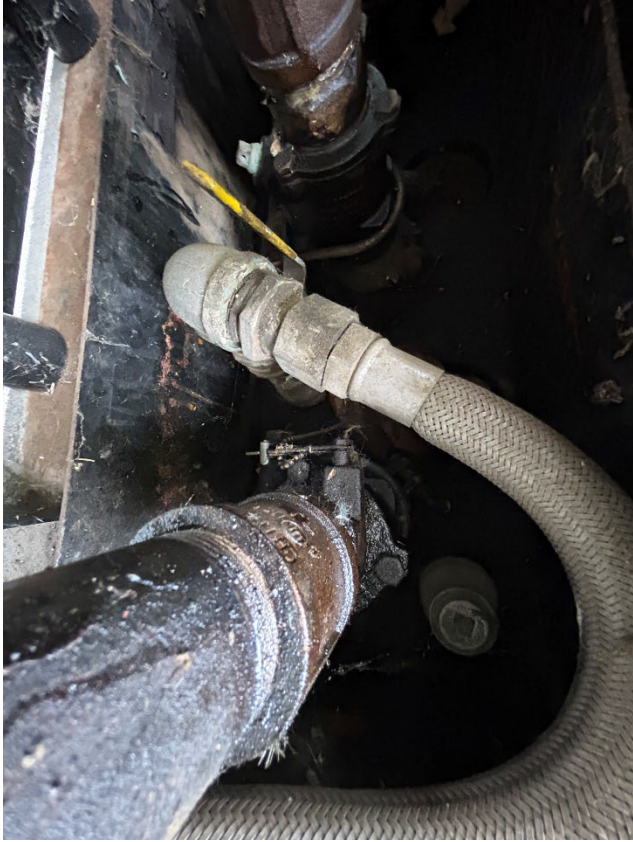
19: UDC #1/2