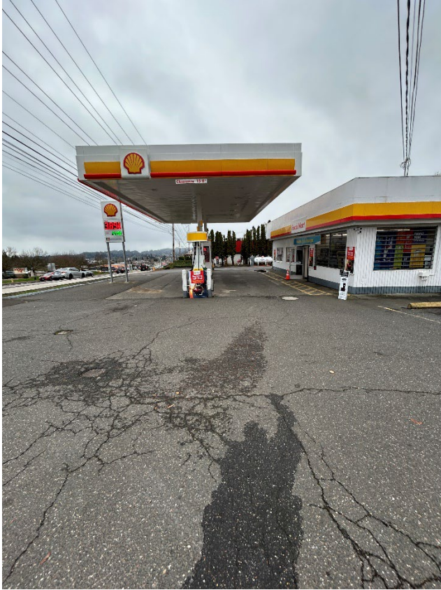
1: 11465 SW Pacific Hwy, Tigard, OR 97223

FACILITY NAME: Jackson Energy #5004/#1325 Page 1 INSPECTION DATE: December 16, 2025