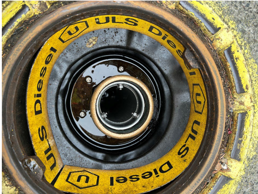
7: Diesel fill