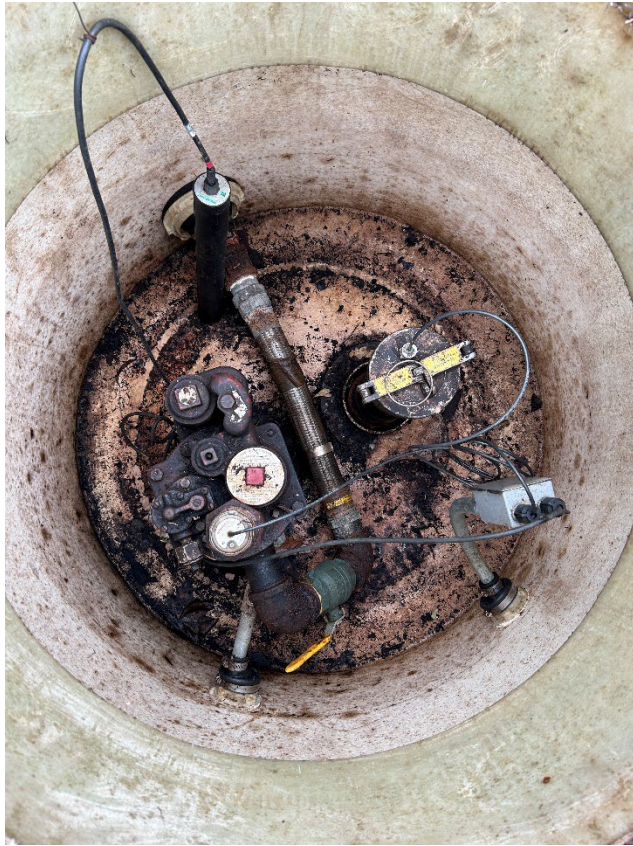
9: Diesel sump