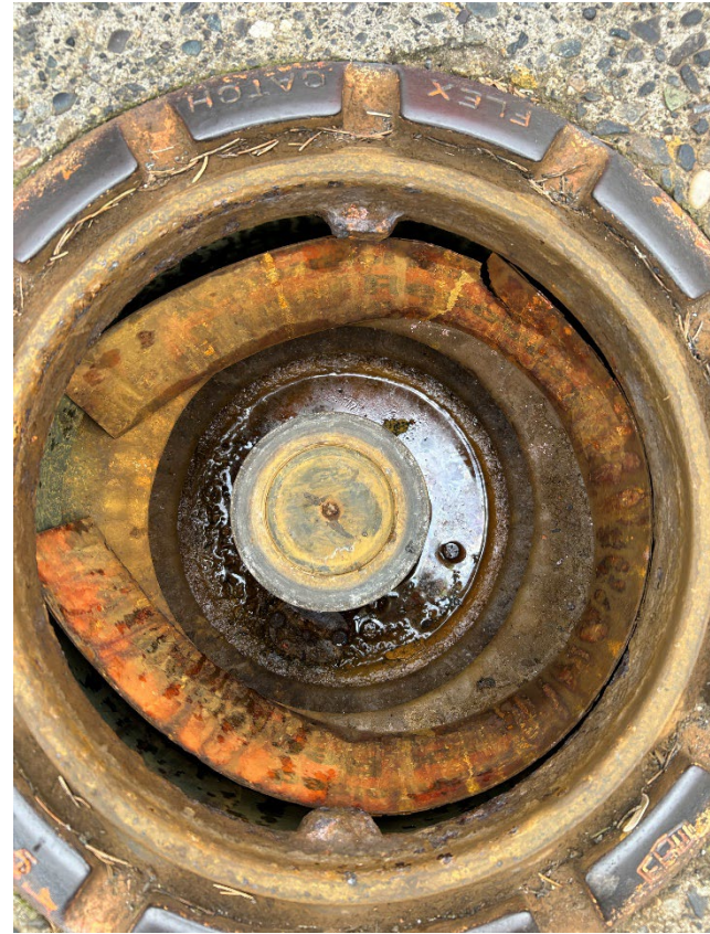
14: Unleaded plus vapor return