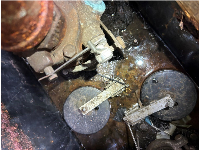
27: UDC #5/6