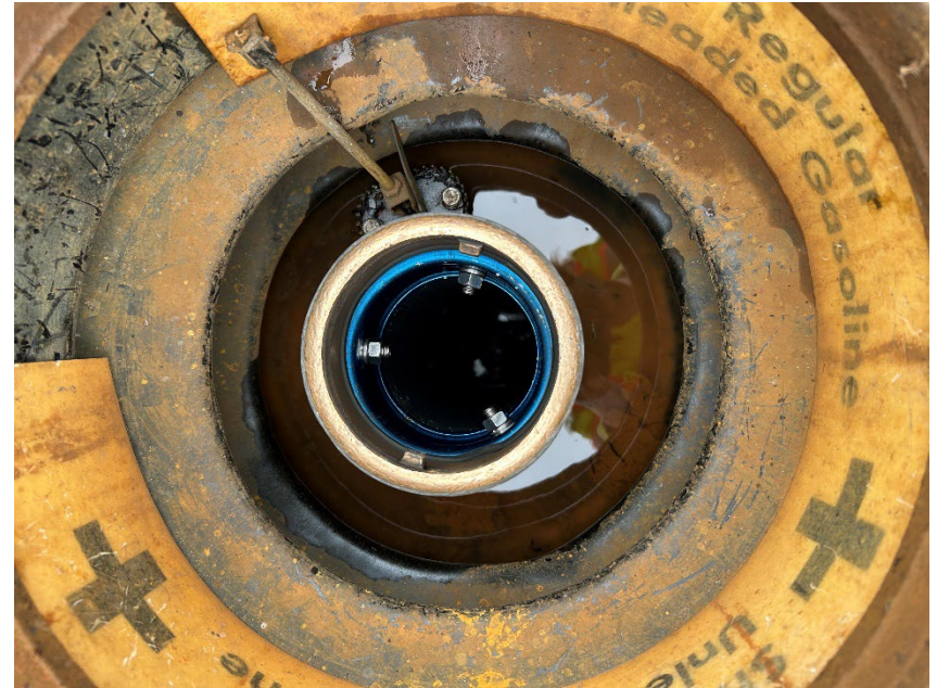
10: Regular fill