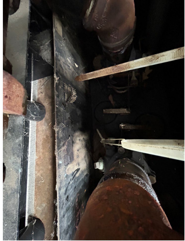
20: UDC #3/4