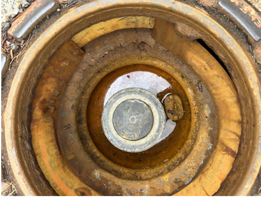
11: Regular vapor return