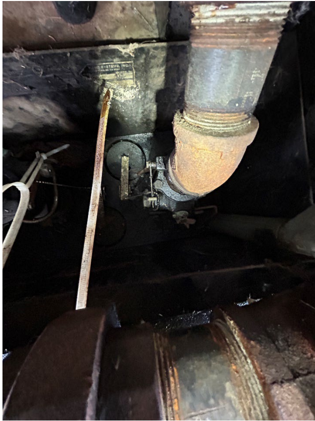
23: UDC #3/4 zip tie on shear valve