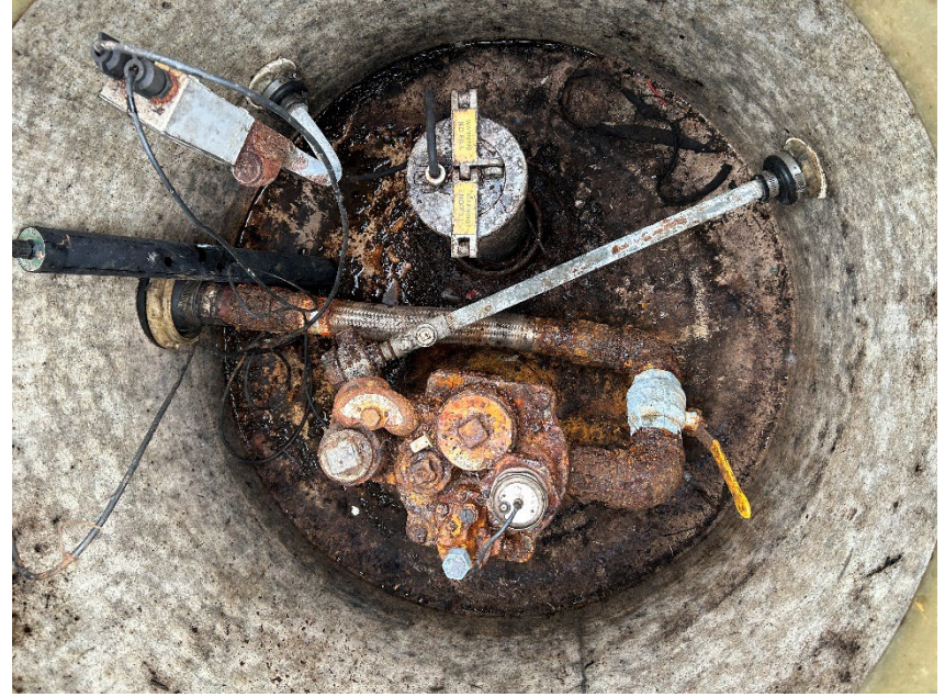
12: Regular sump