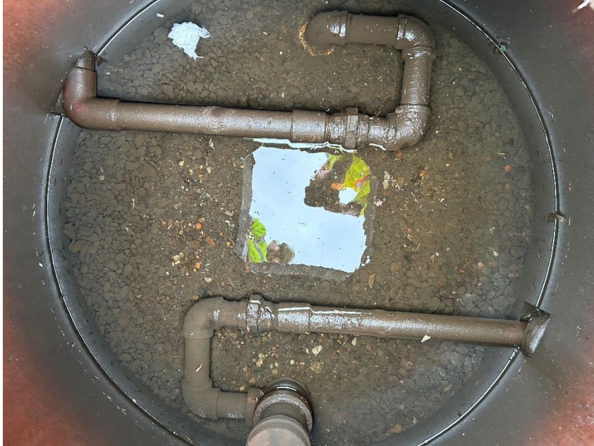
15: Transition sump for regular plus