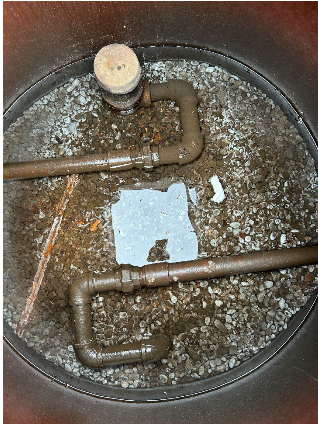
5: Transition sump with water