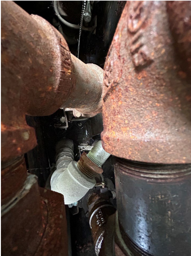
25: UDC #5/6