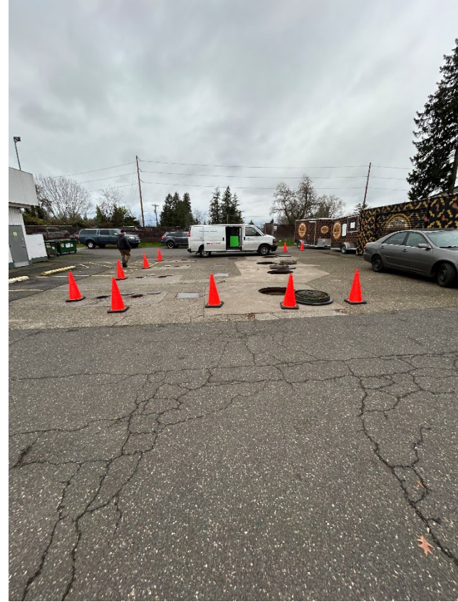
2: Tank nest looking north