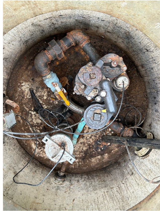
16: Regular plus sump