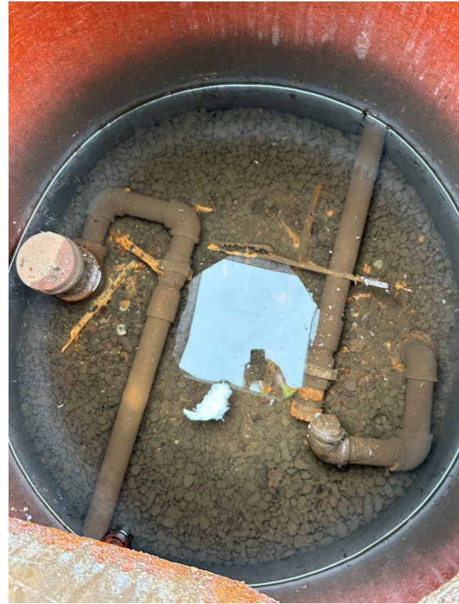
8: Transition sump for Diesel with water