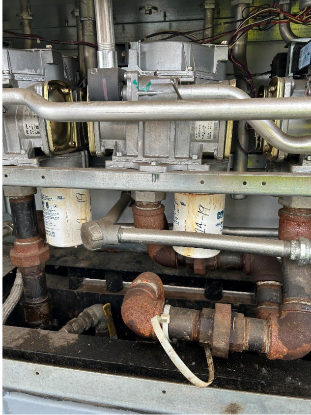
29: UDC #3/4 with zip tie on regular shear valve