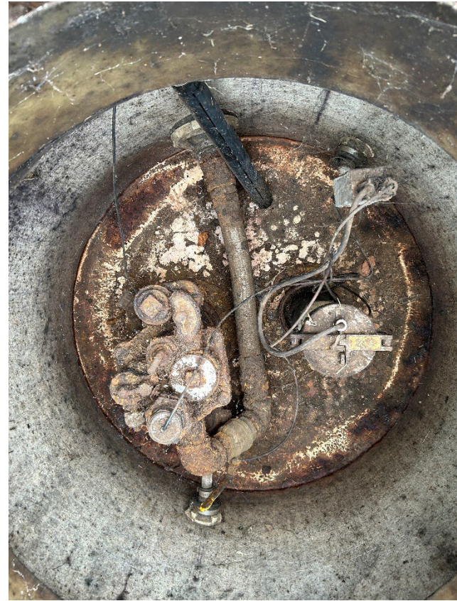
6: Premium sump