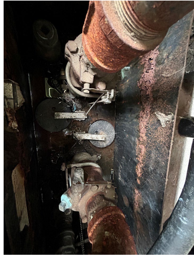
24: UDC #5/6