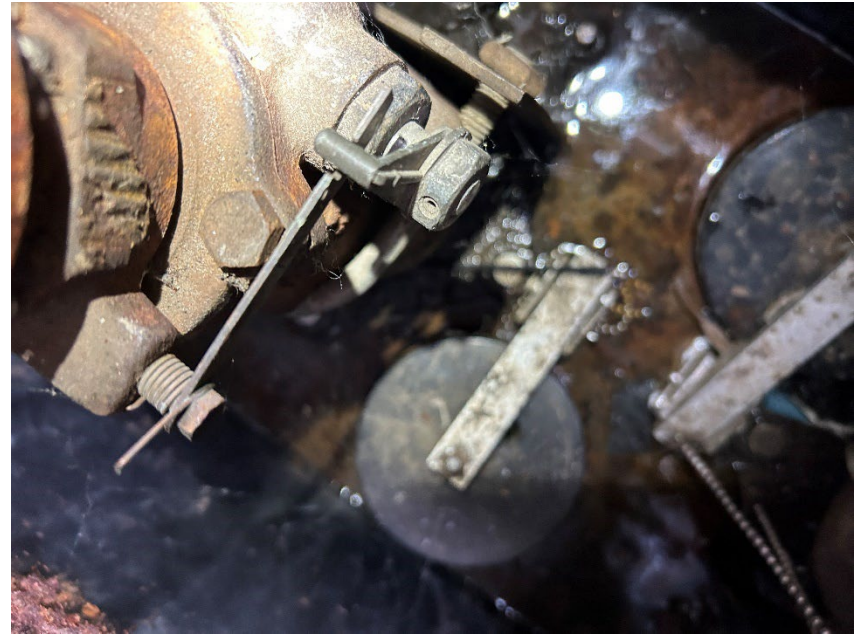
28: UDC #5/6