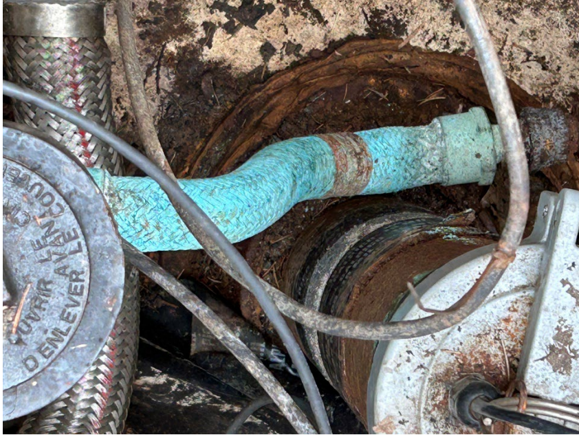
17: Flex pipe in regular plus sump