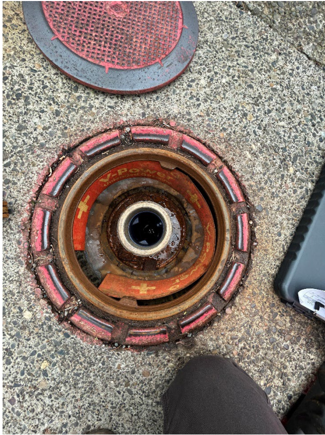
3: Premium fill