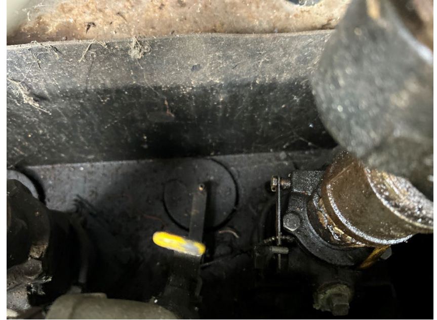
18: UDC #1/2