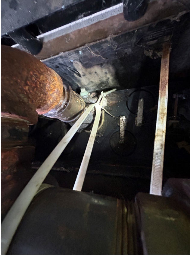
21: Zip tie utilized in UDC #3/4 for regular shear valve