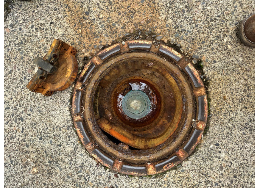
4: Premium vapor return