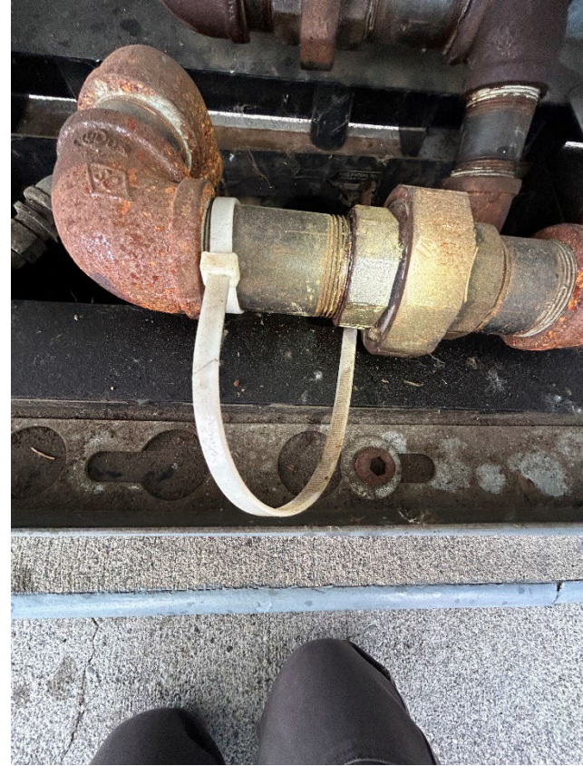
22: Zip tie in UDC #3/4