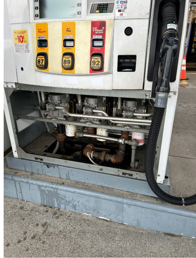
30: UDC #3/4