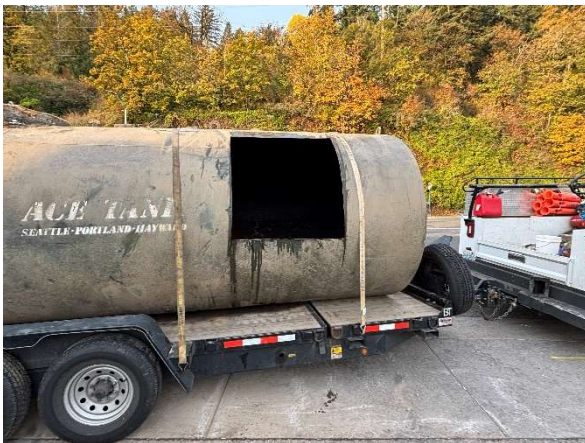
Photo #5 View of removed diesel UST strapped on trailer for transport to recycling facility