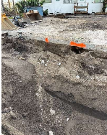
Photo #3 View of imported sandy soil located within UST pit. Diesel and kerosene USTs removed