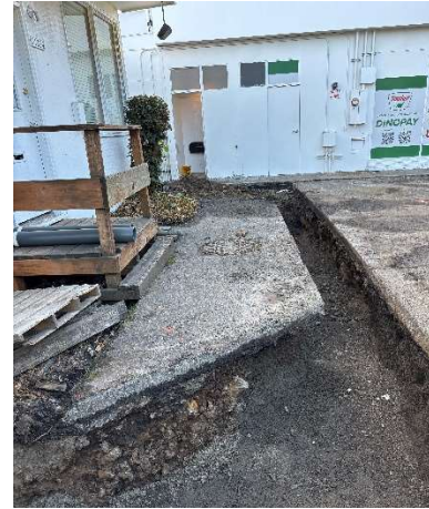
Photo #8 Trench for new vent piping for USTs located adjacent to on-site vacant building