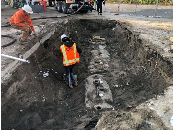
Photo #1 Looking South at Kerosene and Diesel USTs prior to removal

Project No. 10681-001.00 ■ Photo Date: October 23, 2025