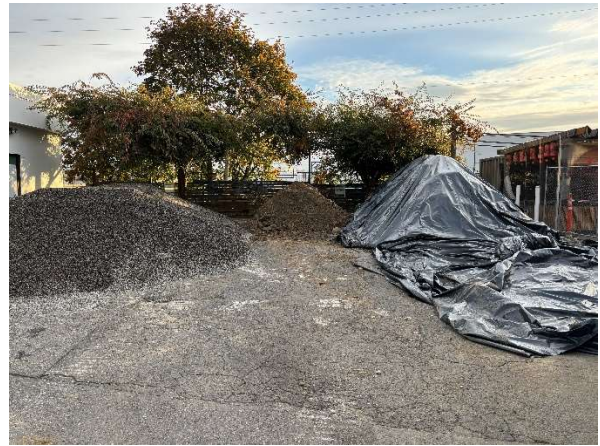
Photo #2 Stockpiled impacted overburden, located south of convenience store building