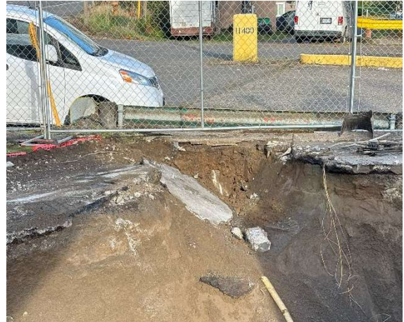
Photo #10 Collecting soil sample under former kerosene dispenser location after dispenser removal