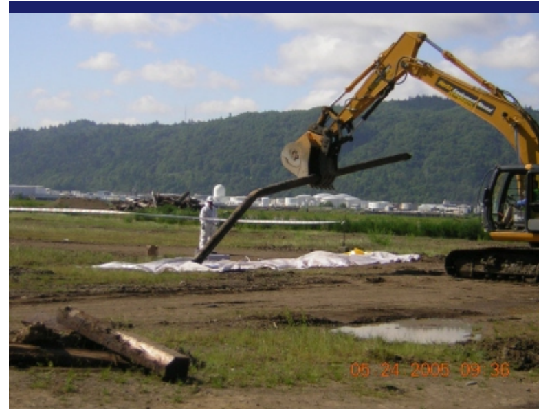
Photo 6 Asbestos pipe being placed on 6 mil plastic sheeting as part of the asbestos abatement. Direction: West