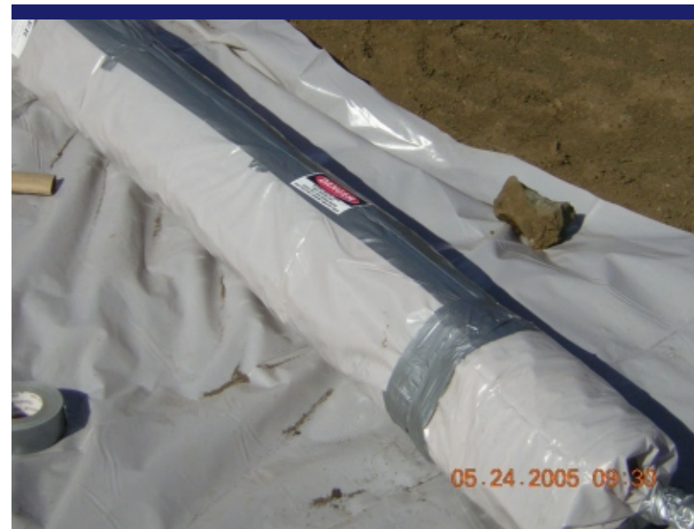
Photo 8 Close up of asbestos pipe completely wrapped in two layers of plastic sheeting. Direction: