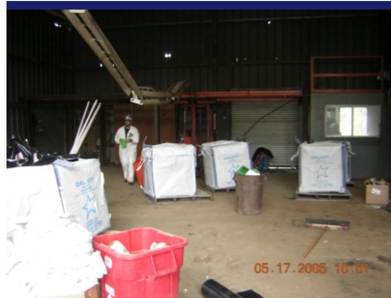
Photo 2 Hazardous material from shop building being placed in super sacks for off-site disposal. Direction: Southwest