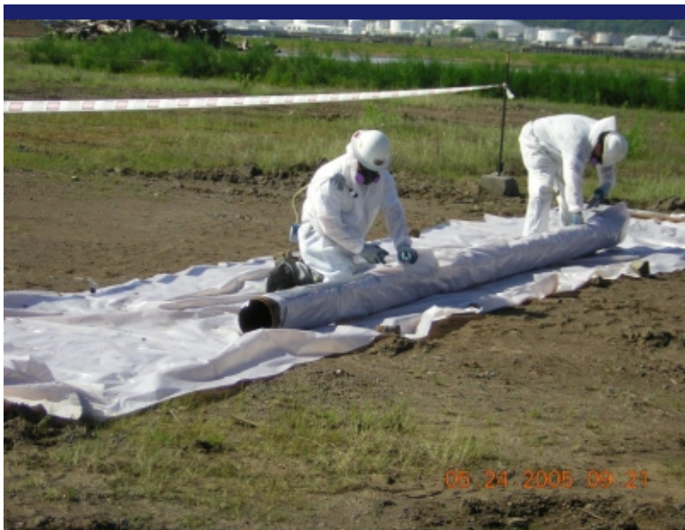
Photo 7 Asbestos pipe being wrapped by PAS, Inc. in two layers of 6 mil plastic sheeting. Direction: West