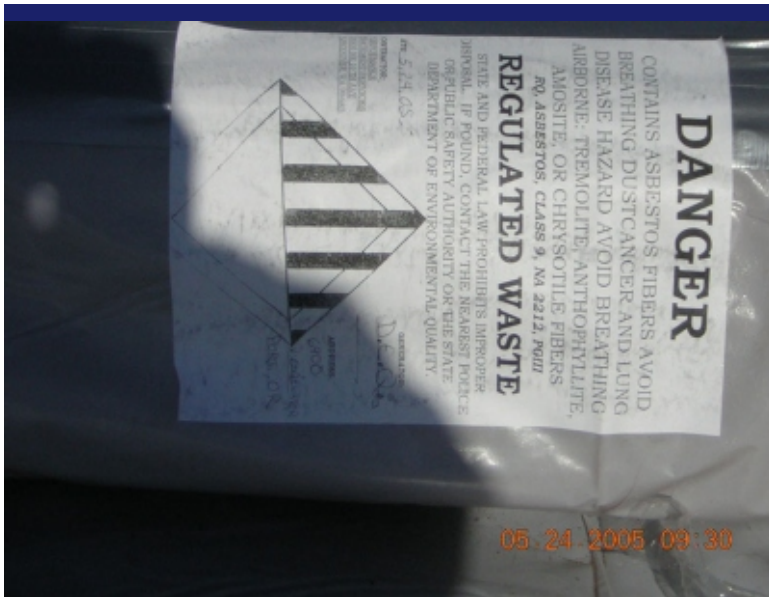
Photo 9 Asbestos hazard label affixed to each wrapped pipe. Direction: