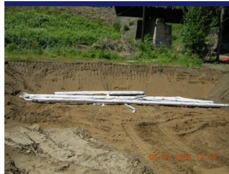
Photo 10 Disposal pit for buried asbestos pipe after it has been wrapped. Located in N corner of site. Direction: Northwest