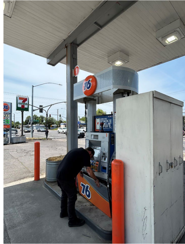
4: Dispenser 1/2