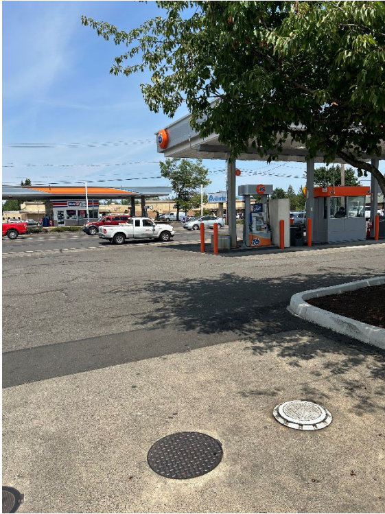
View of Service Island