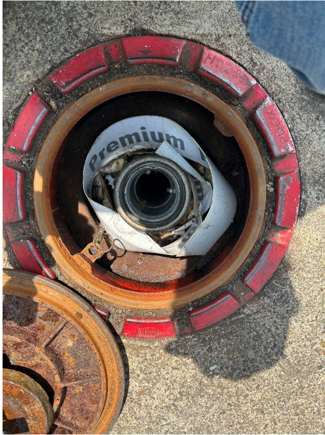
1: Premium fill