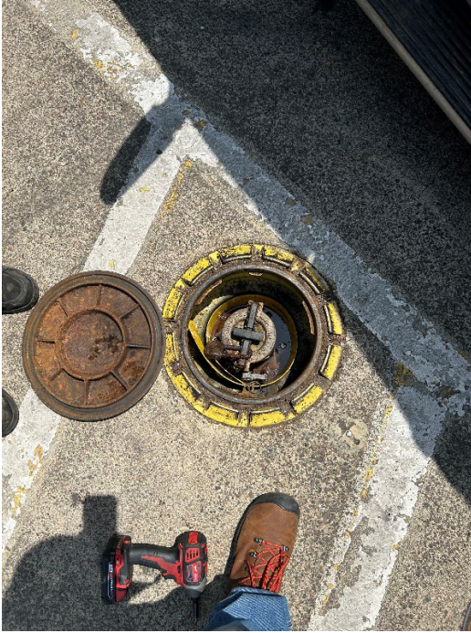
View of diesel fill