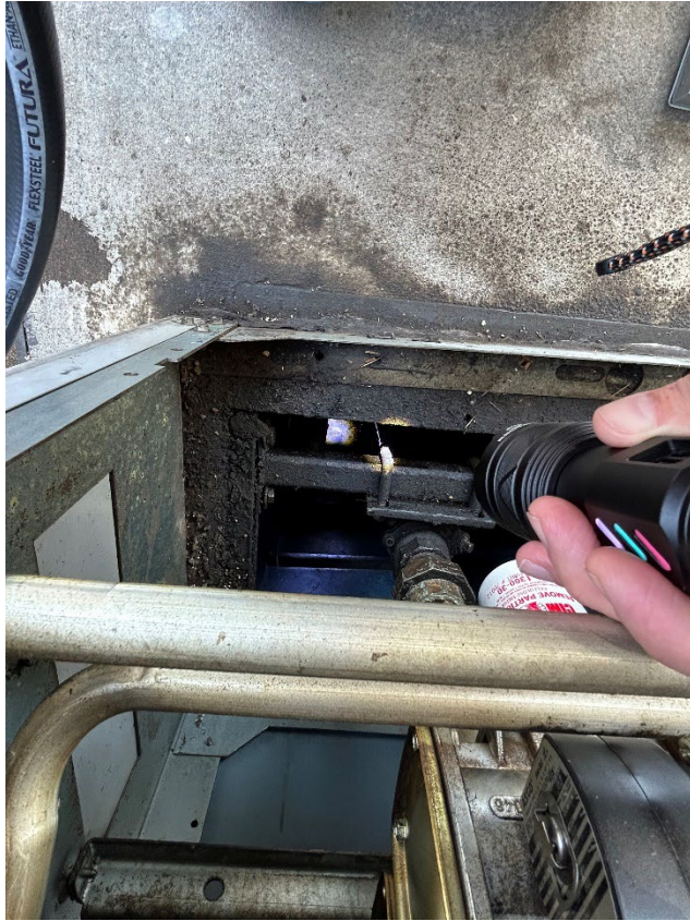
5: View below Dispenser 1/2