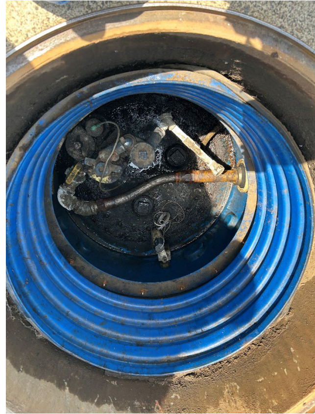
2: Diesel tank top