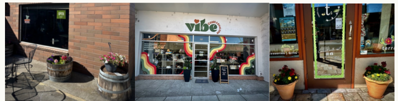
Helping Downtown Bloom — One Planter at a Time @ La Golosa