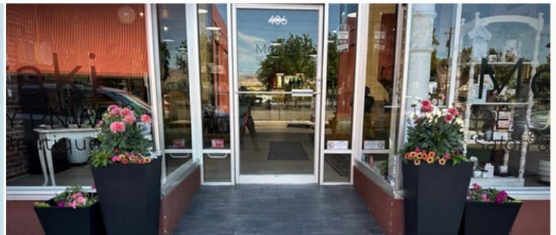
Colorful florals at Meraki