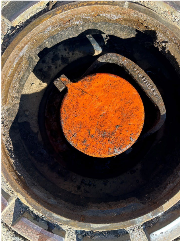
5: Regular vapor return