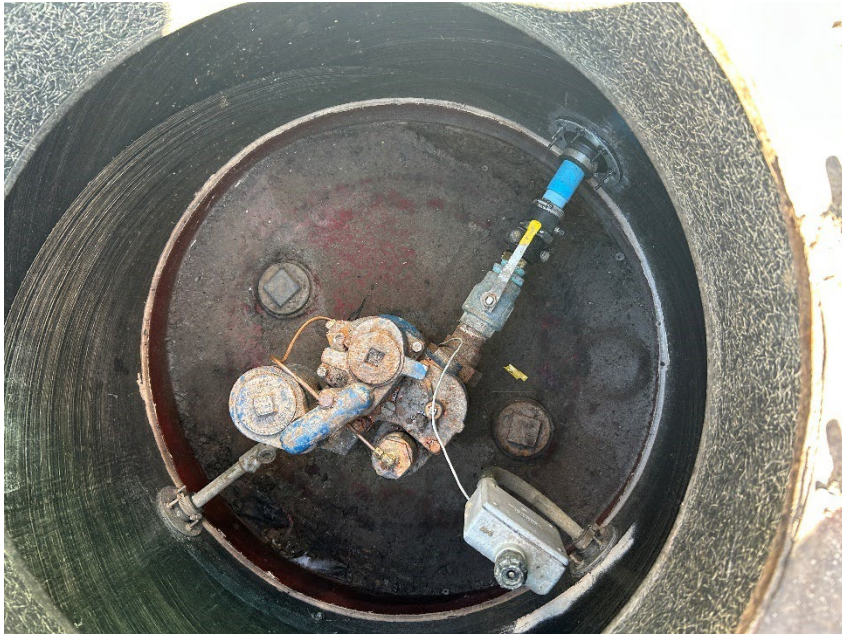
7: Premium sump