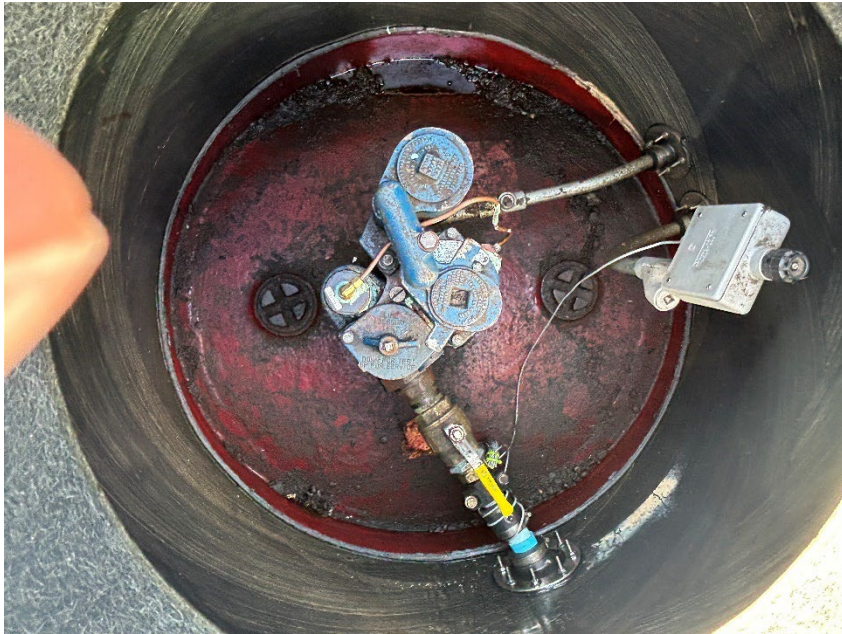
11: Diesel sump