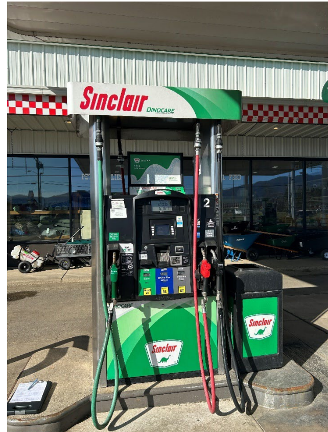
12: Dispenser #1/2