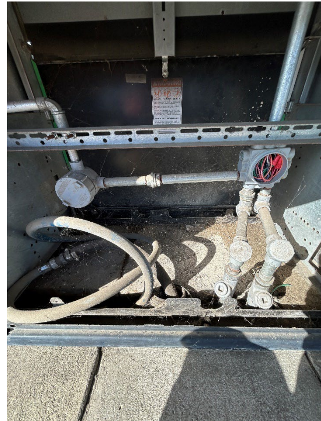
18: UDC for DEF