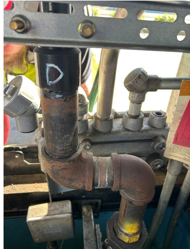
16: Diesel line in UDC# 7/8 potential source of release