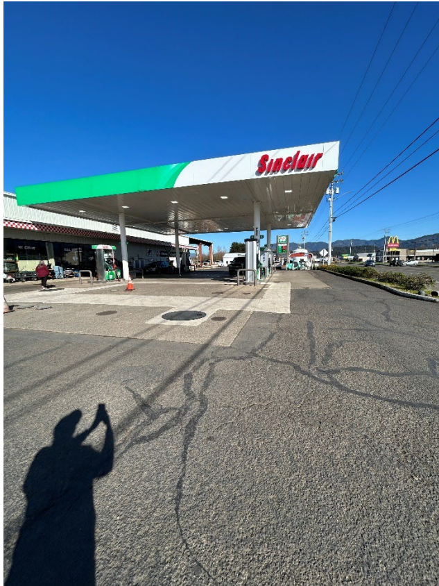
1: 1920 Main Ave N, Tillamook, OR 97141