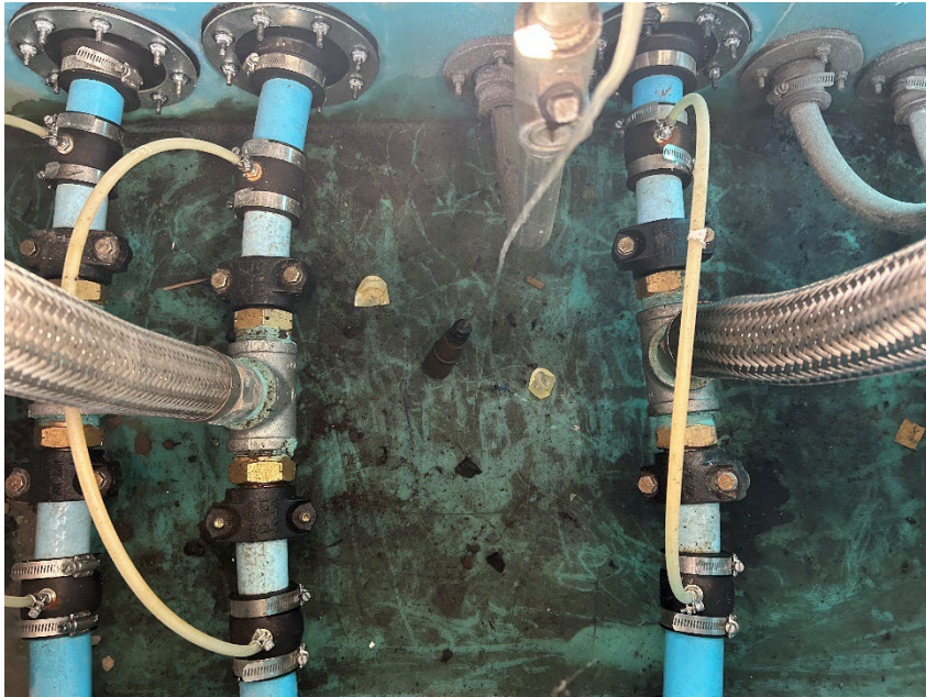
13: UDC #2