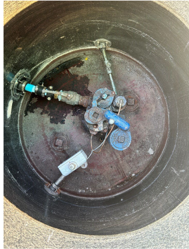
4: Regular sump