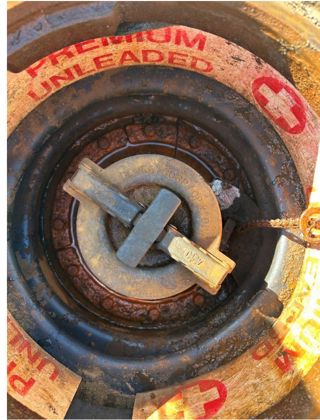
6: Premium fill