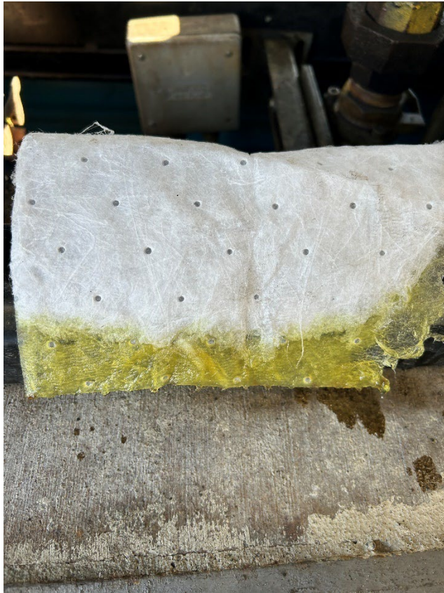
15: Potential release in UDC #7/8