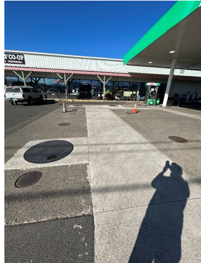
2: Tank nest looking west