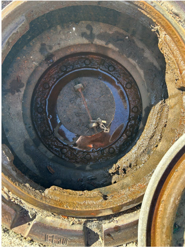
9: capped-off vapor return for diesel