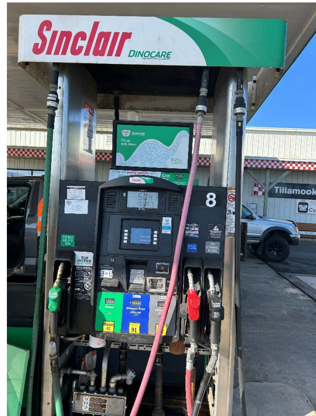
14: Dispenser #7/8