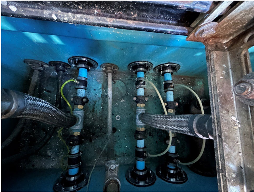
19: UDC #5/6