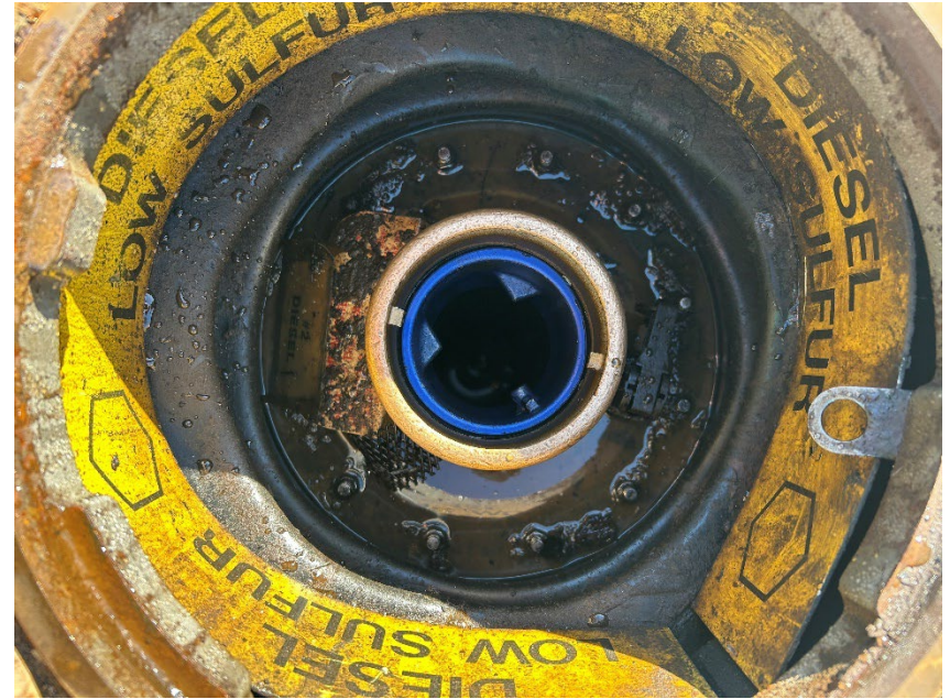
8: Diesel fill