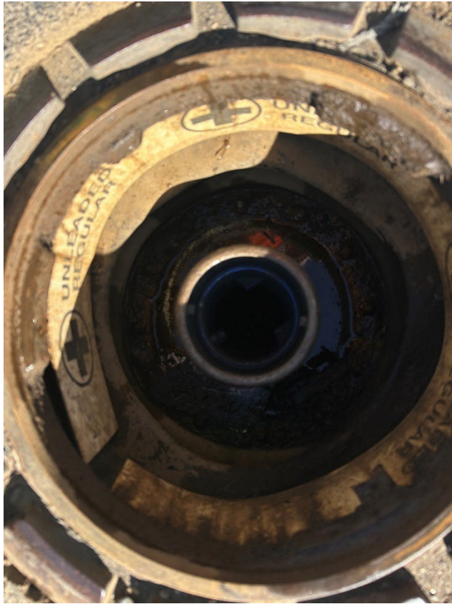
3: Regular fill