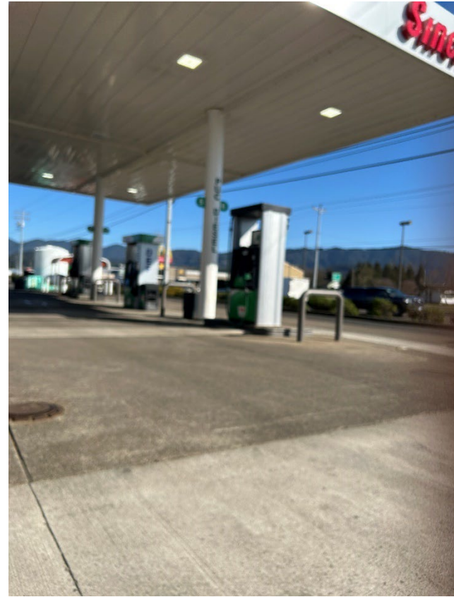
10: Dispenser area