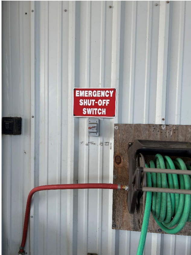
21: Emergency shut-off switch