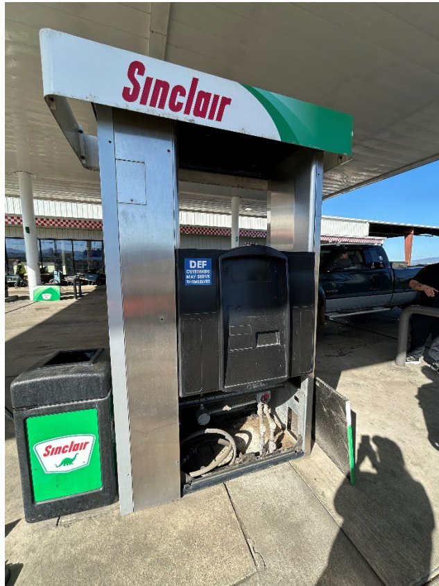
17: DEF dispenser piped to above ground tank