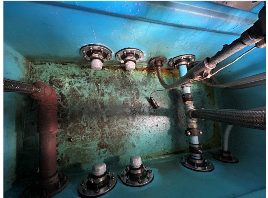
20: UDC #3/4