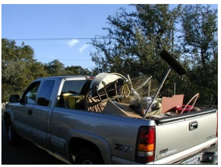
No loads larger than a standard sized pickup will be accepted. Household limit is two standard sized pickup loads (or equivalent if towing a trailer).

Please bring household clean up items only. No business or commercial waste will be accepted.