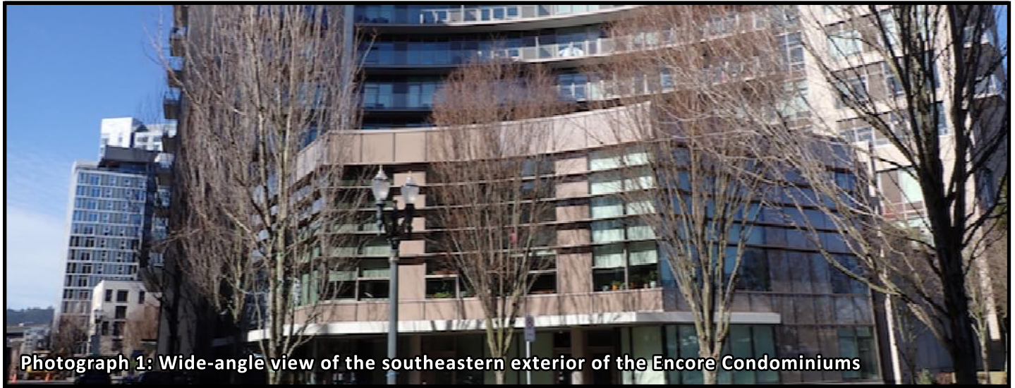
Photograph 1: Wide-angle view of the southeastern exterior of the Encore Condominiums