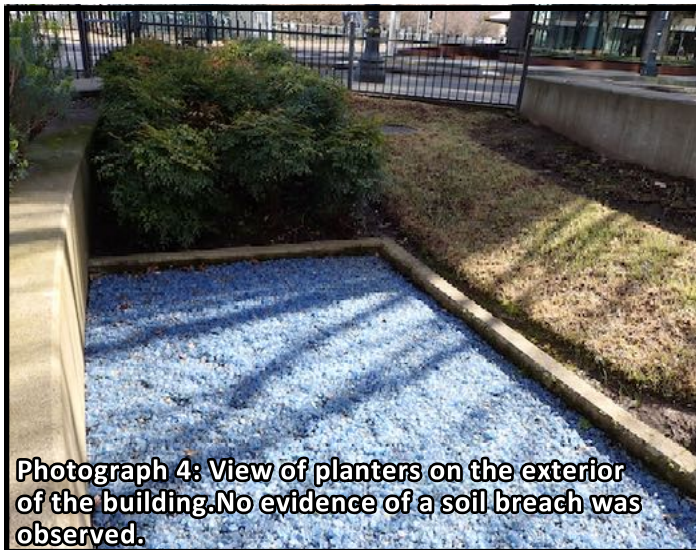
Photograph 4: View of planters on the exterior of the building. No evidence of a soil breach was observed.