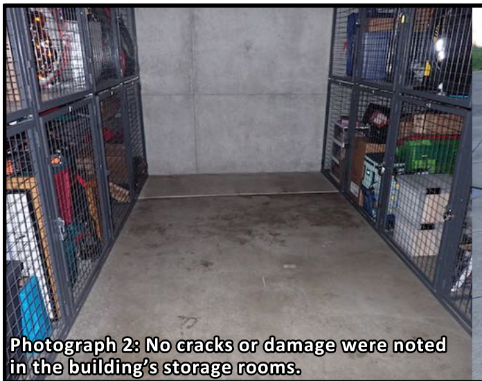
Photograph 2: No cracks or damage were noted in the building's storage rooms.