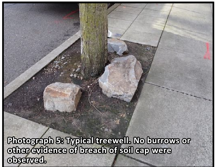
Photograph 5: Typical treewell. No burrows or other evidence of breach of soil cap were observed.