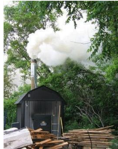
Outdoor Wood Boiler