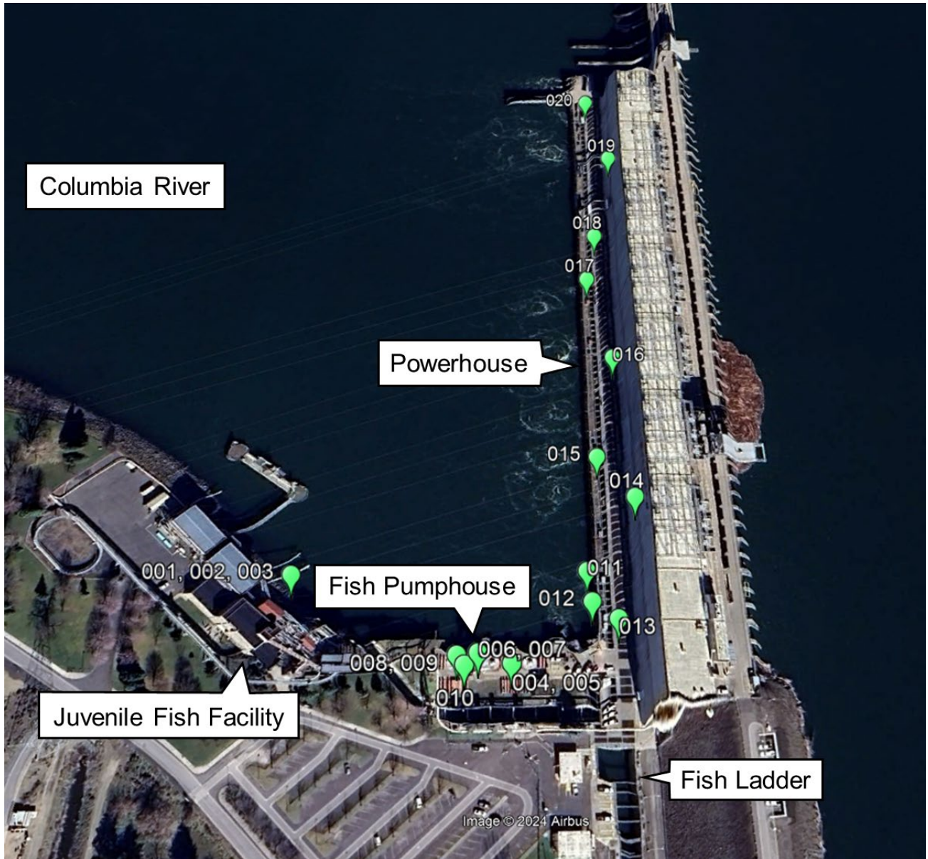
Figure 2-1: Facility Site Map