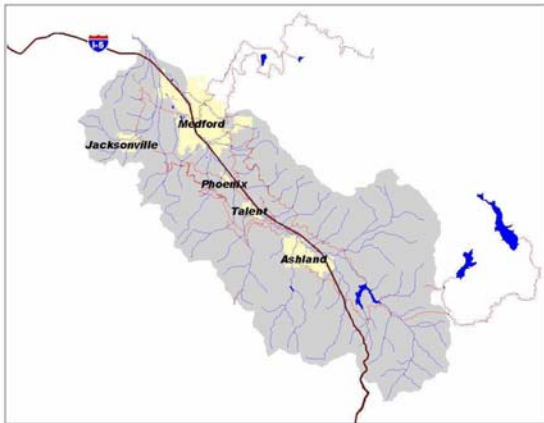
Bear Creek Watershed TMDL Area

The health of any watershed depends on good water quality. Many waterbodies in Oregon do not meet all water quality standards. In the Bear Creek Watershed, over 311 miles of creeks do not meet standards for bacteria, temperature, and sedimentation. When waterbodies do not meet water quality standards, DEQ is required to develop limits for how much of a pollutant a waterbody can receive and still meet water quality standards. The limits are designed to restore the health of the watershed. These limits are called Total Maximum Daily Loads (TMDLs).