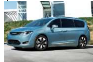
Chrysler Pacifica PHEV