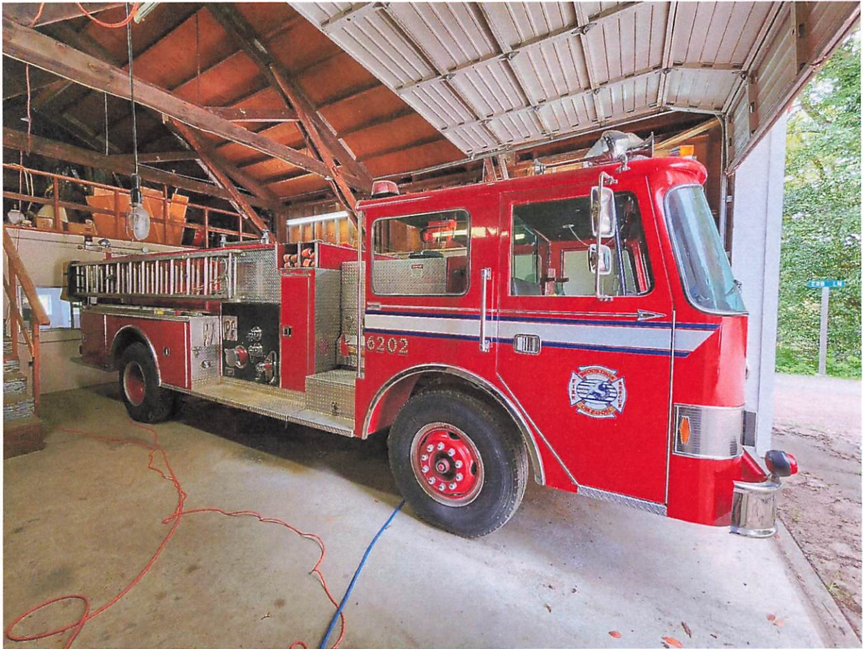
This is the 1983 Pierce Arrow Fire Engine, Reserve 6202, which is housed at the Upper Chetco Rural Volunteer Fire Station. The vehicle has a 750 gallon tank with a 1,250 gallon per minute pump. It has two open jump seats and can fit 3 people in the front cab.