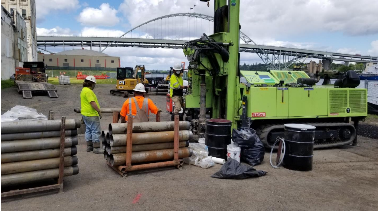
Photograph shows sonic drill rig used to install extraction wells along the Tanner Creek Sewer on May 6, 2020.