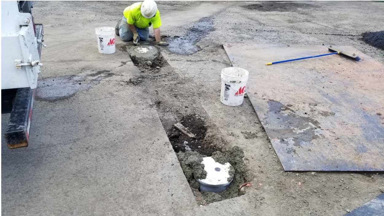
Photograph shows extraction wells installation nearly complete at the Tanner Creek Sewer site on May 6, 2020. These monuments will be removed during Phase I groundwater extraction system installation.