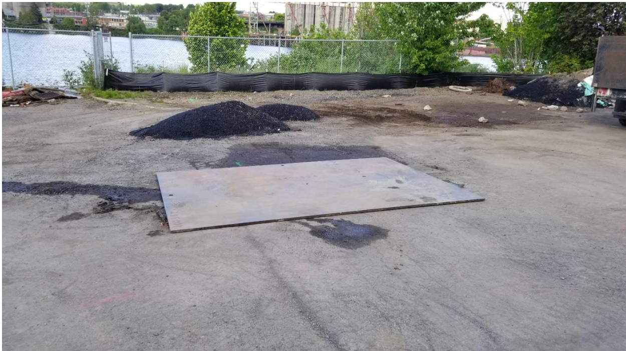
Photograph shows extraction wells temporarily covered with steel plate by tenants of the site on May 6, 2020.