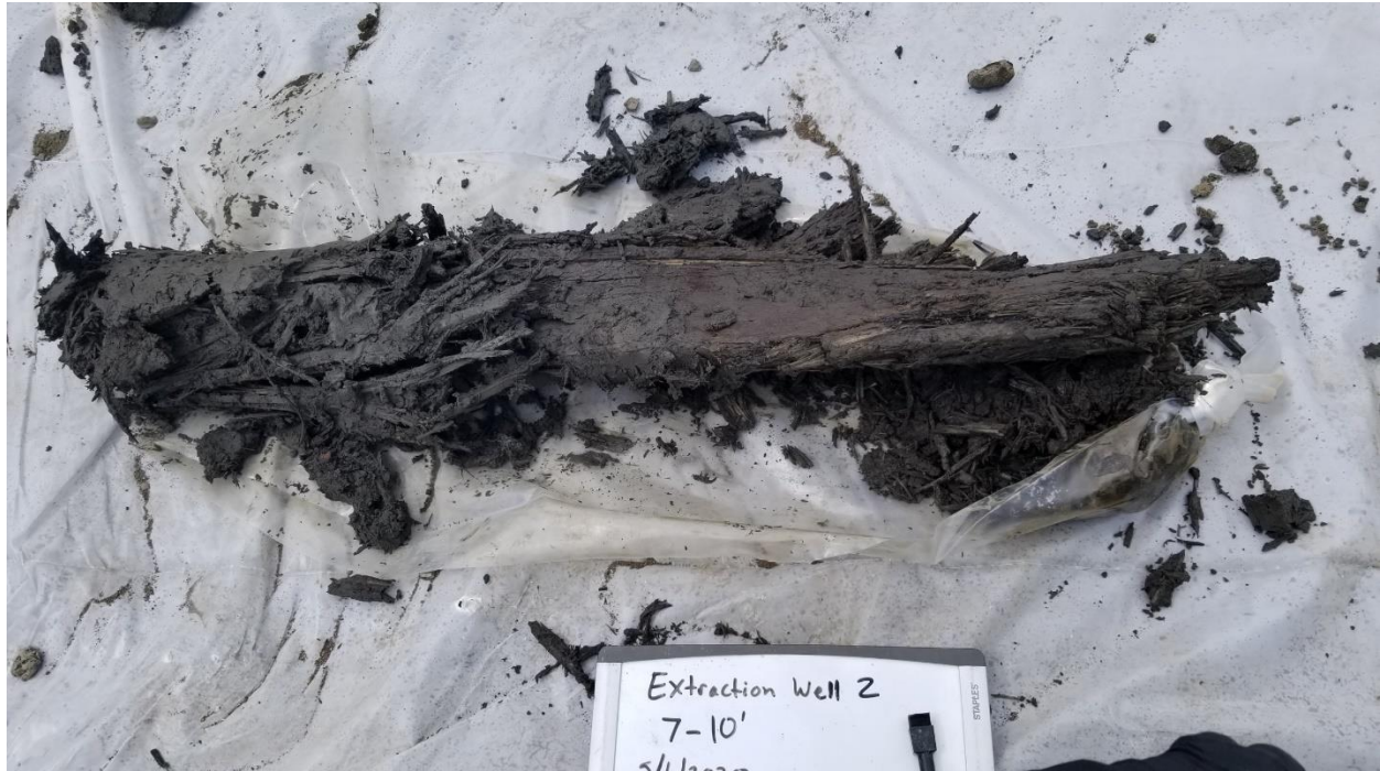
Photograph shows woody debris removed from 7-10 feet below ground surface in Extraction Well 2 along the north side of the Tanner Creek Sewer. Dated May 6, 2020.