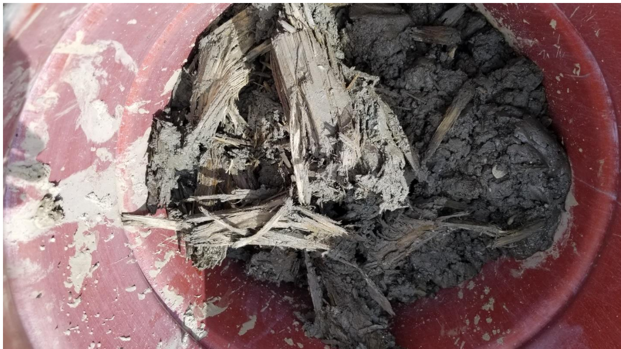
Photograph shows representative woody debris and soil removed from sonic borings during installation of Extraction Wells 1 and 2. Dated May 6, 2020.