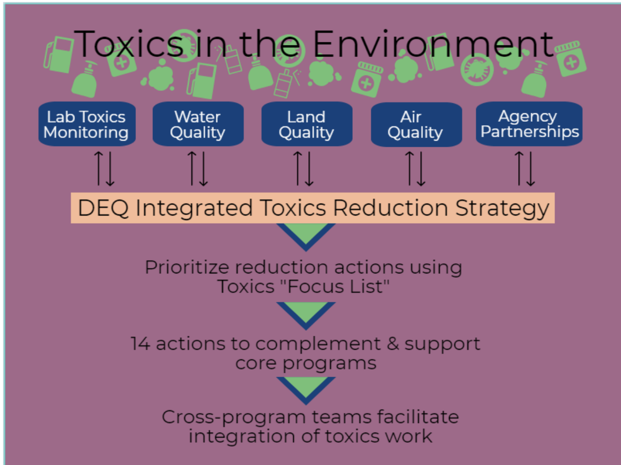
Figure 1: Integrated Toxics Reduction Strategy and connection to core programs