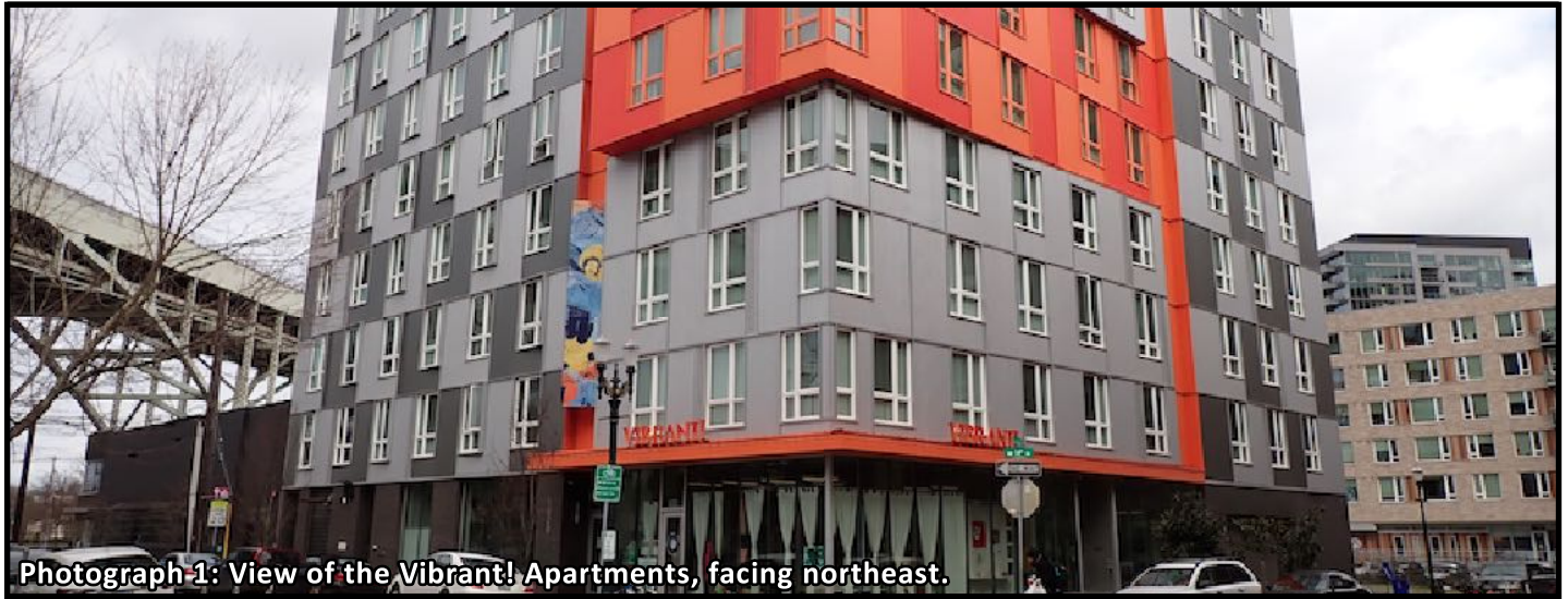
Photograph 1: View of the Vibrant! Apartments, facing northeast.