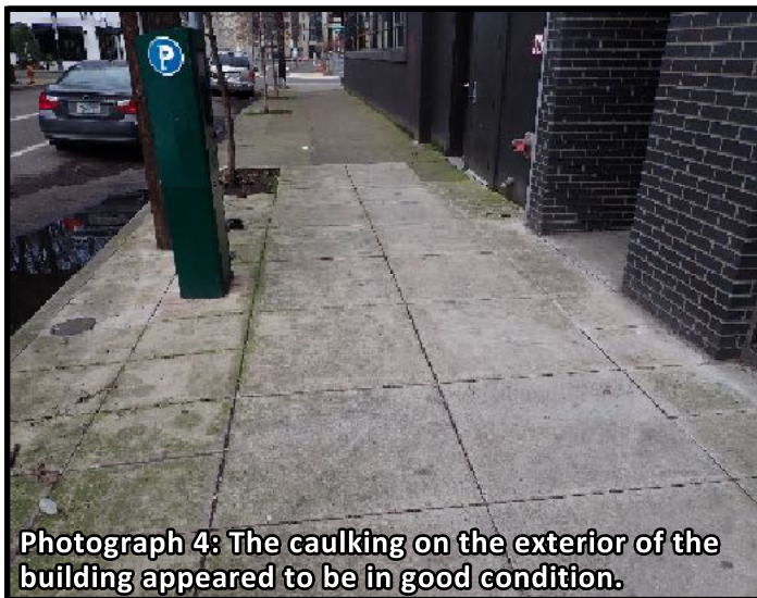
Photograph 4: The caulking on the exterior of the building appeared to be in good condition.