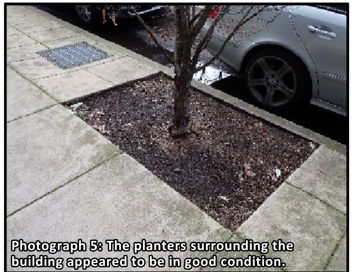
Photograph 5: The planters surrounding the building appeared to be in good condition.