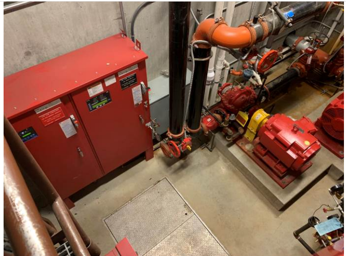
10. Fire pump room