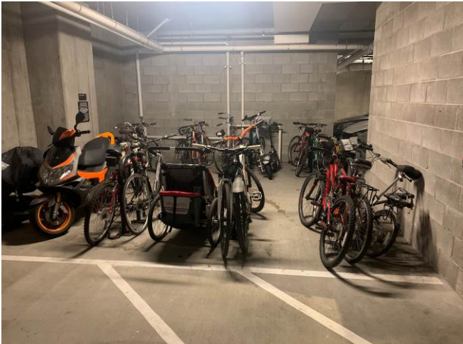
1. Bike Storage Area #1 in subterranean parking garage