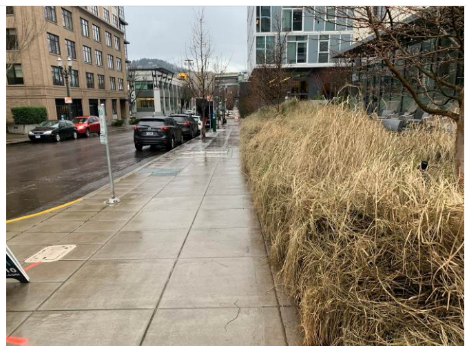
18. Landscape and hardscape along NW Overton St