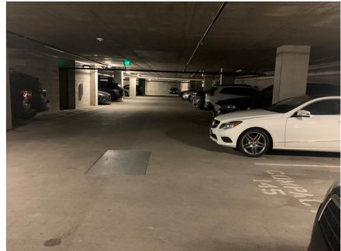
4. Parking garage/building foundation view B