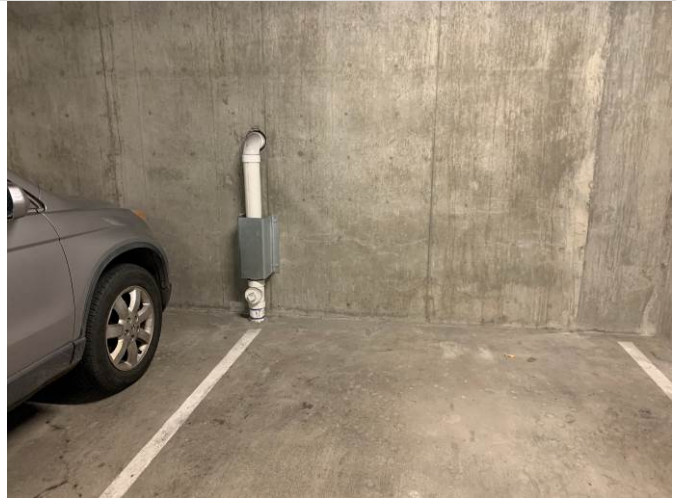
8. Utility penetration in parking garage/building foundation