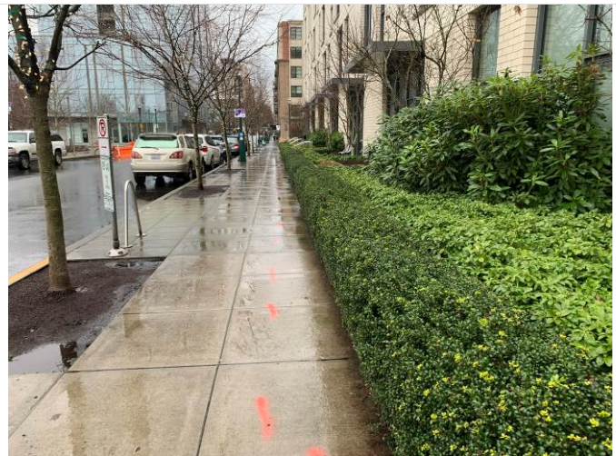
16. Landscape and hardscape along NW 11 th Ave