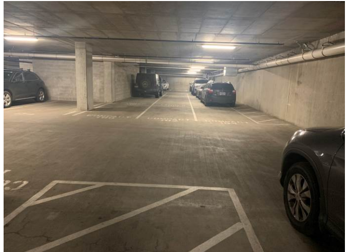
2. Parking garage/building foundation view A