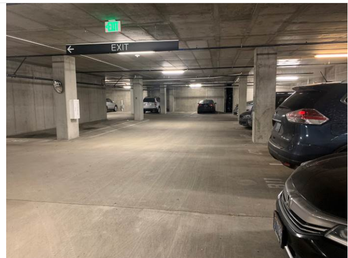
6. Parking garage/building foundation view C