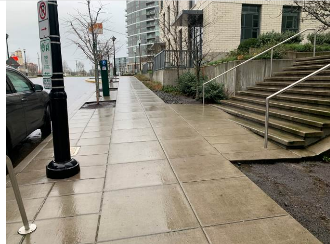
13. Hardscape along NW Pettygrove St