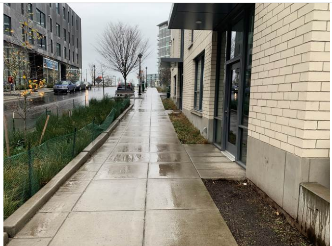
12. Landscape and hardscape along NW Pettygrove St