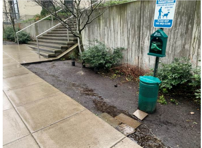
14. Landscape along NW Pettygrove St