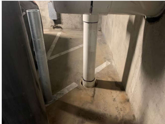
3. Utility penetration in parking garage/building foundation