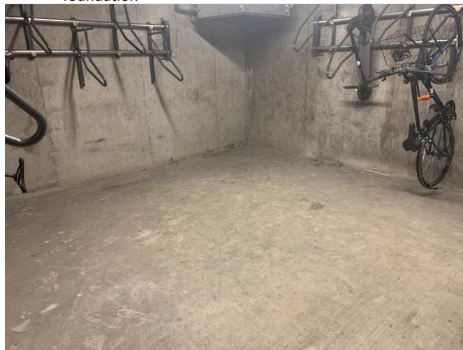
5. Bike Storage Area #2 in parking garage