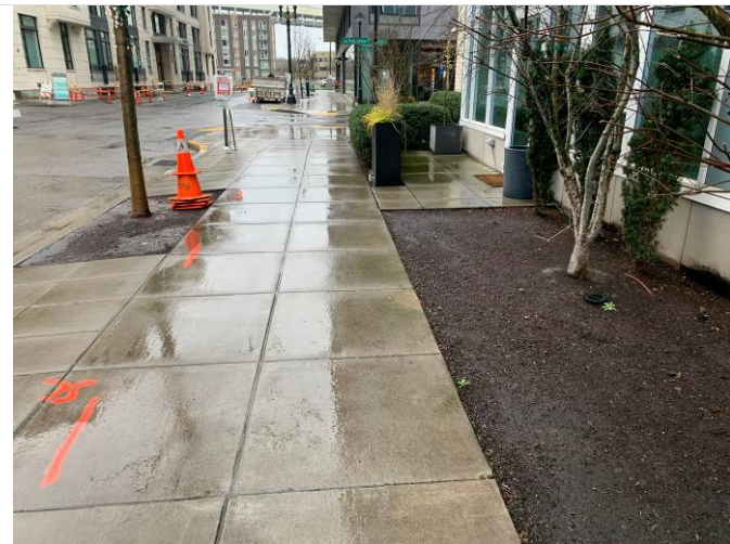
15. Landscape and hardscape along NW 12 th Ave