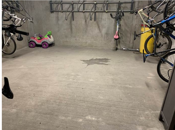
7. Bike Storage Area #3 in parking garage