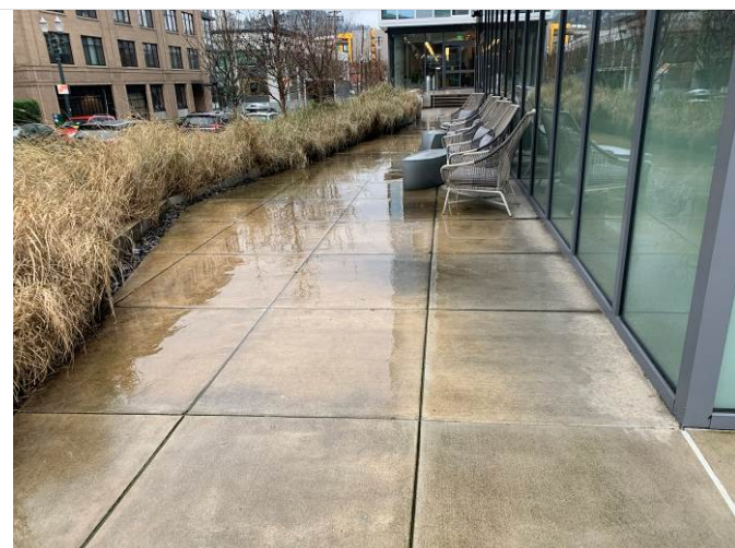
17. Hardscape along NW Overton St