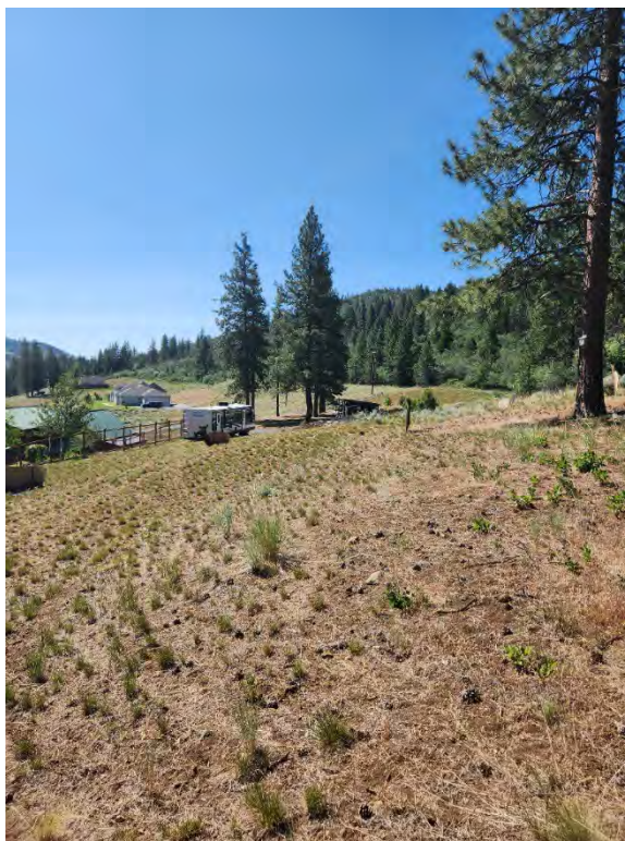
Parcel LAM – View of Parcel from Northern Corner.