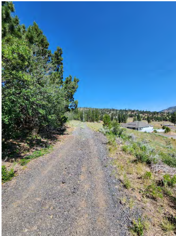
Parcel LAM – View of Parcel from Southern Corner.