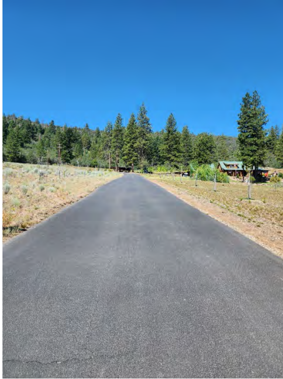
Parcel LAM – View of distressed trees, road cracks from corner looking West from East corner of Parcel.