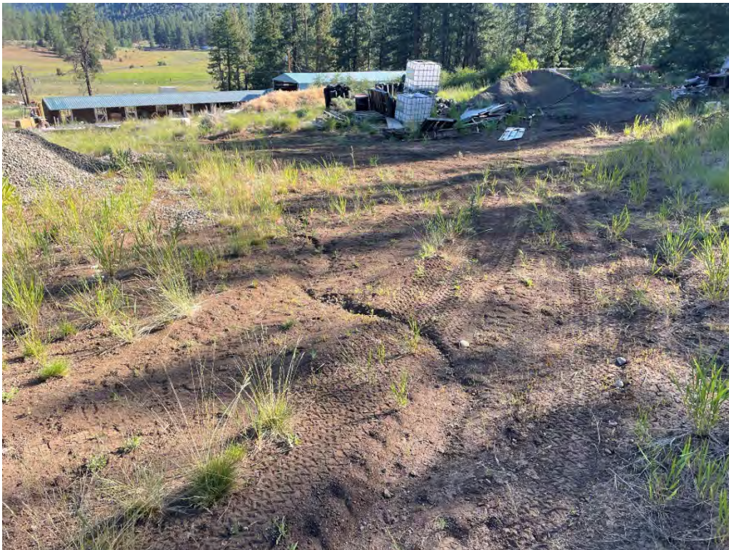
Parcel WWTP – View of new Rill near Former Digester.