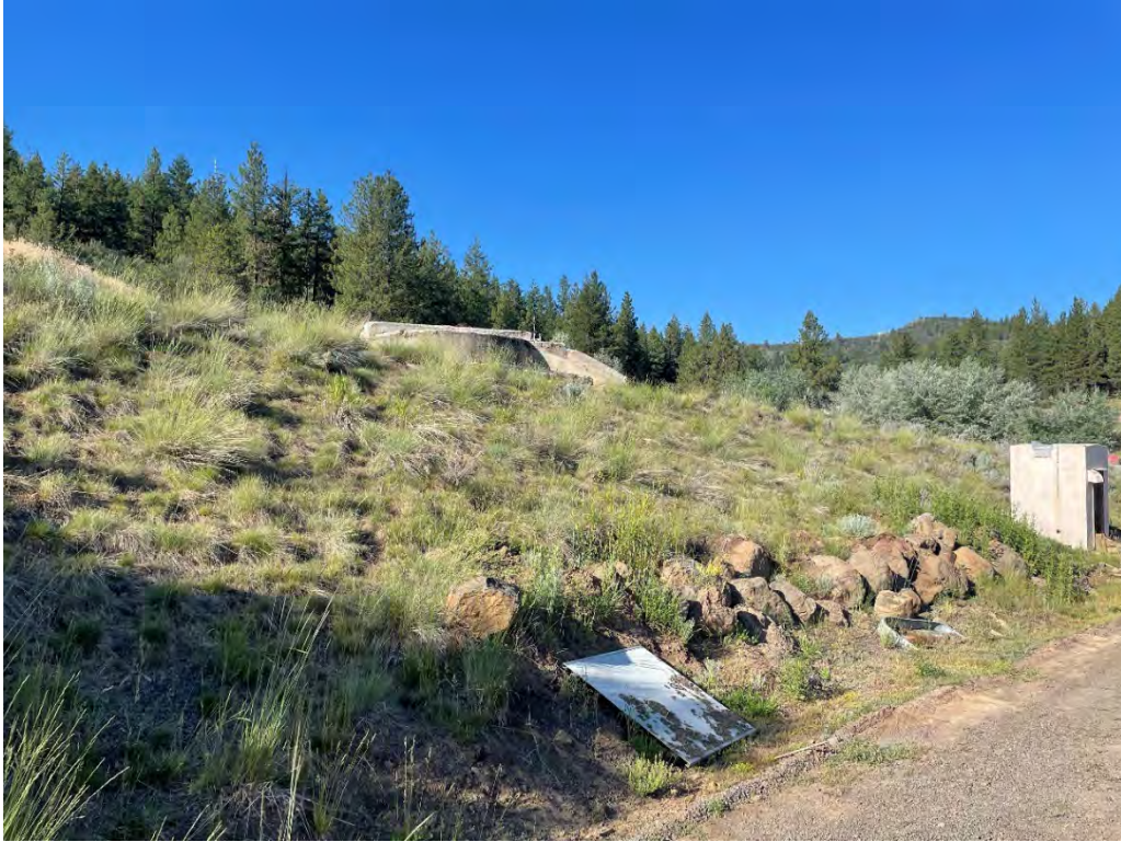
Parcel WWTP – Northeast corner looking Southwest (Former Digester visible in background).