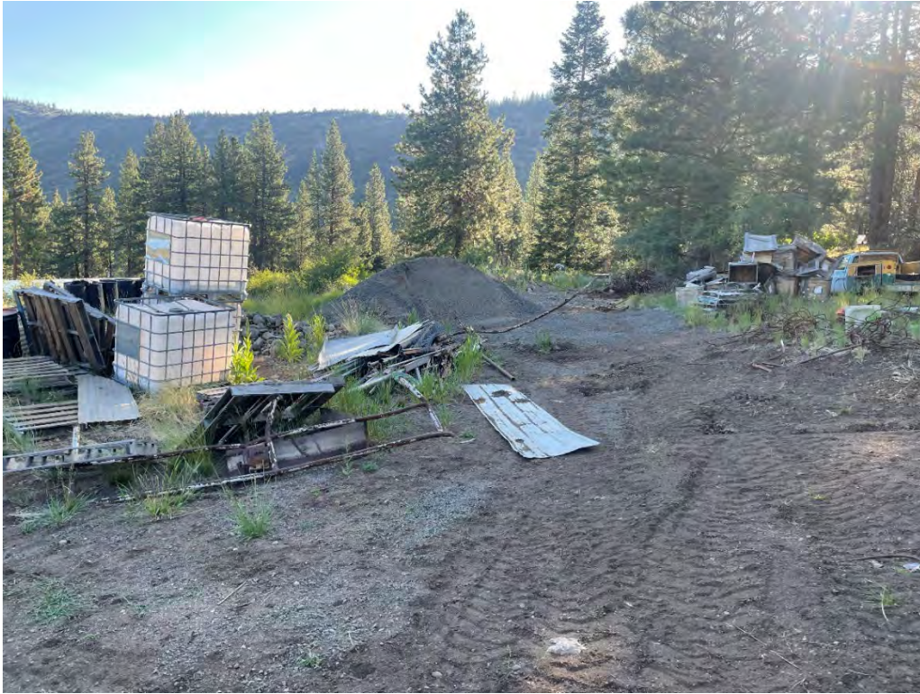
Parcel WWTP – View of new Gravel Stockpile (provided by the City for road repairs).