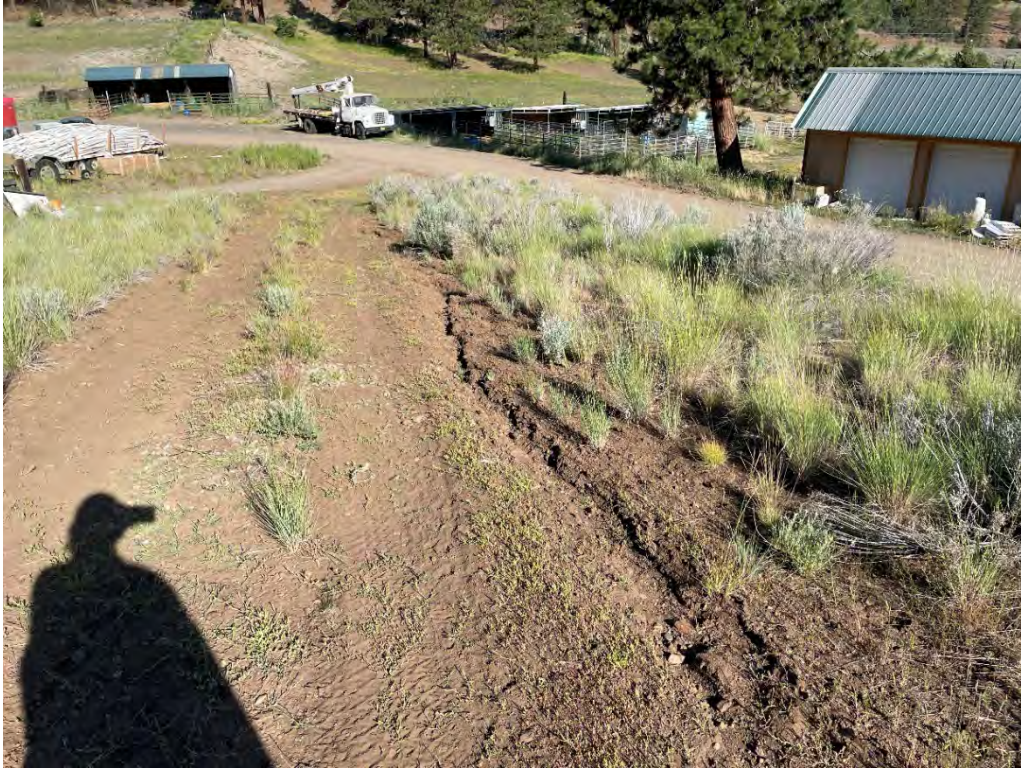
Parcel WWTP – View of new Rill alongside the dirt road.