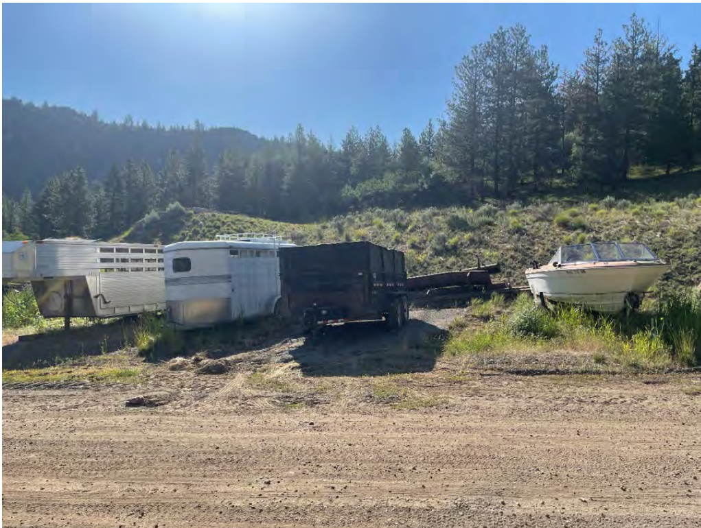
Parcel WWTP – Northwest corner looking Southeast (view of parking area).