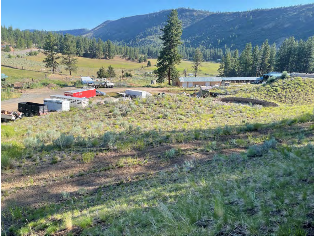
Parcel WWTP – Southwest corner looking Northeast (Former Aeration Basin visible in background).