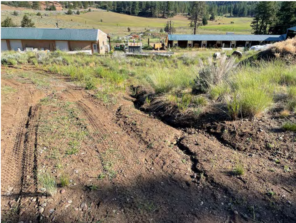
Parcel WWTP – View of new downslope Gully alongside dirt road.