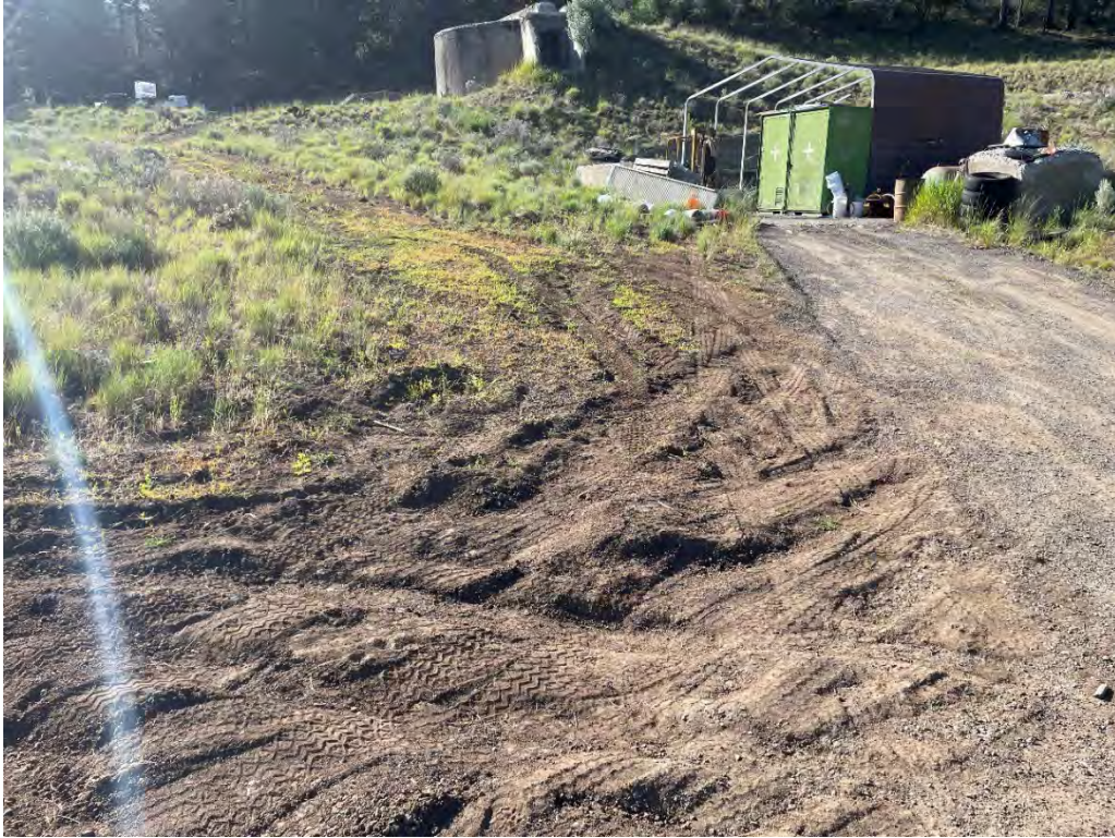
Parcel WWTP – View of new Tire Ruts at base of dirt road.