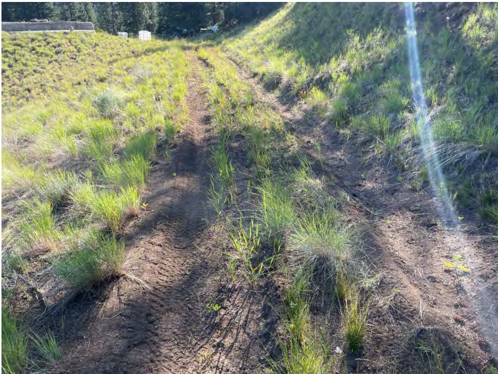
Parcel WWTP – View of new Tire Tracks on dirt road (Former Aeration Basin visible in background).