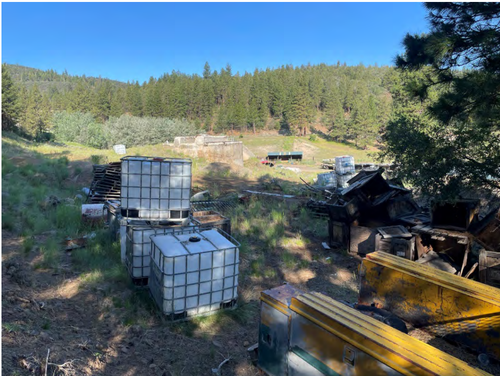
Parcel WWTP – Southeast corner looking west (view of laydown area).