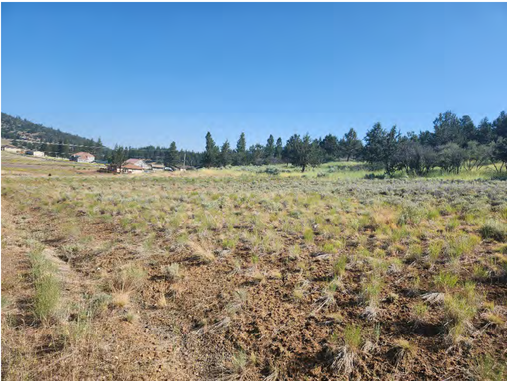
Parcel AR – View from South Central corner of Parcel.