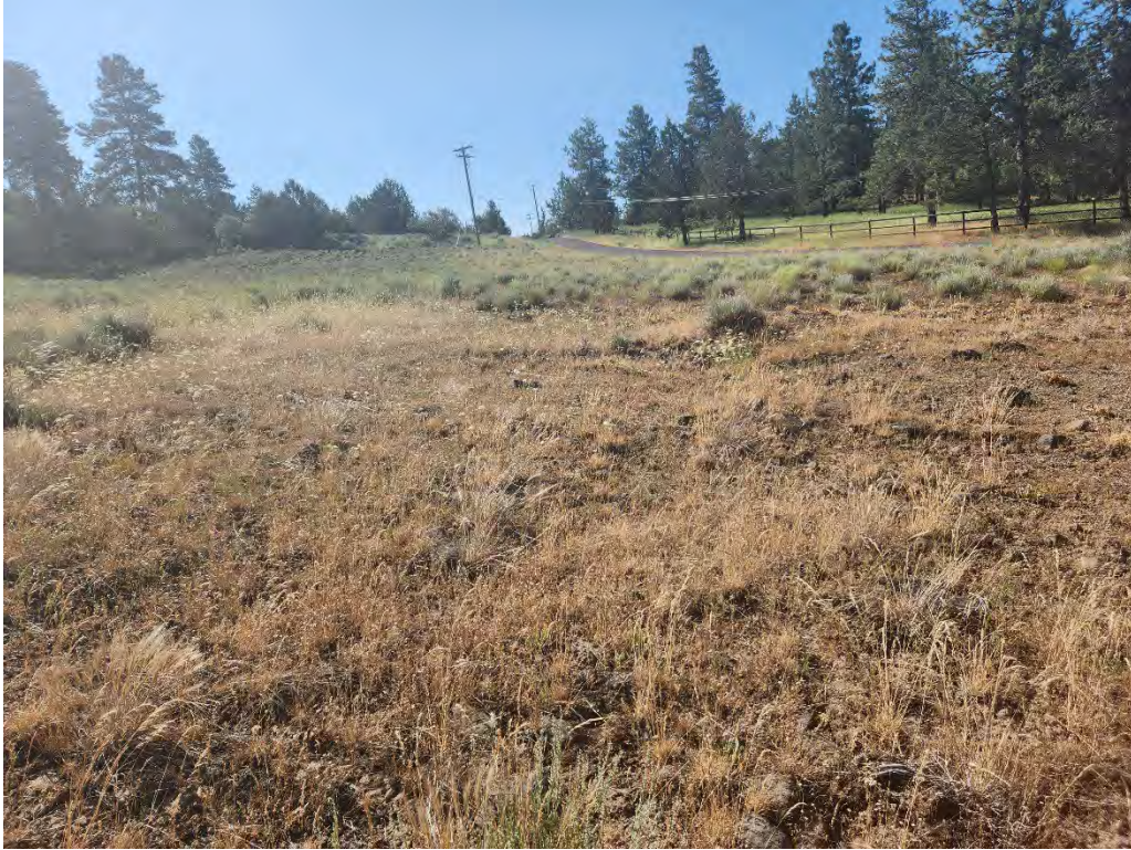
Parcel BK – View from Northwest corner of Parcel.