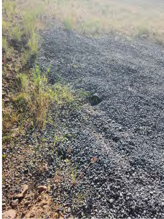
Parcel AR - View of blocked culvert on Western partition of parcel.