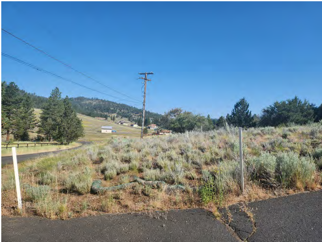
Parcel AR – View facing North from Southern corner of Parcel.