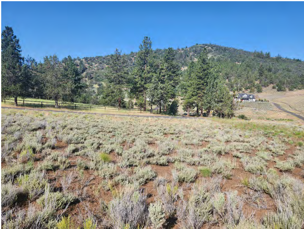
Parcel AR – View facing Southwest from North corner of Parcel.