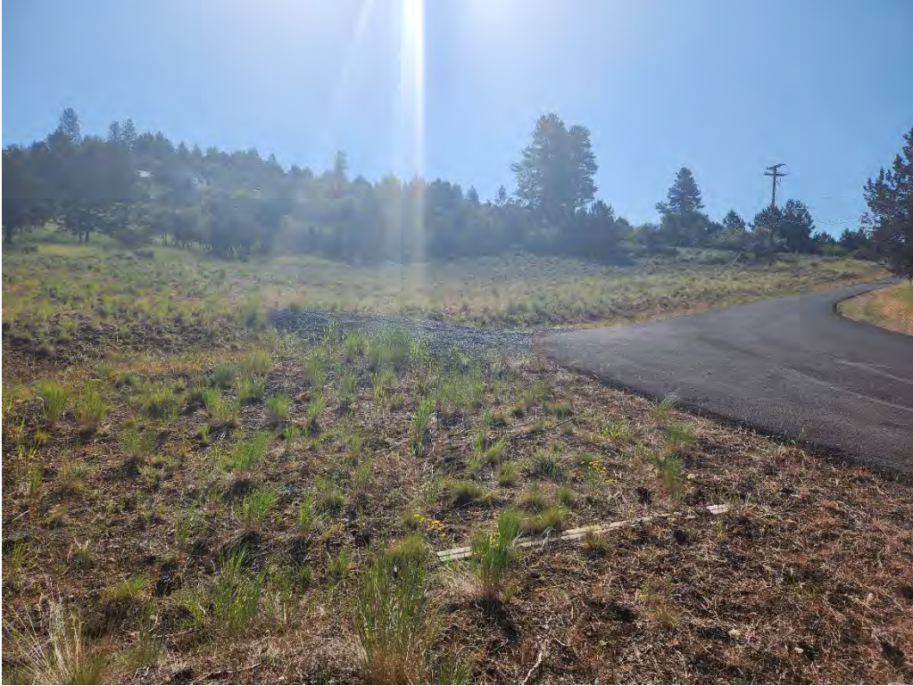
Parcel AR – View from Northwest corner of Parcel.