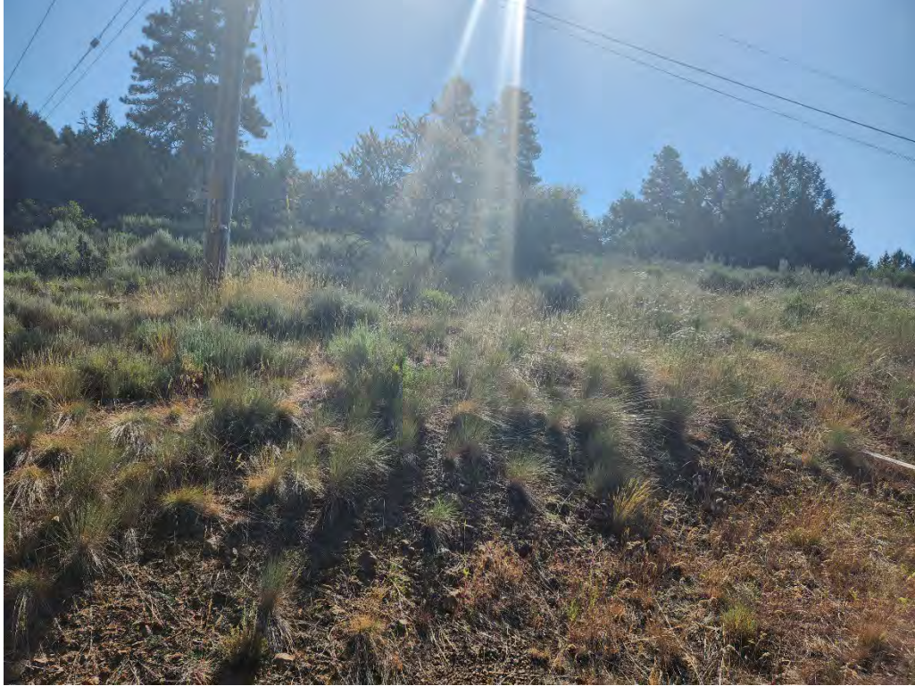
Parcel AR – View from South Central Area of Parcel.