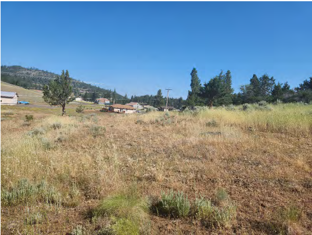
Parcel BK – View from Southeast corner of Parcel.