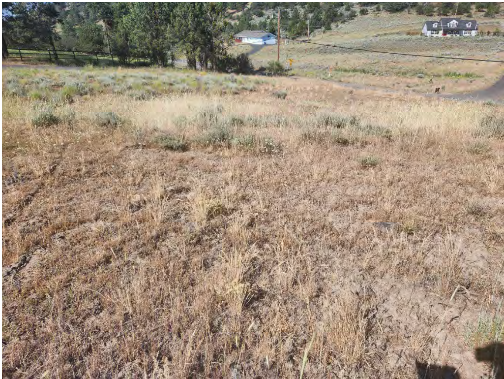
Parcel BK – View from Northeast corner of Parcel.