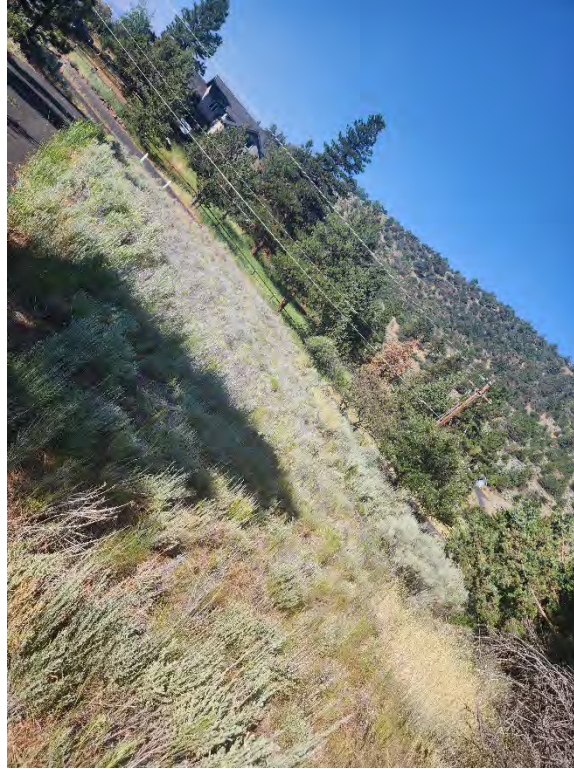
Parcel AR – View facing West from Eastern corner of Parcel.