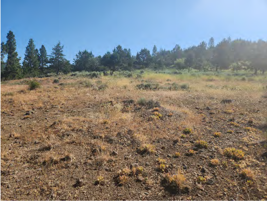
Parcel BK – View from Southwest corner of Parcel.