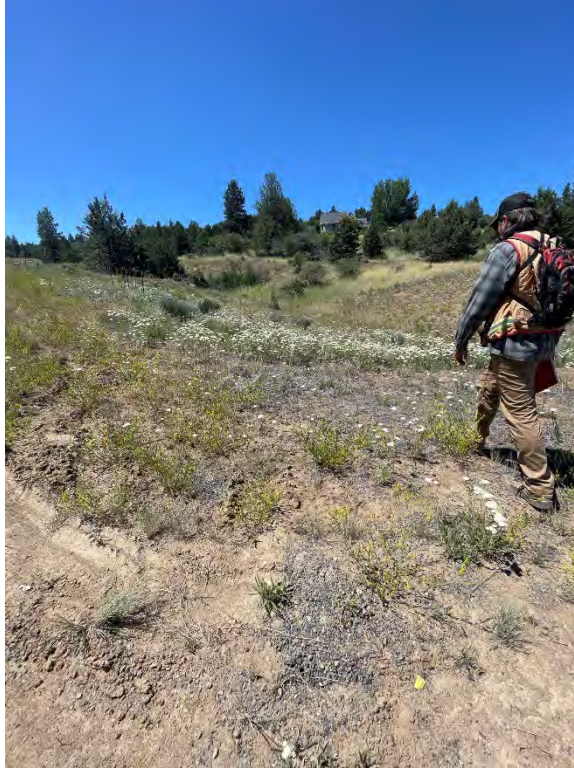
Parcel BR – Southeast corner of Parcel, facing Northwest.