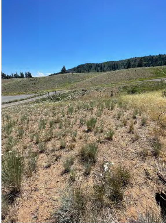
Parcel BR – North central corner of Parcel, facing Southeast.