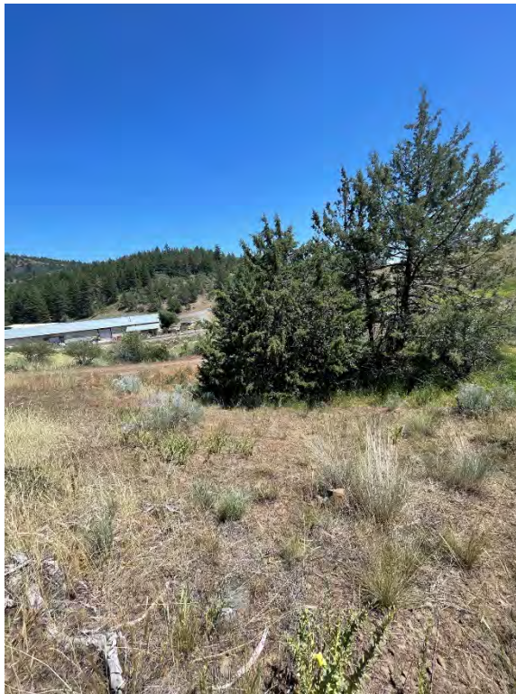
Parcel BR – Northwest Corner of Parcel, facing Southeast.