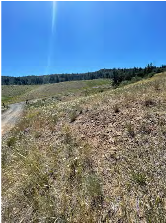
Parcel BR – Northeast corner of Parcel, facing Southeast.