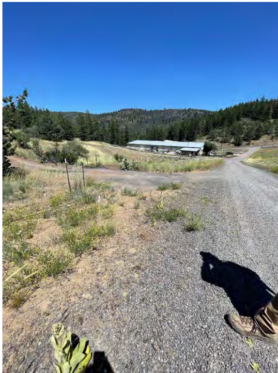
Parcel BR – Southwest corner of the Parcel, facing Northeast.