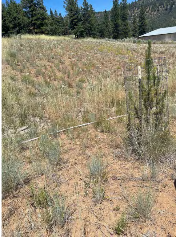
Parcel BR – Central corner of Parcel, facing Northeast.