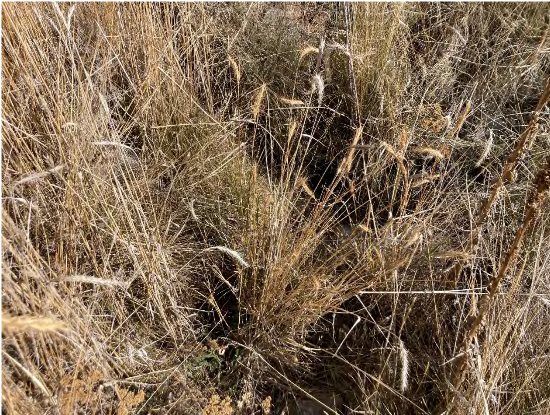
Culverts under the driveway were severely obstructed by overgrown vegetation and soil.