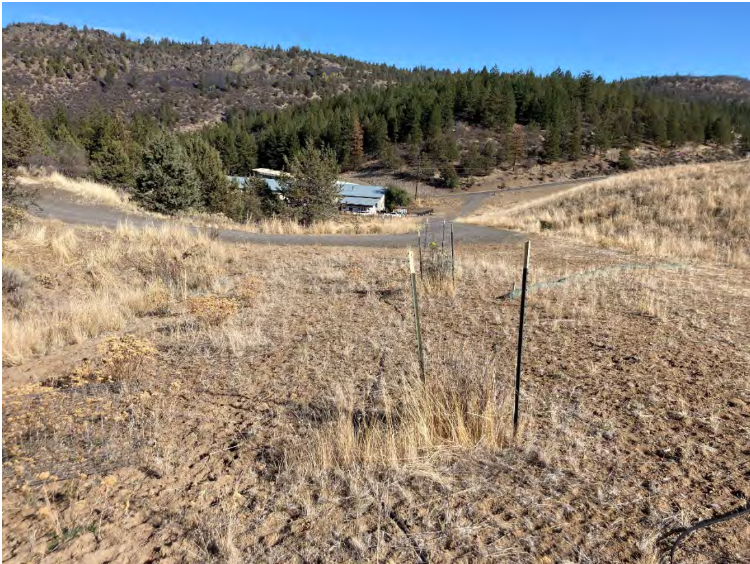
View of the southern end of Parcel BR removal area/cap from the southwest corner.