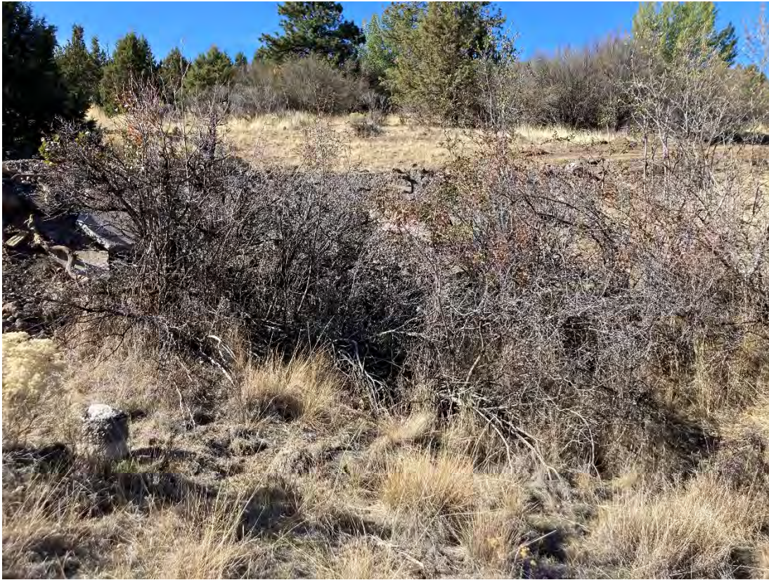
One of the culverts could not be identified under overgrown vegetation, rocks, and dead shrubs.