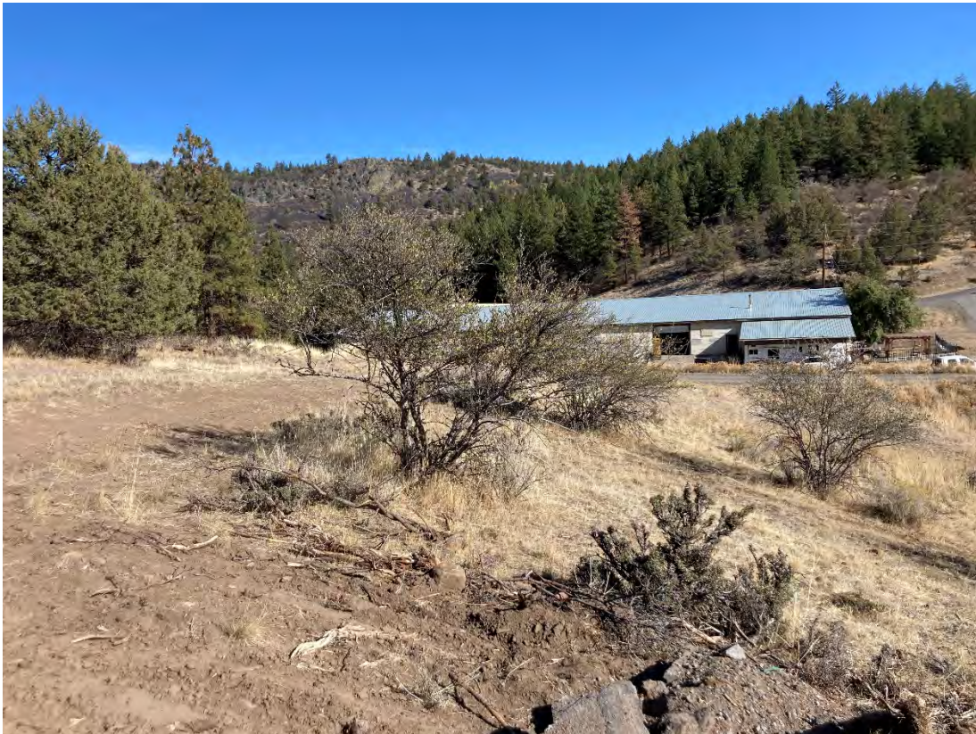
Two legacy trees just north of the cap were stressed/dying. If felled, it is unlikely to damage the cap.