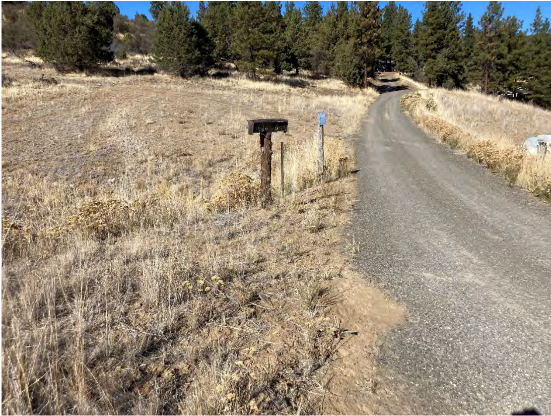
View of the SE portion of the property line, looking from the southwest corner.