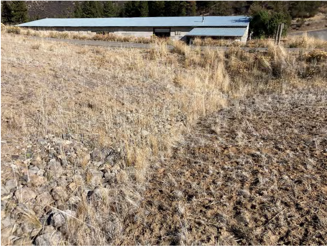
Round rocks were placed to create a drainage to prevent/repair erosion in the southwest portion of the property.