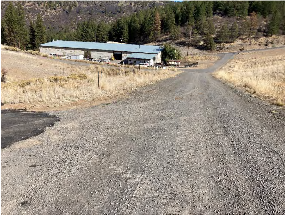
Typical condition of the driveway pavement made up of loose gravel, looking from the northwest portion of the property.