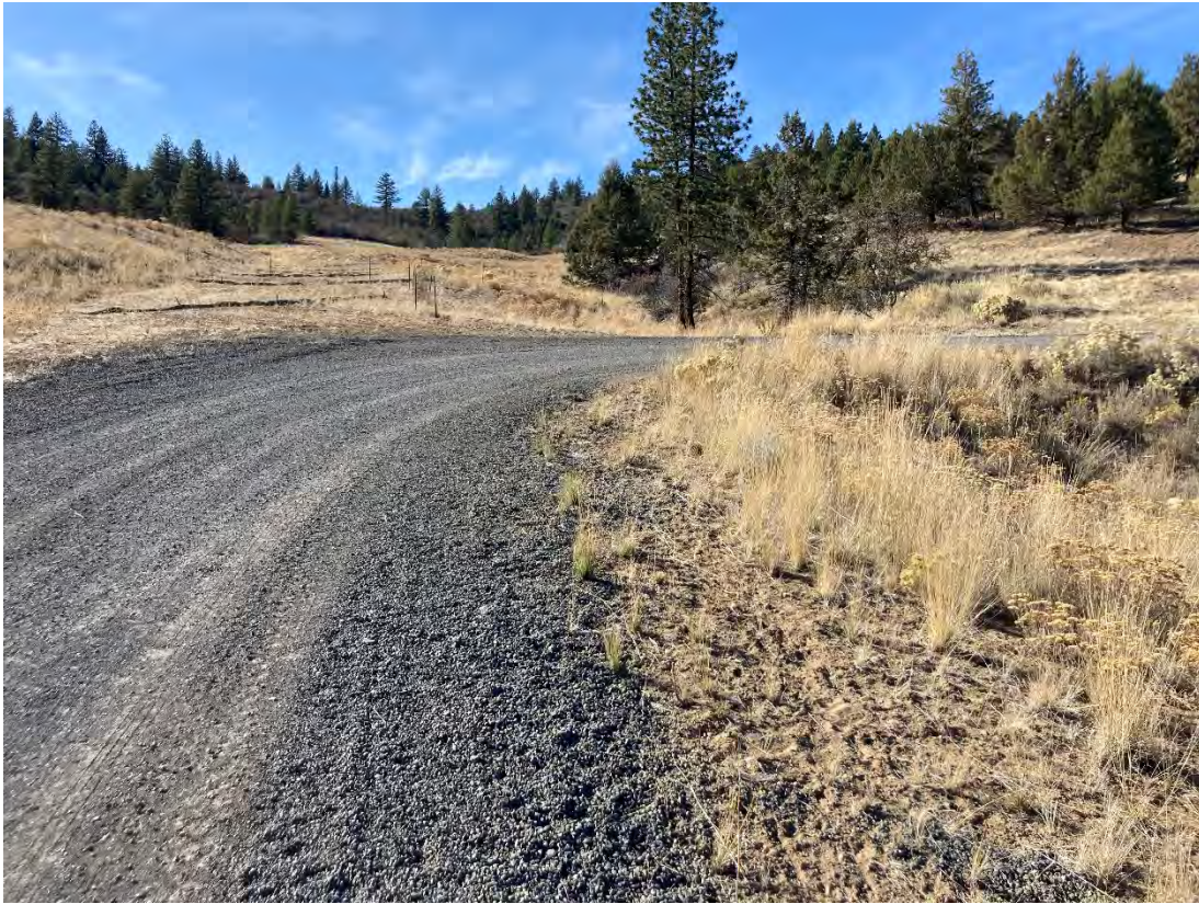
View of the southern edge of the BR removal area and cap, looking west.