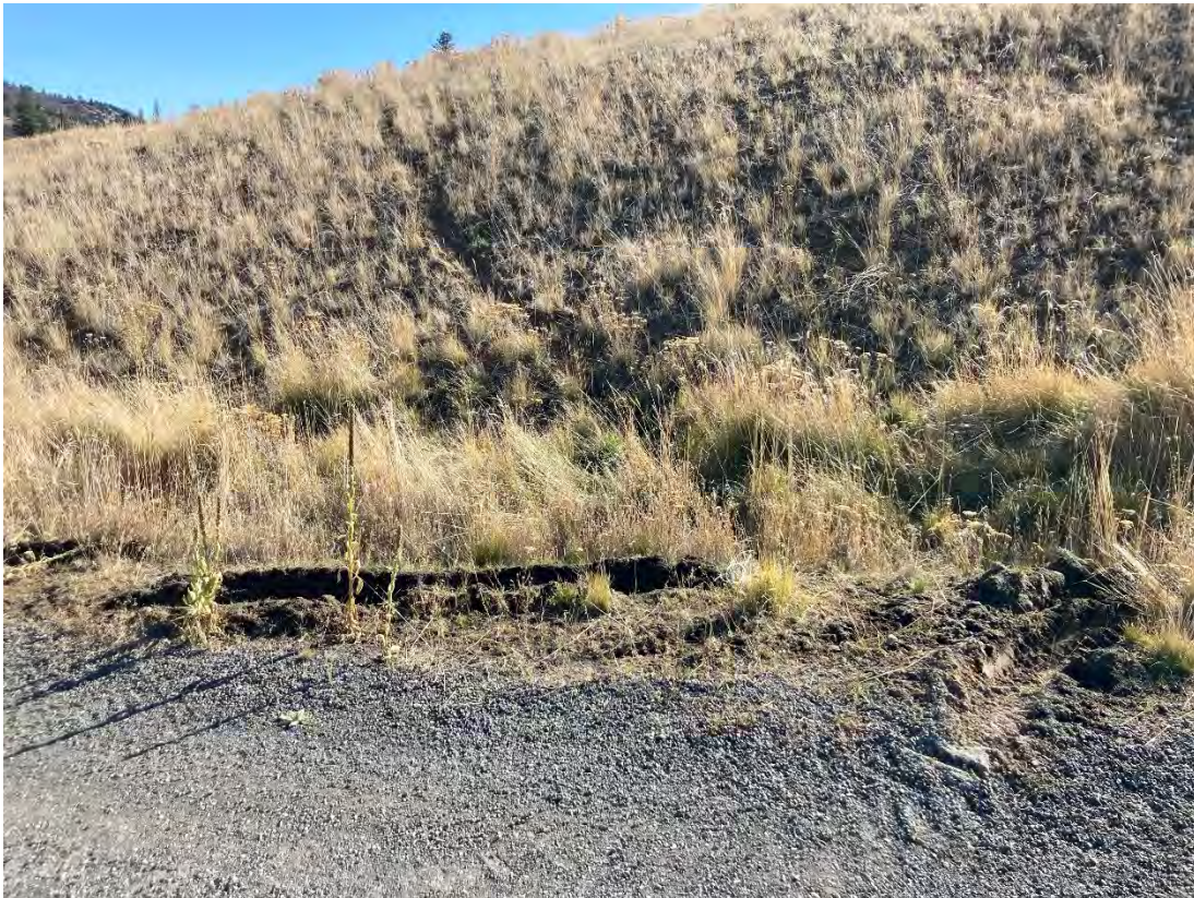
Deep tire tracks were noted along the ditch near the southwest edge of the property.