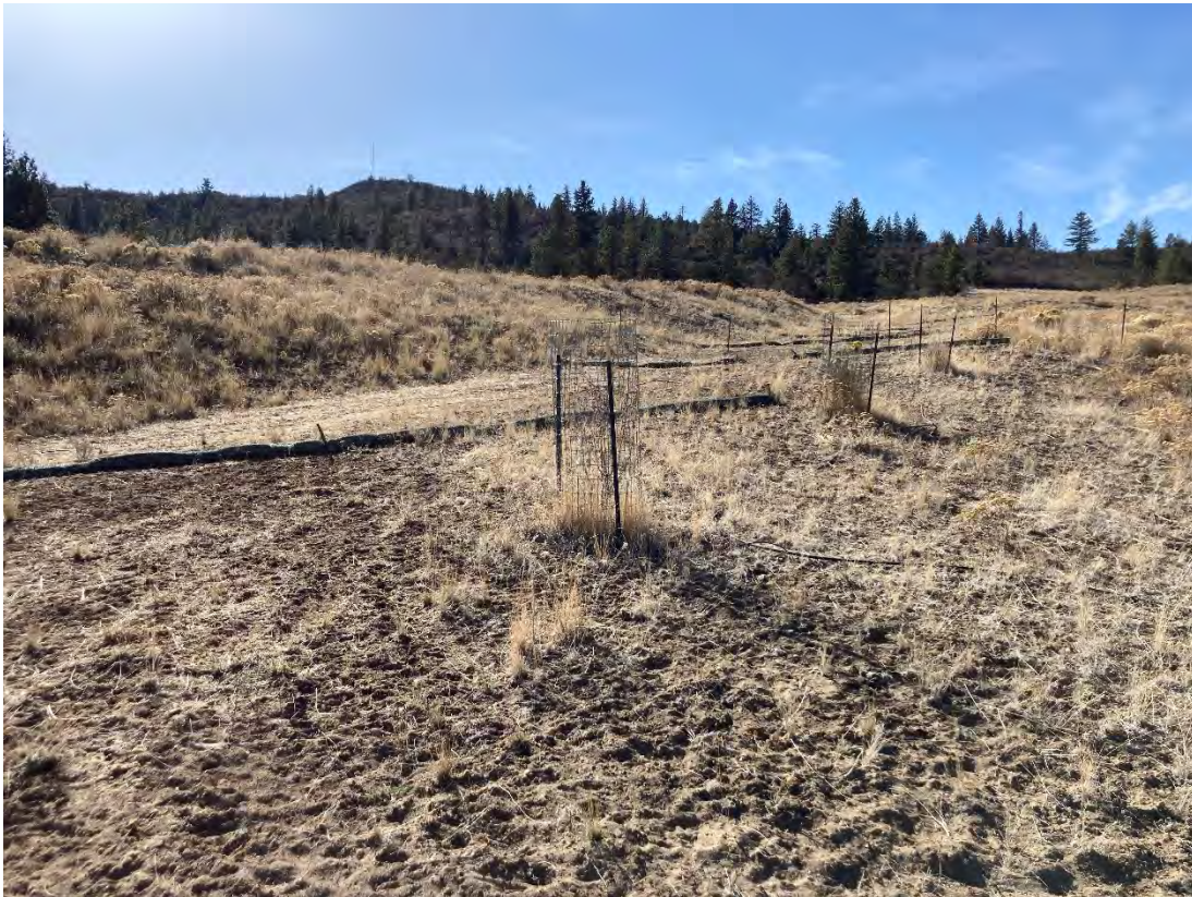
View of the northwest corner of Parcel BR, showing straw wattles still present and dead newly planted trees.