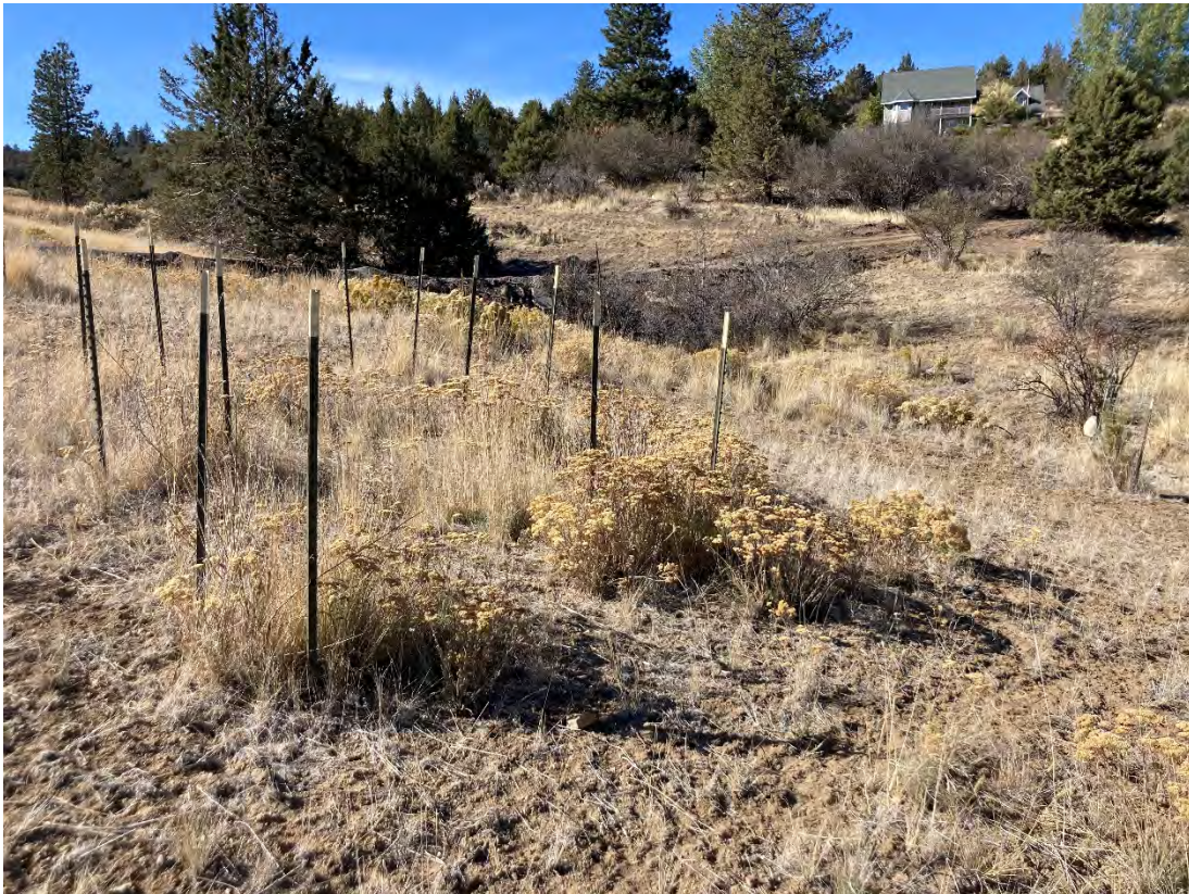
Majority of newly planted trees are dead or stressed along the southwest hill of Parcel BR.