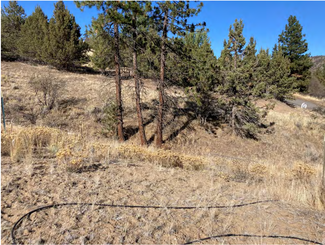
View of the west edge of the BR removal area/cap looking north from the southwest corner.