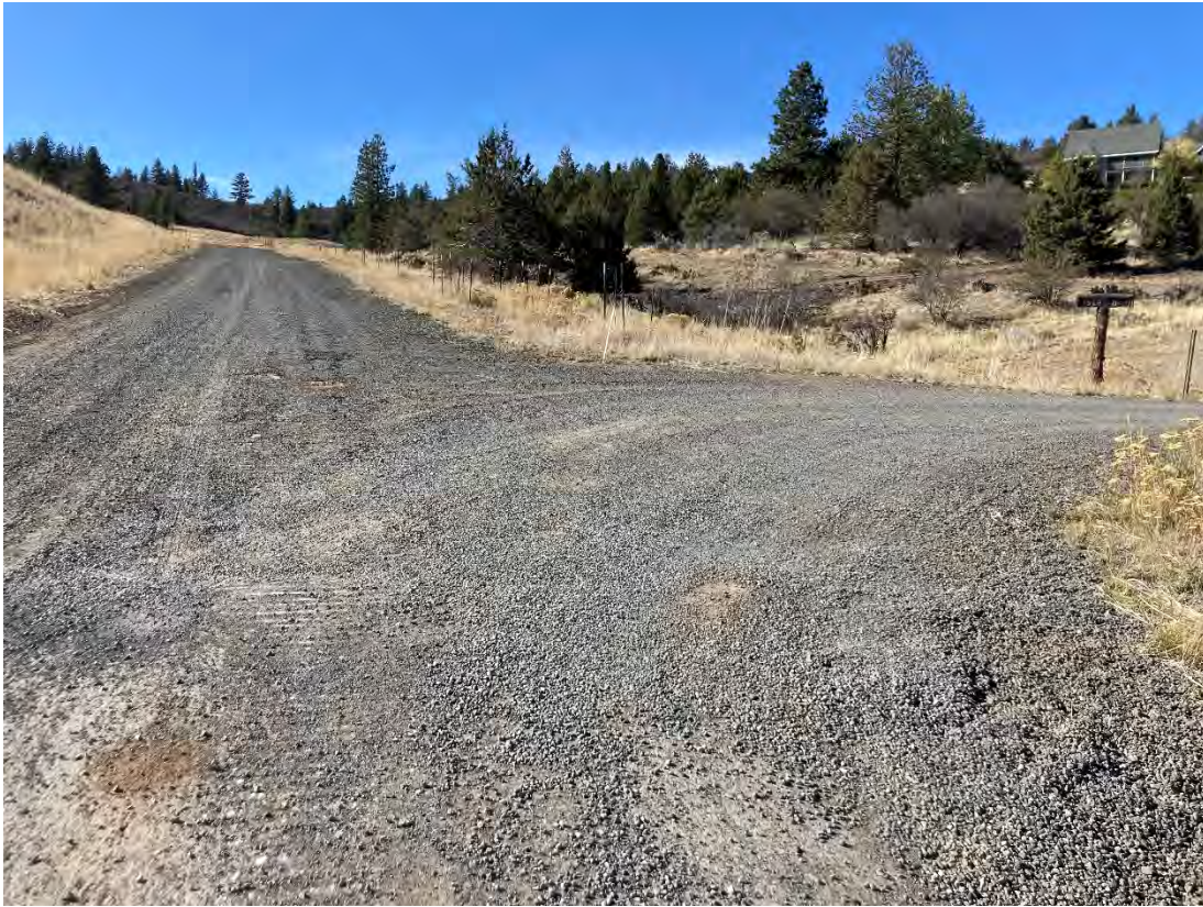
View of the southern edge of the BR removal area/cap, looking west from the SE corner.