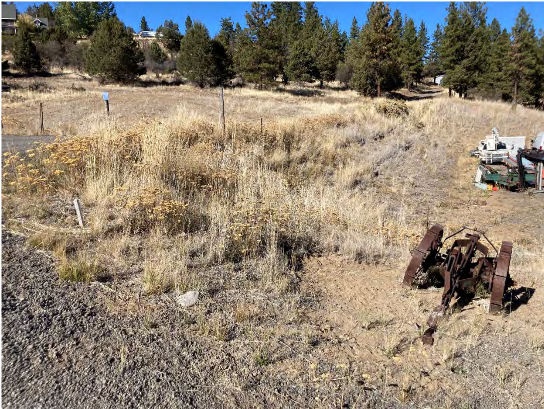
View of the NE portion of Parcel BR, looking from the SW corner.