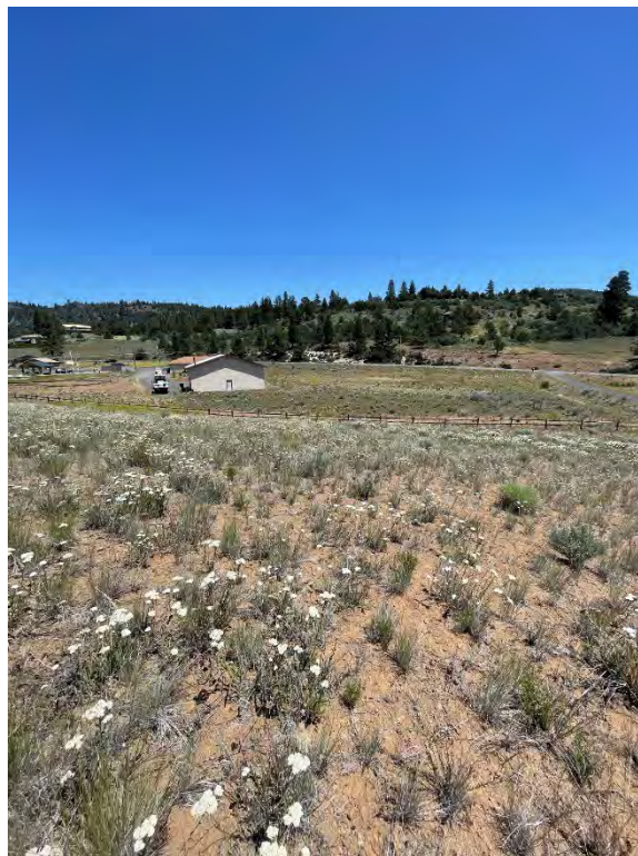
Parcel Y – Southwest corner of Parcel, facing Northeast.