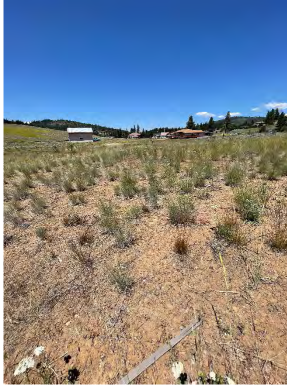
Parcel Y – Southeast corner of Parcel, facing Northwest.