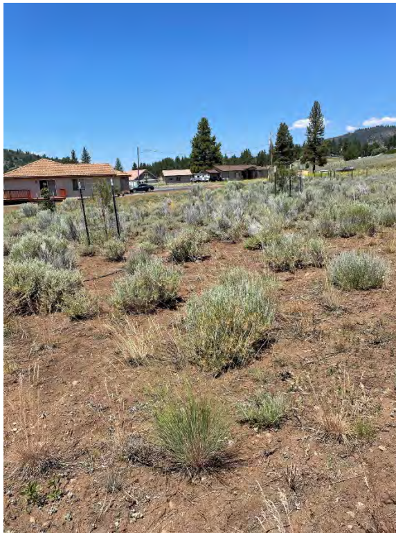
Parcel Y – Distressed trees located along the North side of the Parcel.