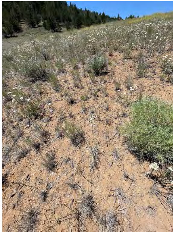
Parcel Y – New Rills observed on the Southwest corner of the Parcel.