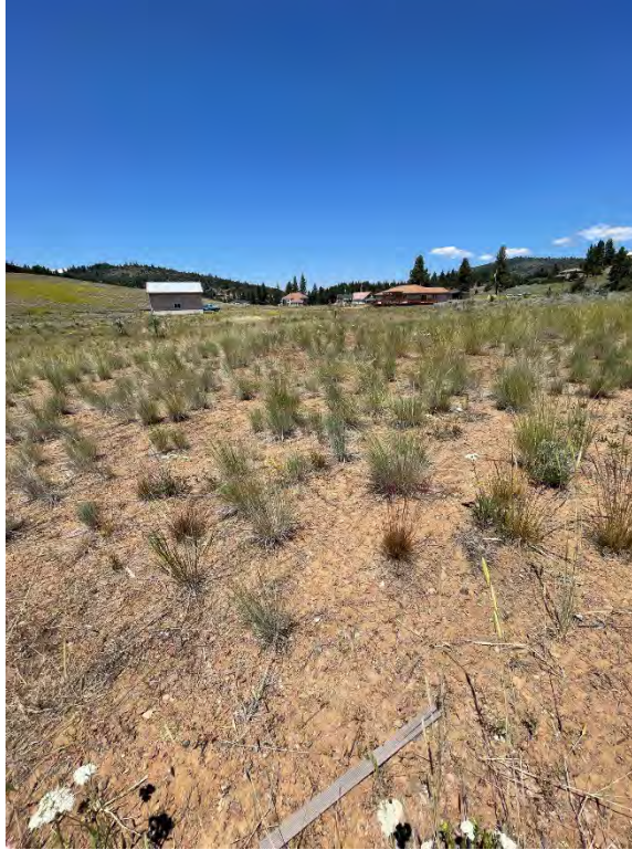
Parcel Y – Northeast corner of Parcel, facing Southeast.