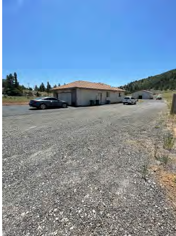
Parcel Y – Northwest corner of Parcel, facing Southeast.