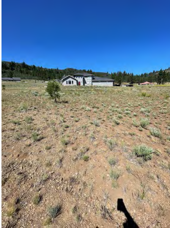
Parcel S – Northeast corner of the Parcel, facing West.