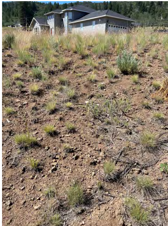
Parcel S – New Rill on the North Side of the Parcel near the driveway.