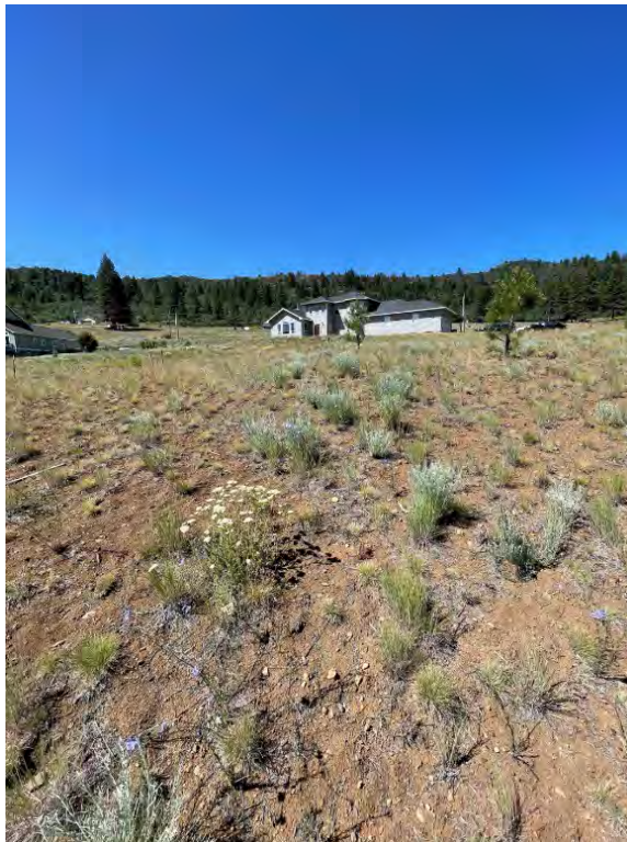
Parcel S – Northeast corner of the Parcel, facing Southwest.