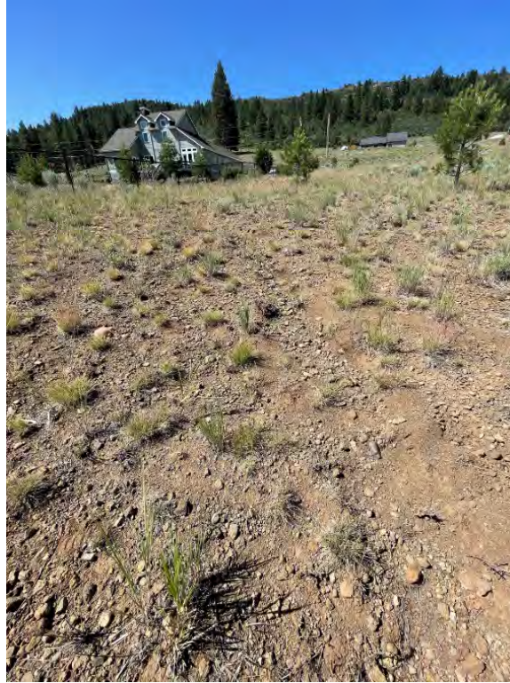
Parcel S – New Rill on Southwest side of the Parcel.