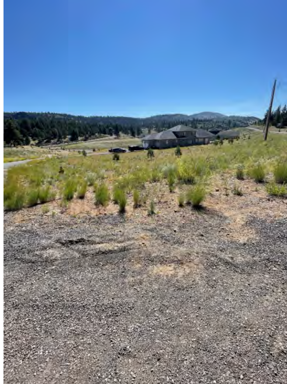
Parcel S – Northwest corner of Parcel, facing Southeast.