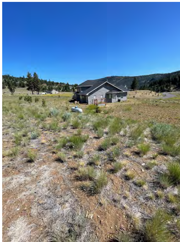
Parcel S – Southwest corner of the Parcel, facing Northeast.