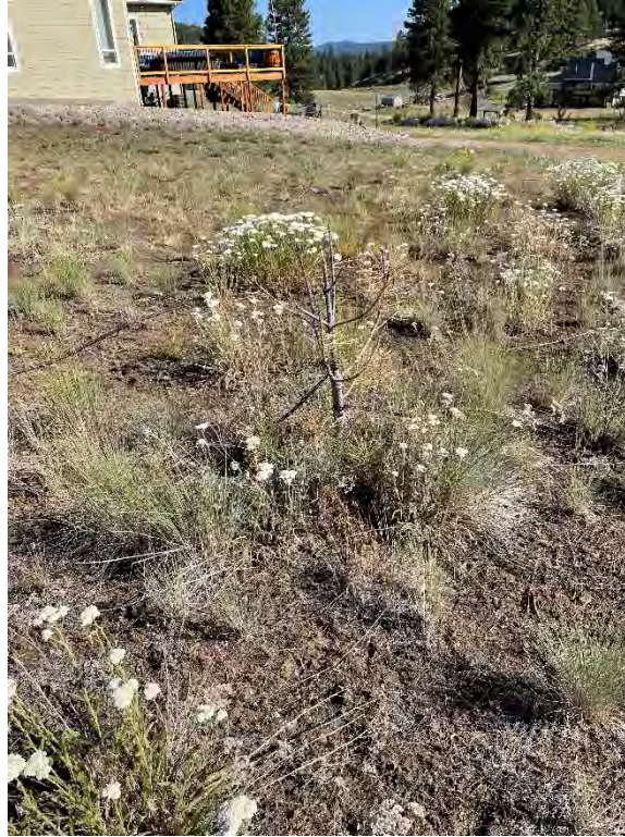
Parcel R – Newly planted tree (distressed) found on the Southwest side of the Parcel.