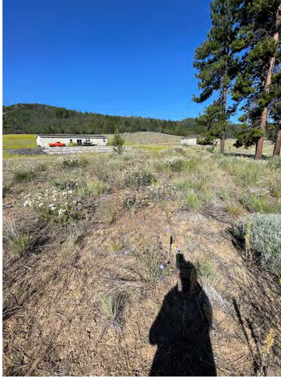
Parcel R – Northeast corner of Parcel, facing Southwest.