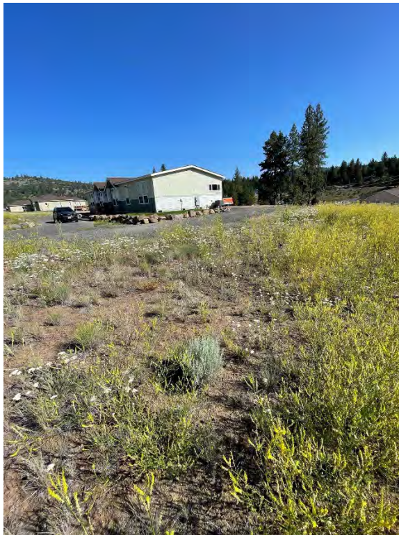
Parcel R – Southeast corner of Parcel, facing Northwest.