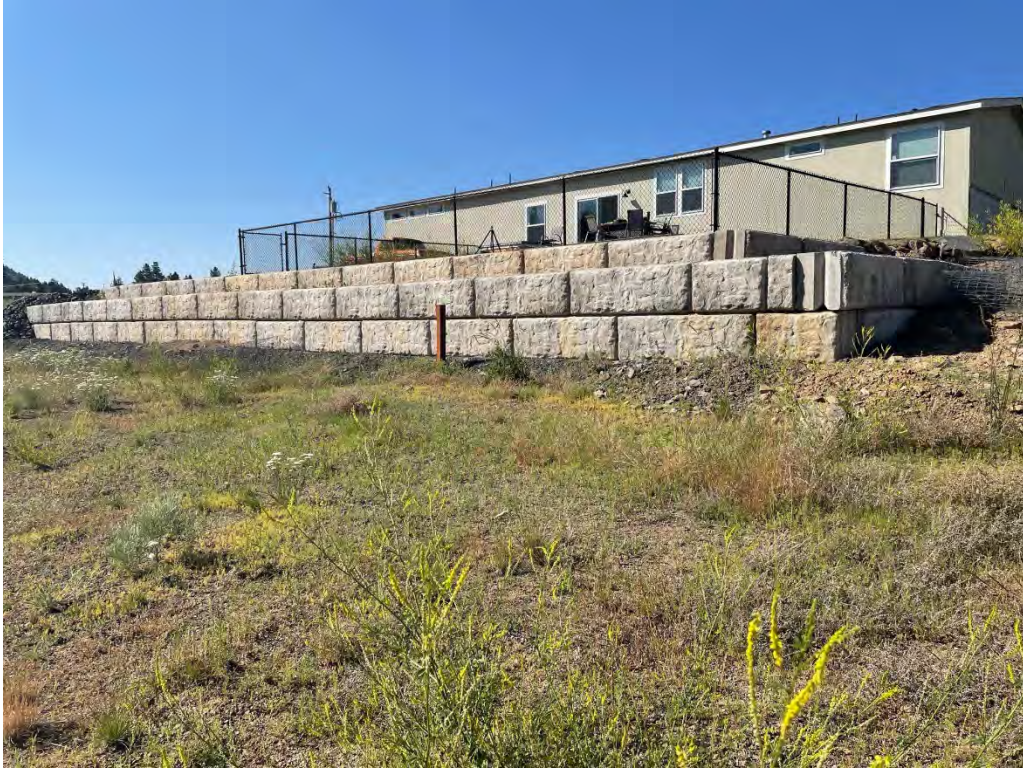
Parcel R – View of interlocking concrete retaining wall blocks installed to flatten slope grade.