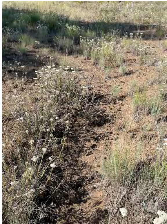
Parcel R – New Rill located at the Northwest corner of Parcel.