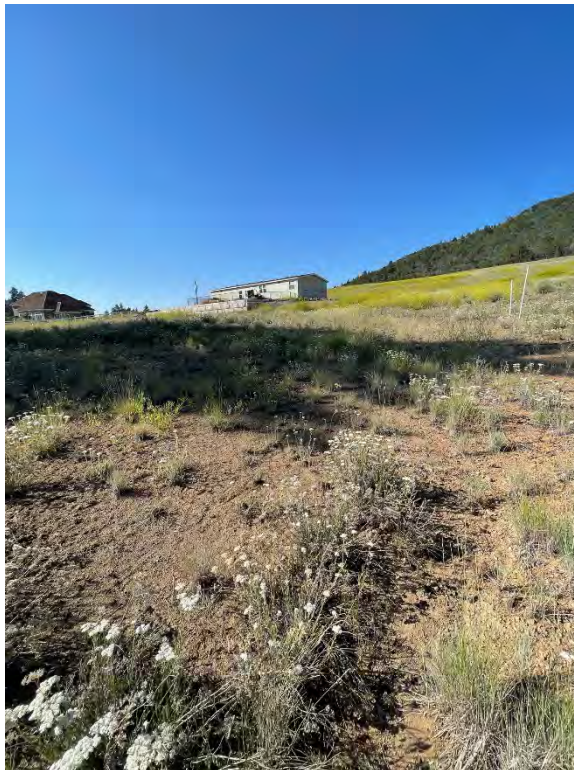
Parcel R – Northwest corner of Parcel, facing Southeast.