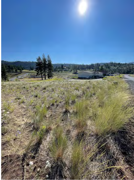
Parcel R – Southwest corner of Parcel, facing Northeast.