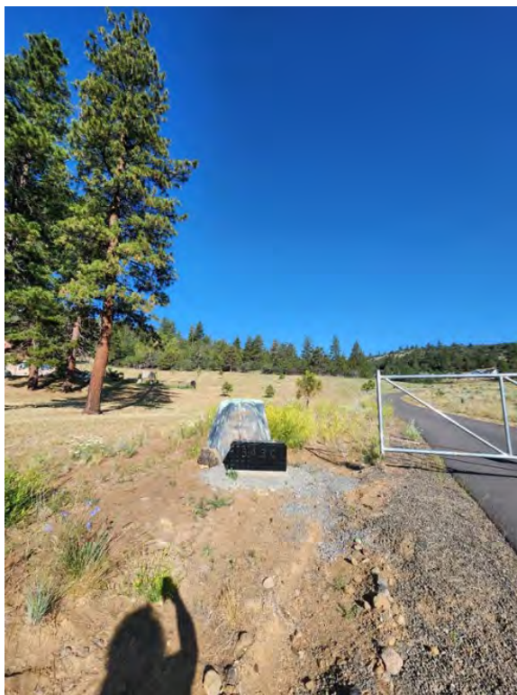
Parcel H – View facing North from Southeast Corner.