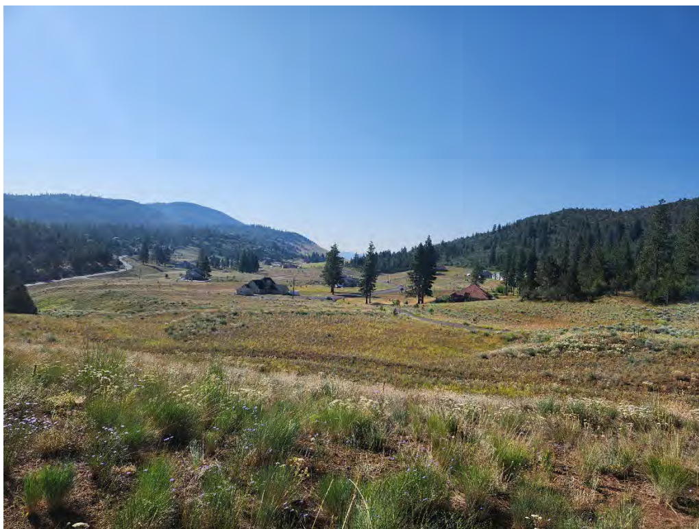
Parcel H – View facing Southwest from Northeast corner.