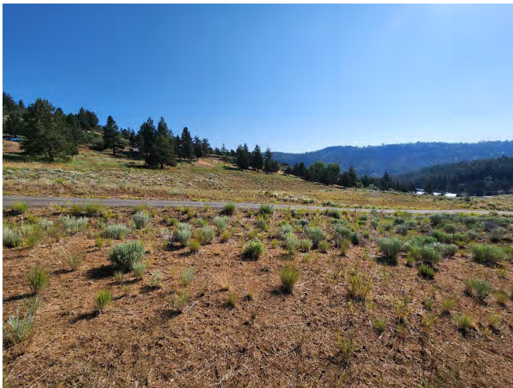
Parcel H – View facing East from West corner.