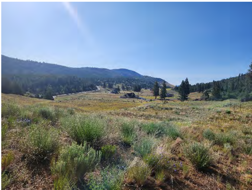
Parcel H – View facing South from North Corner.