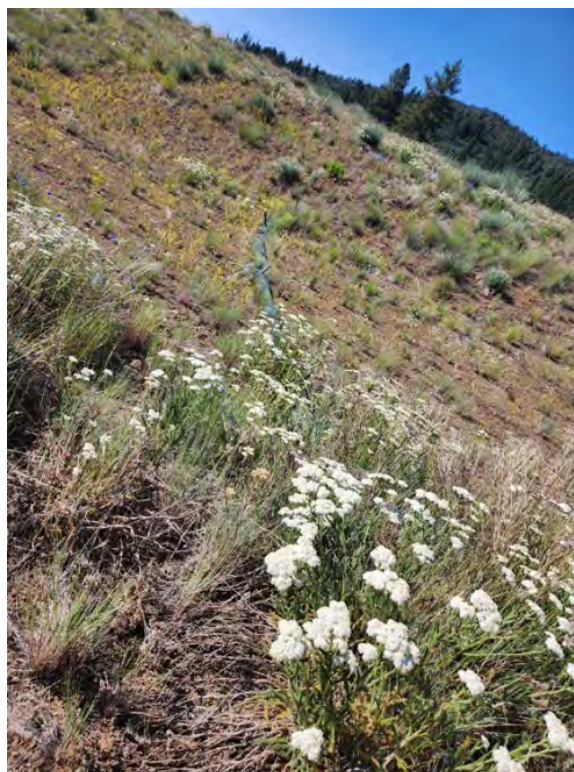
Parcel H – View of Straw Wattle seen on Parcel.