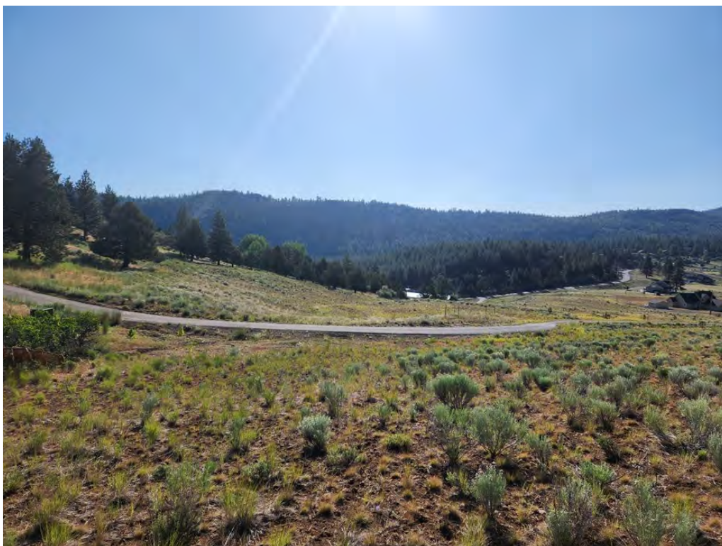
Parcel H – View facing Southeast from Northwest corner; vegetation growth since trenching (2021).