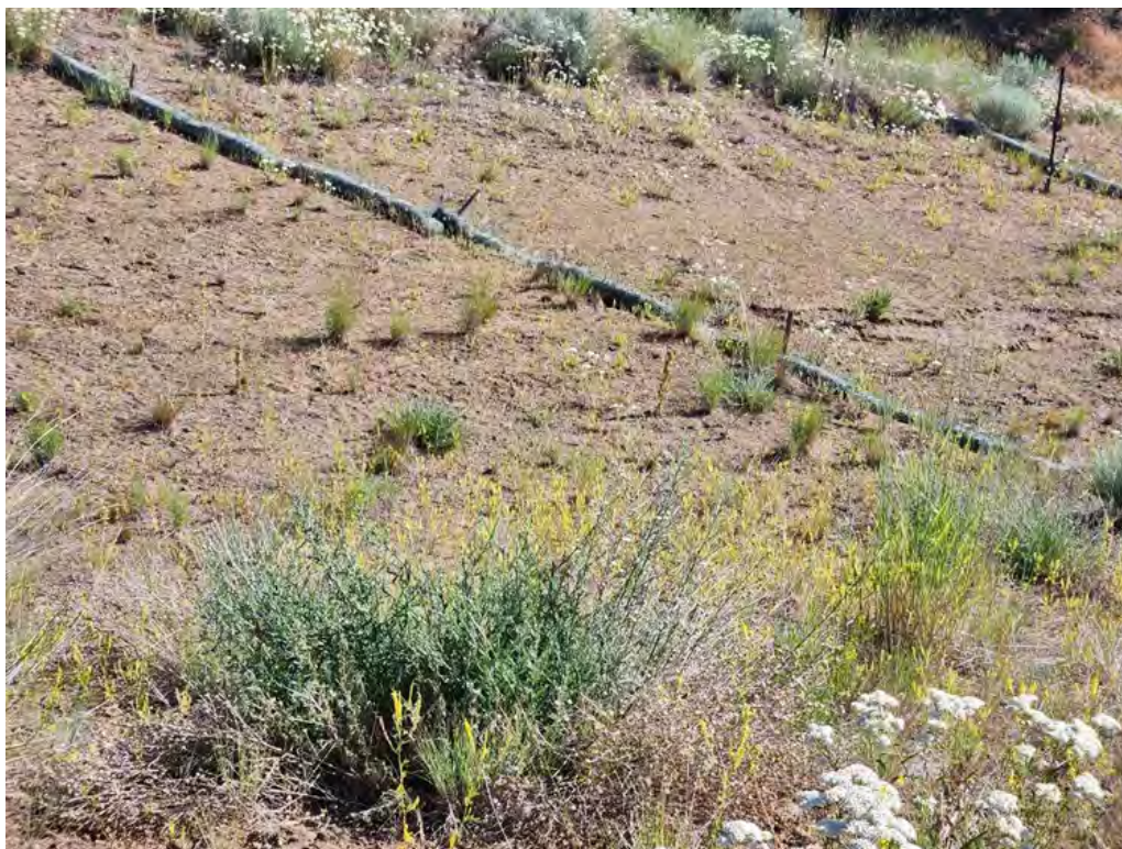
Parcel H – View of Rills on Parcel.