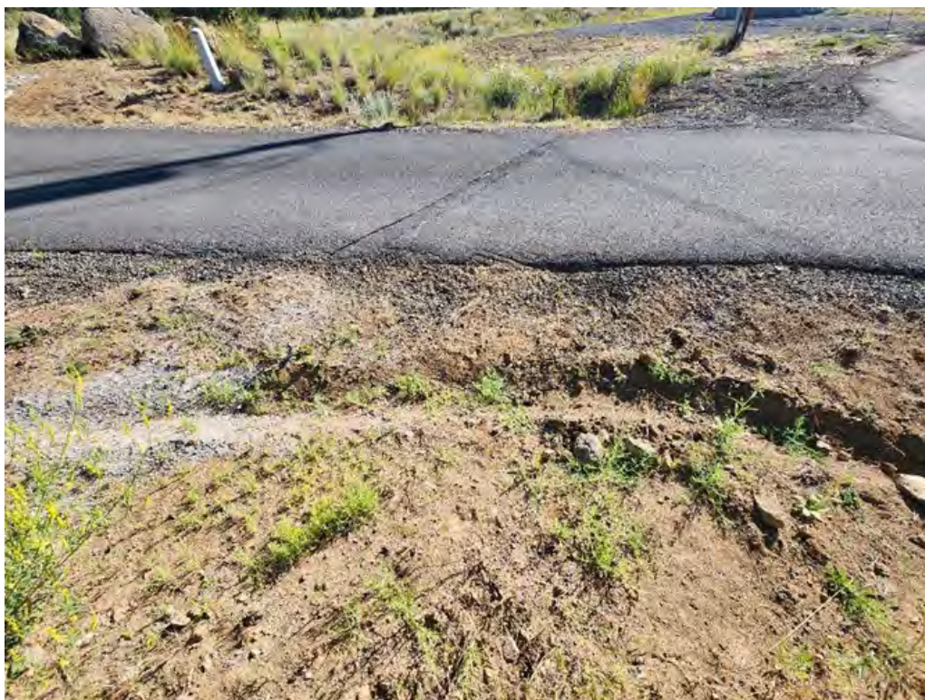
Parcel H – View of Rills located at the Southernmost corner of the Parcel.