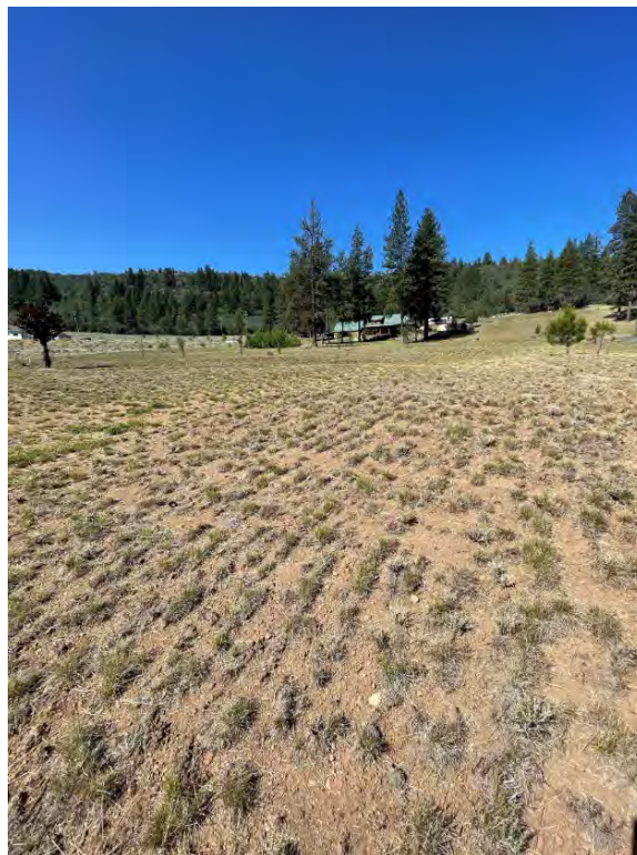
Parcel F – Northeast corner of Parcel, facing Southwest.