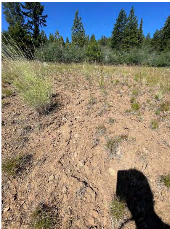
Parcel F – New Rill on the Southwest side of the Parcel.