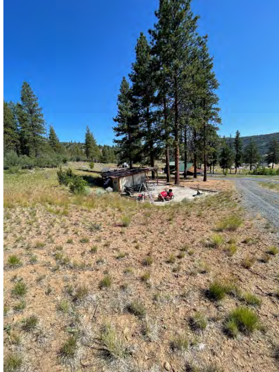
Parcel F – Southwest corner of Parcel, facing Northeast.