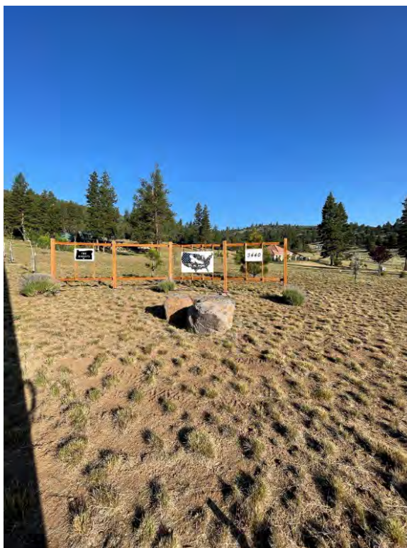
Parcel F – Southwest corner, facing Northeast.