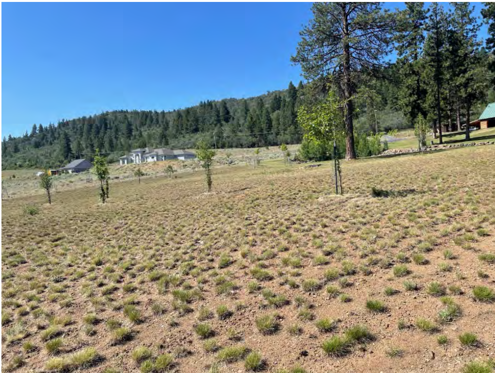
Parcel F – Newly planted Trees on the East side of the Parcel.