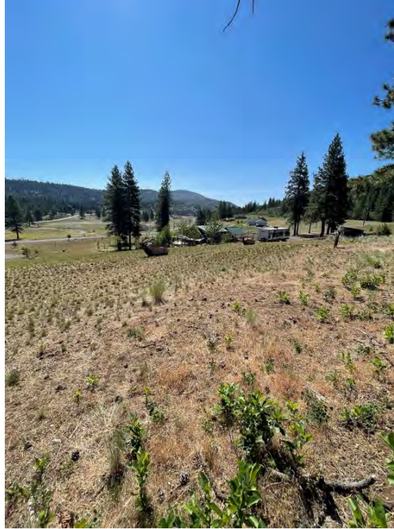
Parcel F – Northwest corner of Parcel, facing Southeast.