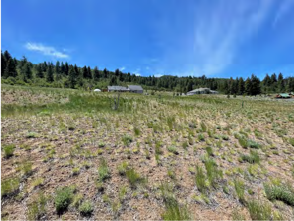
Parcel C – East corner of Parcel, facing West.