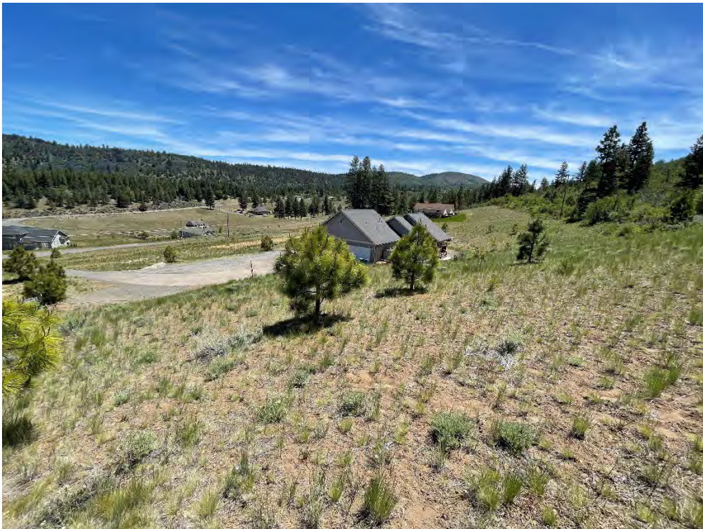
Parcel C – West corner of Parcel, facing East.