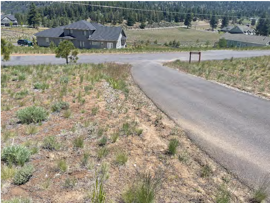
Parcel C – Minor gully forming along edge of driveway, facing Northeast.