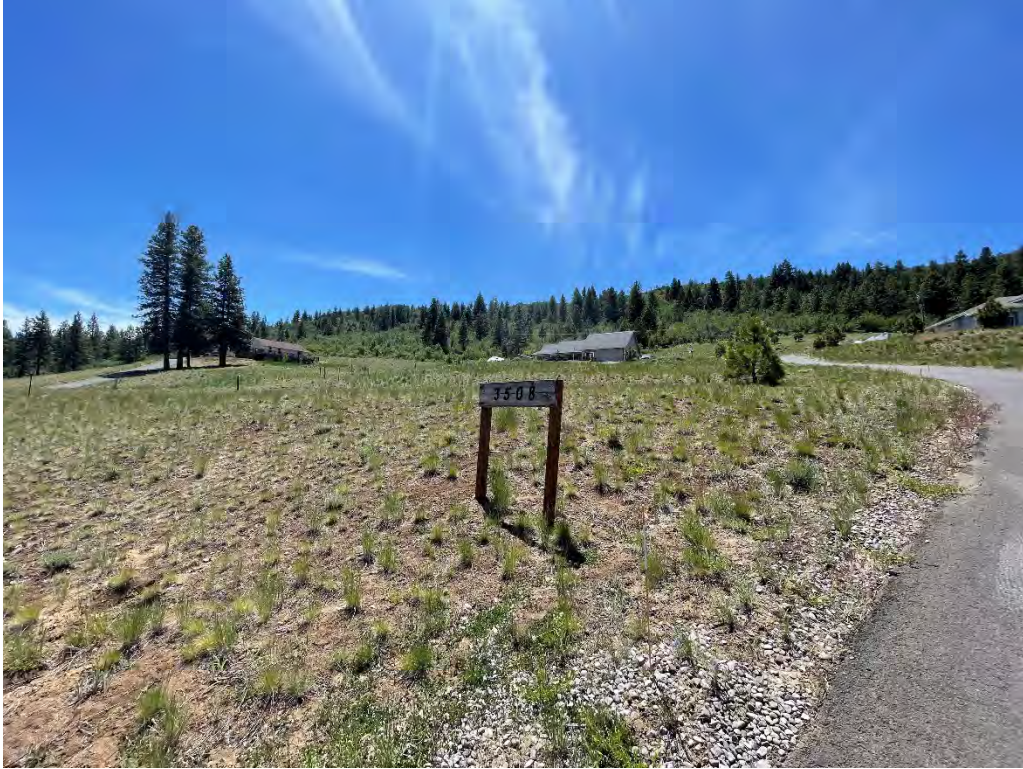
Parcel C – North corner of Parcel, facing South.