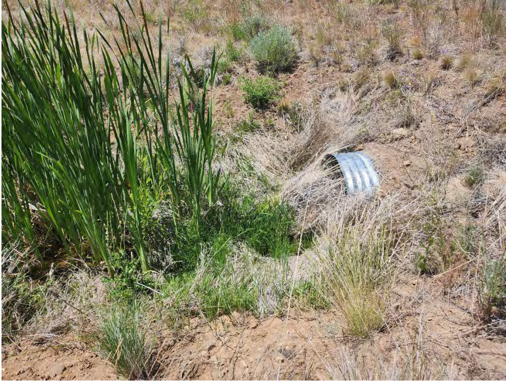
Parcel AP – View of Blocked Culvert located on Northeast area of Parcel.