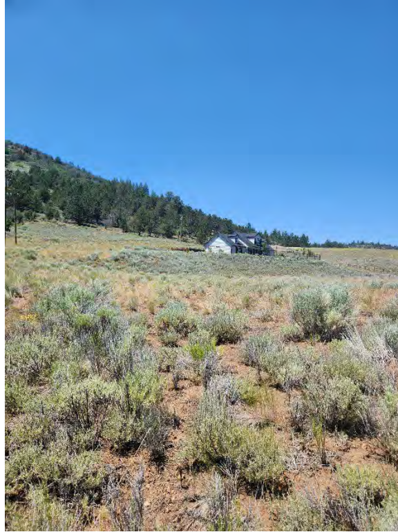
Parcel AP – View from Southeastern corner of Parcel.