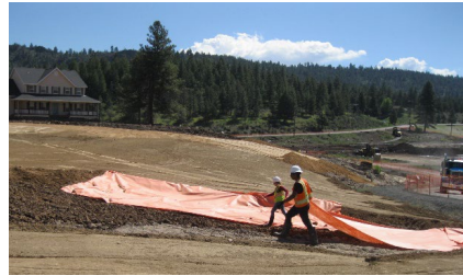
Example of Orange Liner. 2018. Installing marker barrier consisting of rock base and orange liner on Parcel B prior to covering with clean soil.