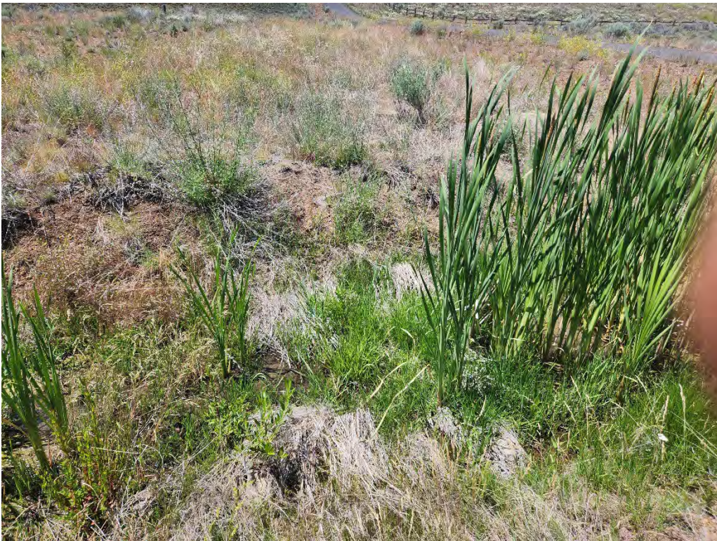
Parcel AP - View of Standing water near blocked culverts located on Northeast area of Parcel.