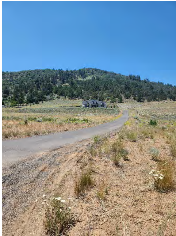
Parcel AP – View from Northeastern corner of Parcel.