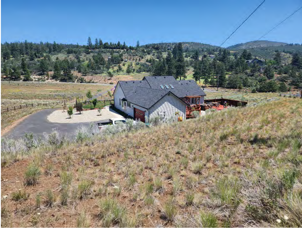
Parcel AP – View from Northwestern corner of Parcel.