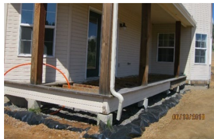
Example of Black Liner. 2018. Black liner with rock to hold in place on Parcel A.