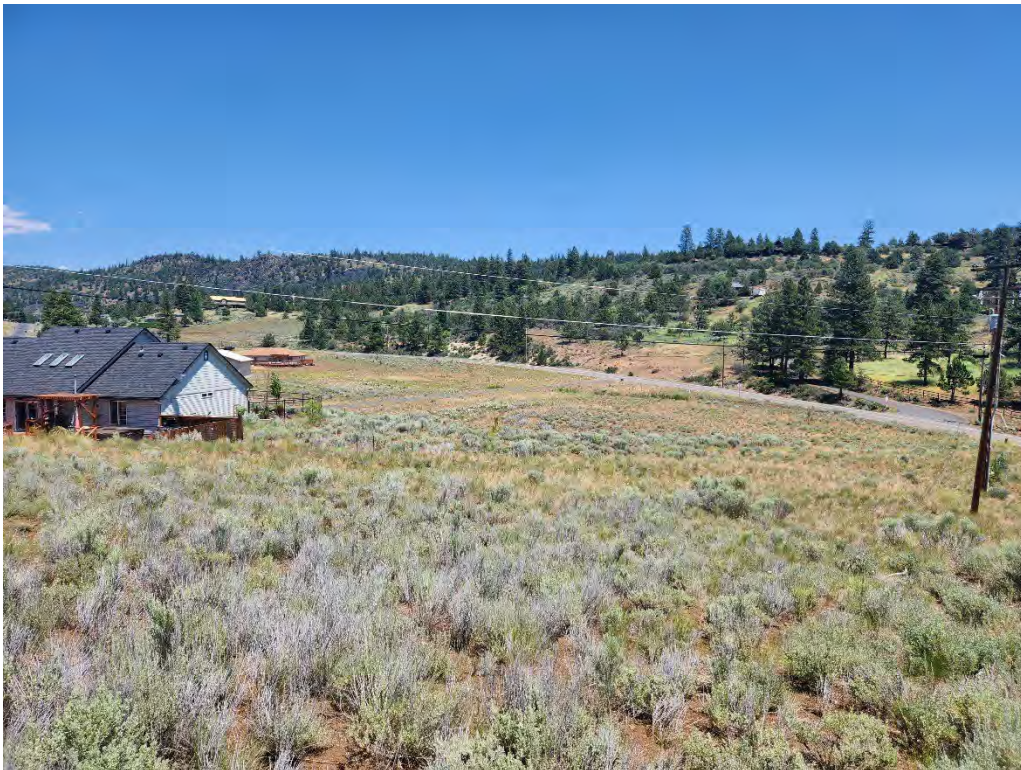
Parcel AP – View from Southwestern corner of Parcel.