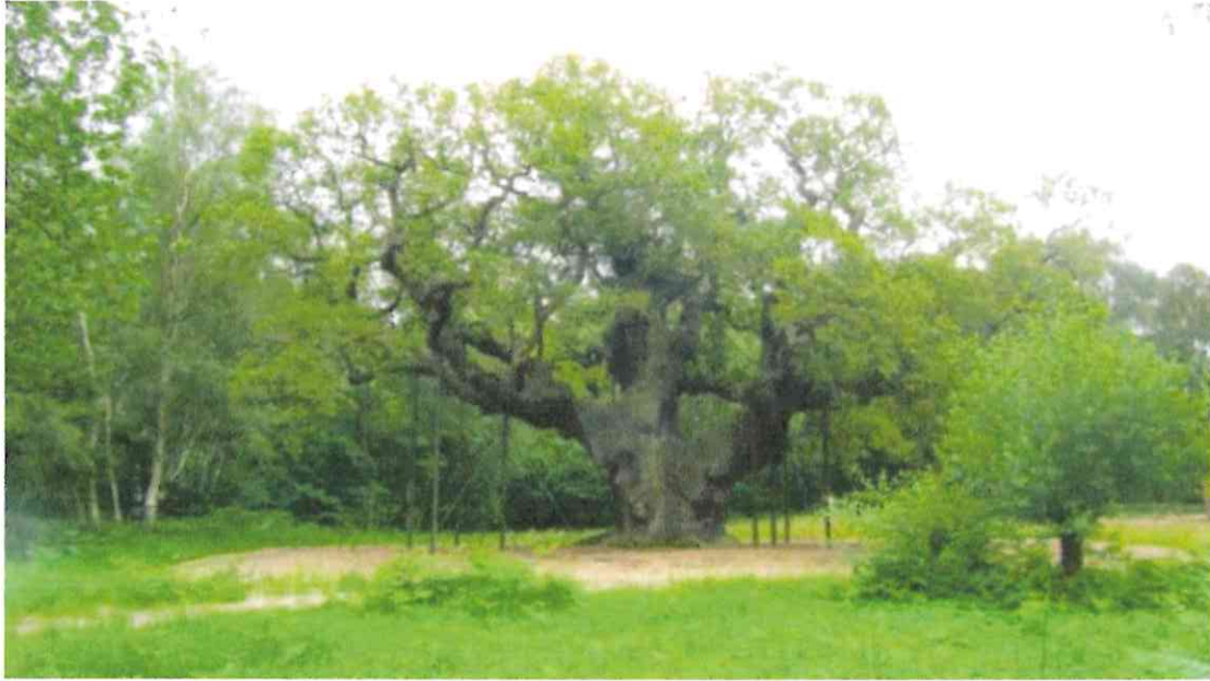
MAJOR OAK, Sherwood Forest 800-1,000 years old.