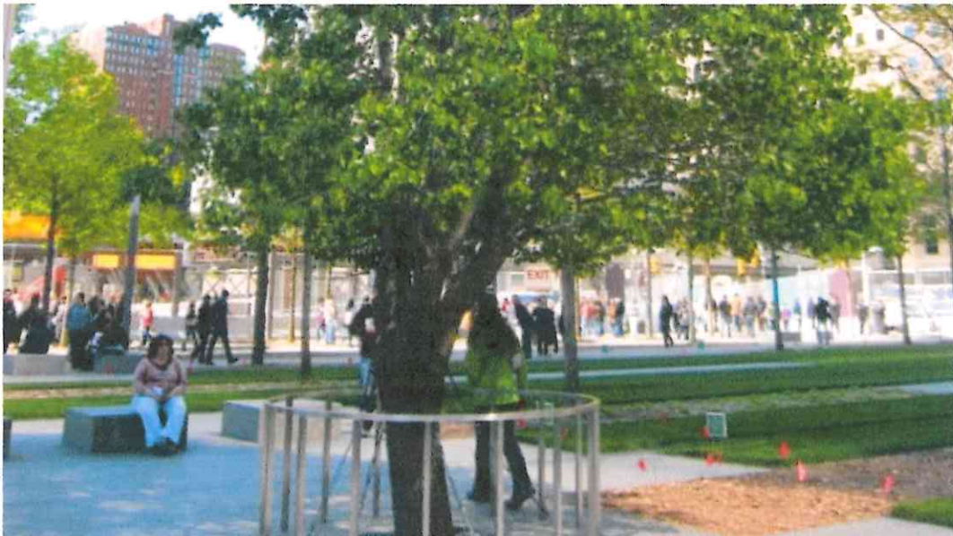
Survivor Tree at the National September 11 Memorial & Museum