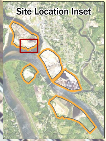
Figure 2 Stacks and Toxic Emission Units at Northwest Facility Georgia-Pacific Toledo, LLC Toledo, OR