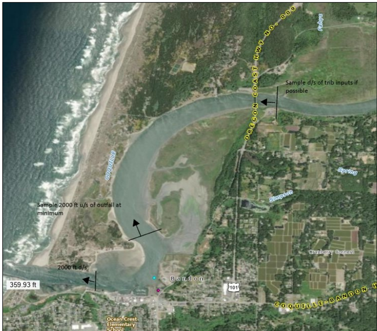
Figure 5-1: Proposed Receiving Water Monitoring Area Outside of Effluent Plume

from any major tributaries if possible. A map of the locations that are expected to be outside of the influence of the effluent is shown below. The permittee may propose an alternate sampling location to DEQ, which may be used if approved by DEQ in writing.