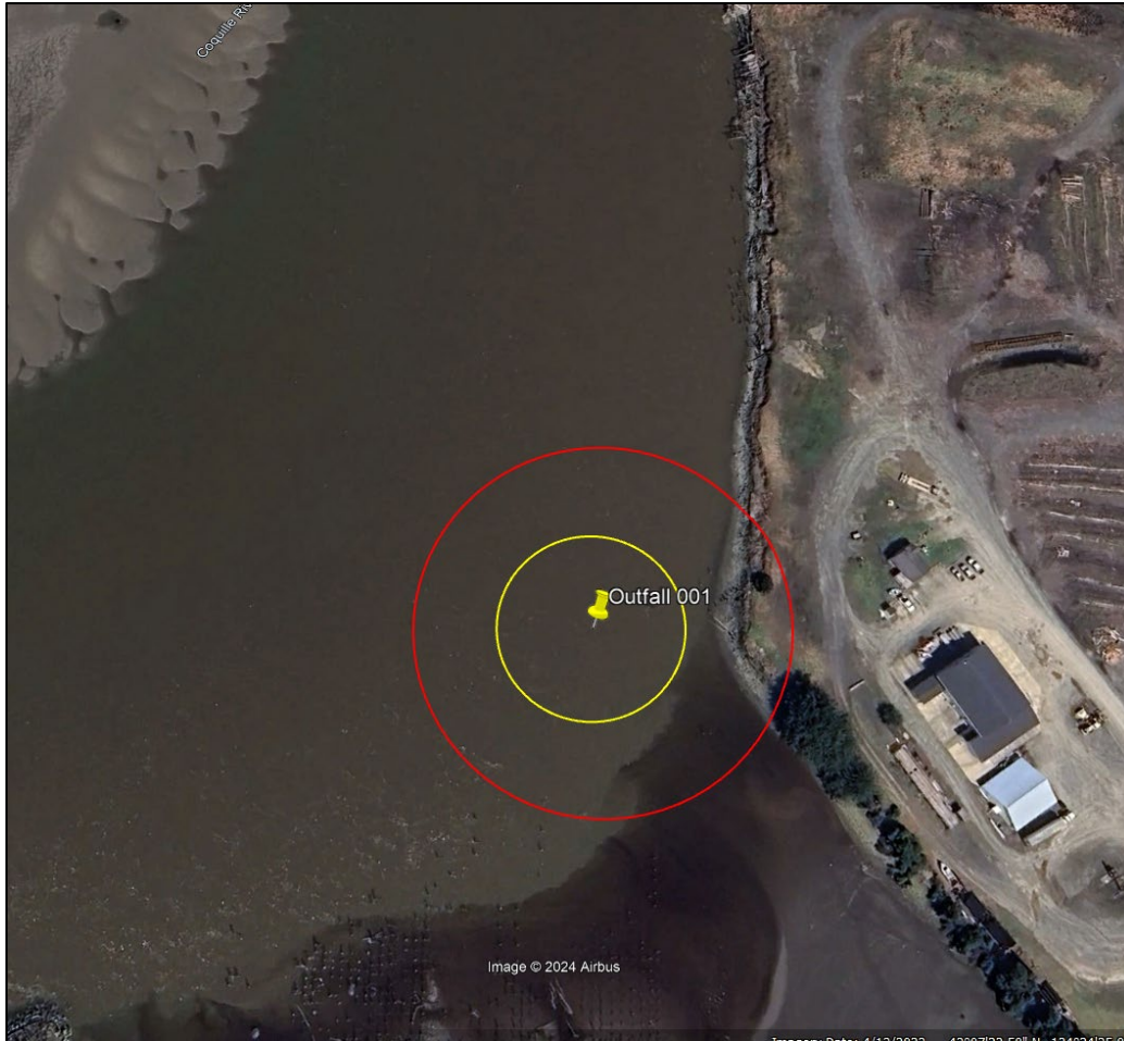
Figure 3-1: Bandon Outfall With Current Regulatory Mixing Zone (red circle) and Proposed Regulatory Mixing Zone (yellow circle)

Outfall 001 has two diffusers 5 feet in length shaped in the form of a “T” with 5 ports on each diffuser. The outfall is approximately 130 ft from the bank and discharges into the Coquille River Estuary at 43.122446, -124.40466 (WGS84). A 2022 outfall inspection study showed that the outfall pipe was in very poor condition, with many of the original diffuser ports blocked and the pipe deteriorating with multiple holes ranging from 1 to 12 inches in diameter.