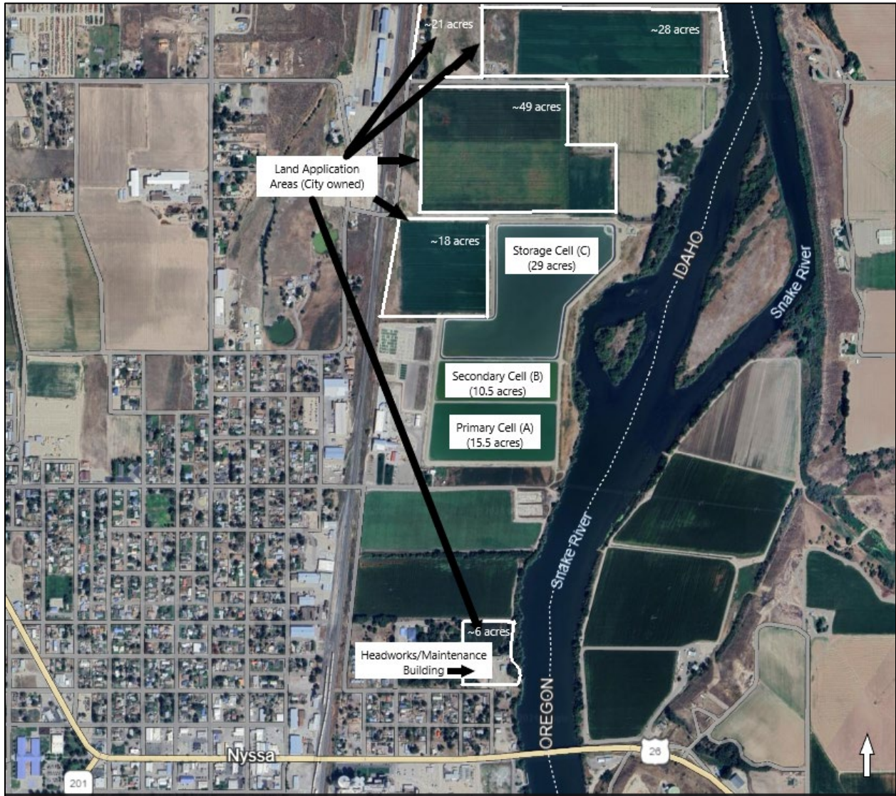
Figure 2-1: City of Nyssa Wastewater Treatment Plant, Lagoons, and Land Application Site Map