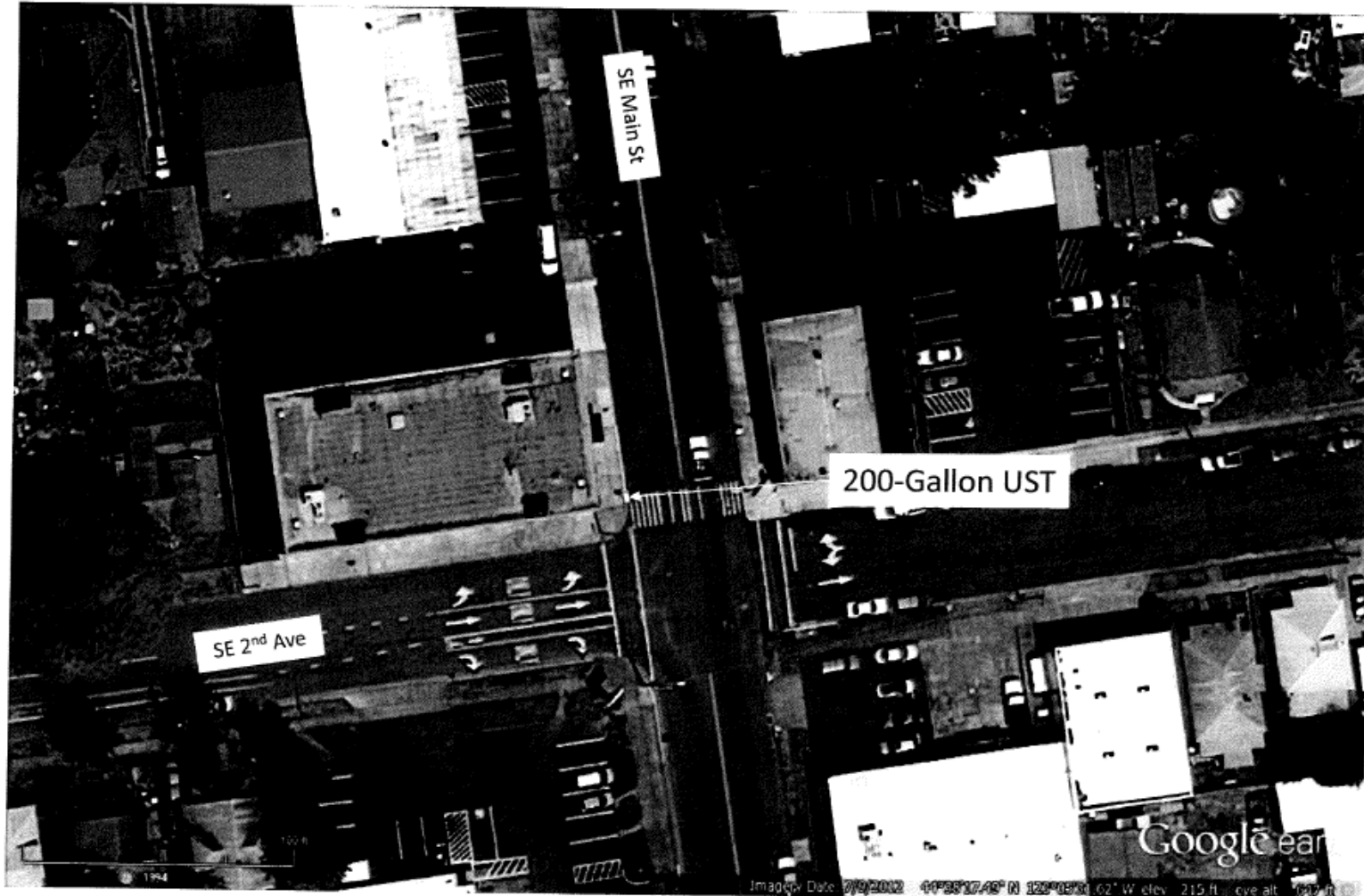
Figure 1. Tank location map

Tank located in right of way near 120 SE Main St, Albany, OR