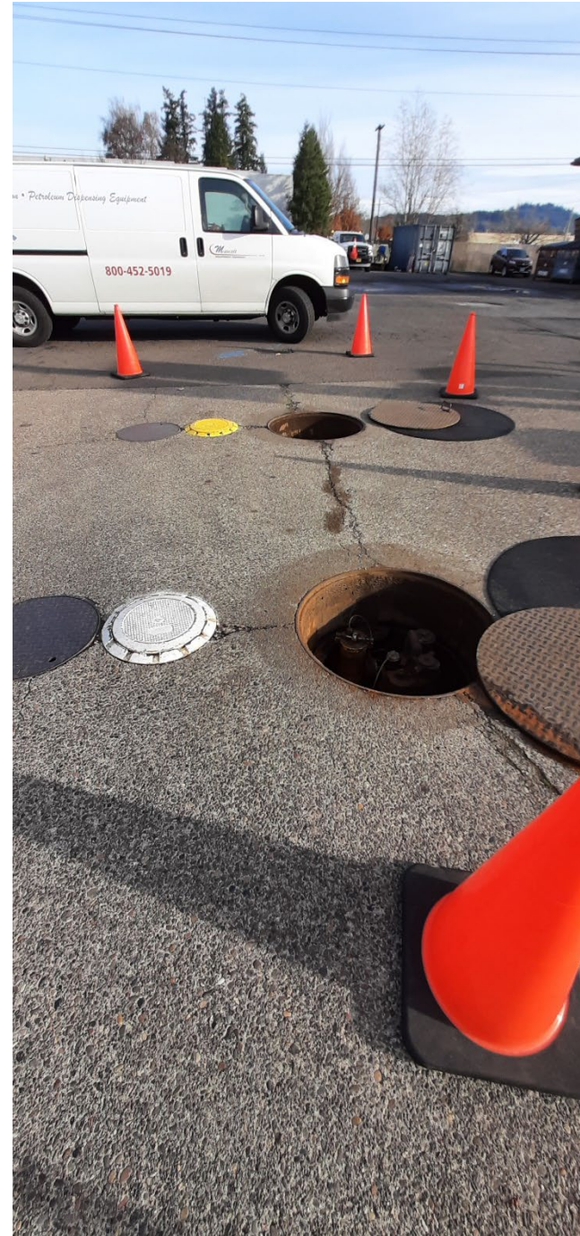
2: Tank nest looking East