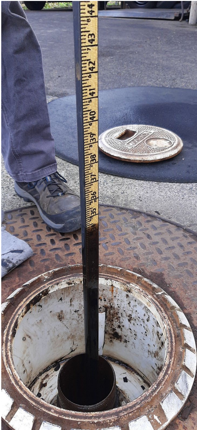
3: Manual gauge stick for waste oil tank