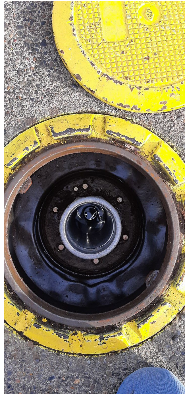
6: Diesel fill