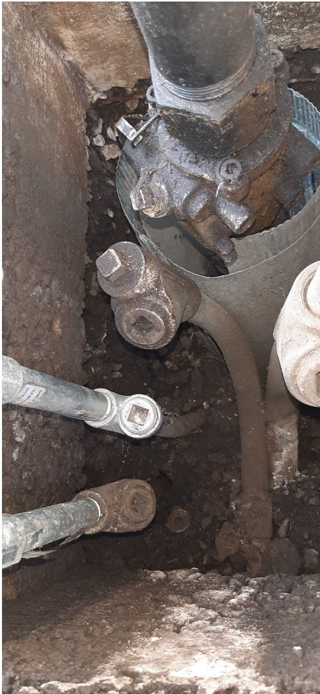
7: Diesel UDC