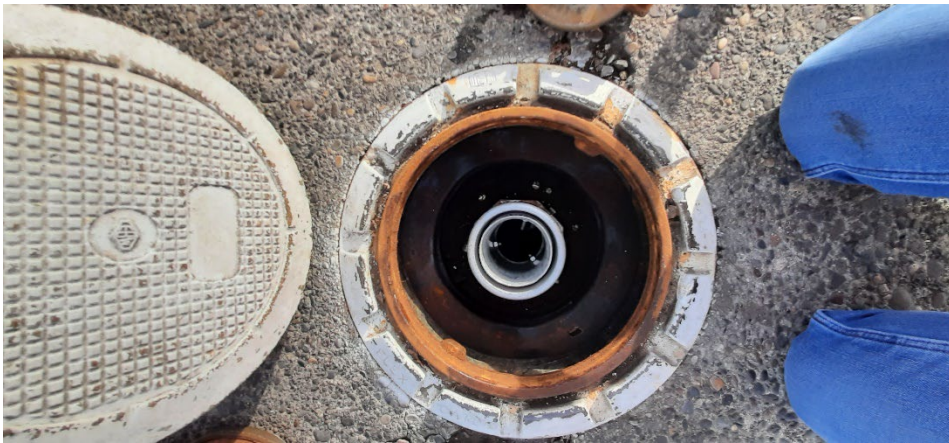
5: Regular fill