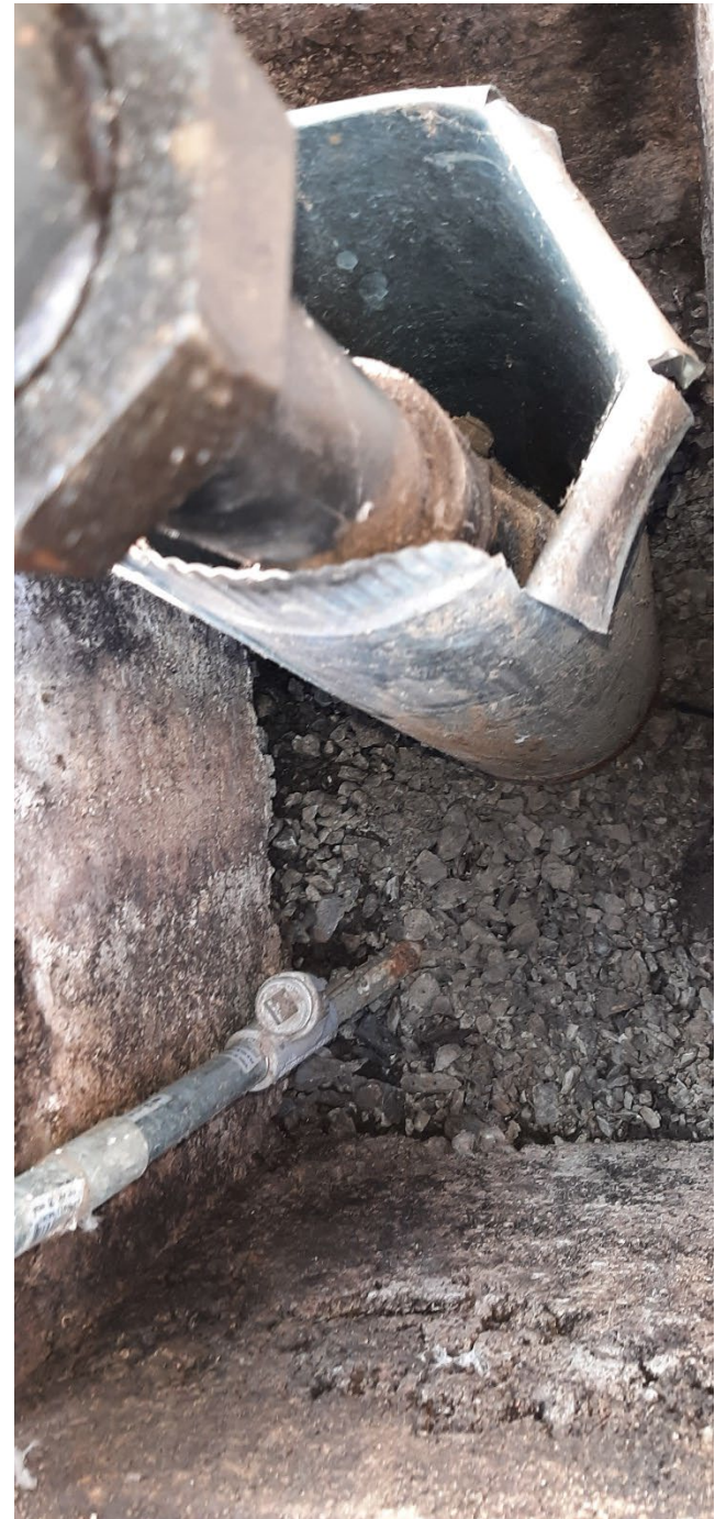
8: Regular UDC