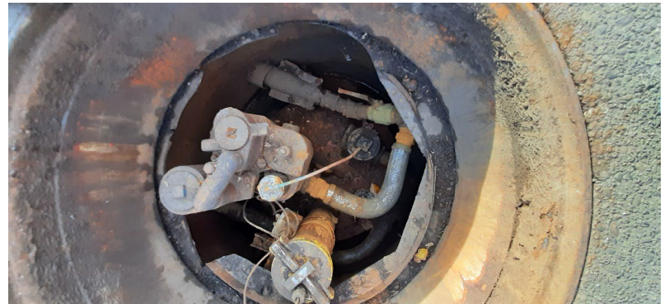
4: Regular sump