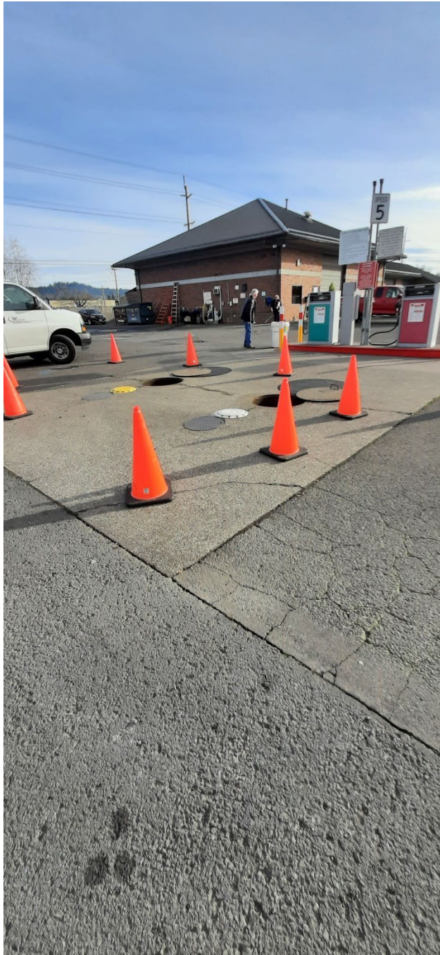
1: 8777 SW Burnham St, Tigard, OR 97223