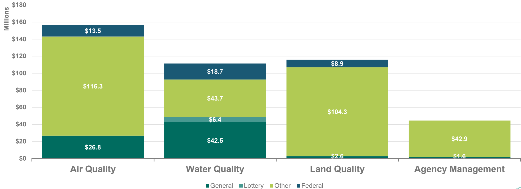
Program by Fund Type