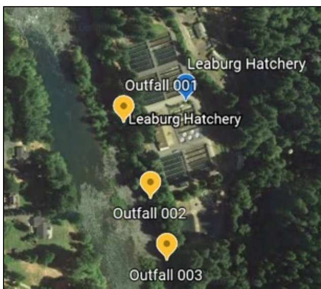
Figure 2: Facility Outfalls

Outfall 003 is at approximate river mile (RM) 33.77 (Latitude/Longitude: 44.133918/-122.609556). The outfall drains the pollution abatement settling ponds and meets with the McKenzie River via a concrete drainage ditch.