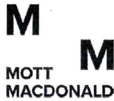
Exhibit A-1 – Scope of Work