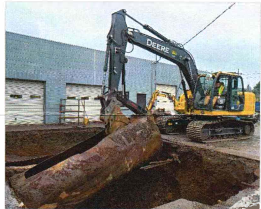
An environmental consultant removing an old steel underground storage tank.

Once a cost recovery agreement is signed, the site is placed on a regional waitlist until DEQ can assign a project manager. Consult with a DEQ regional office about potential wait times. After a DEQ project manager is assigned, DEQ will provide a monthly cost recovery bill for project management costs. Please see the Leaking Underground Storage Tank Cleanup Information Packet for more information regarding DEQ's cost recovery.