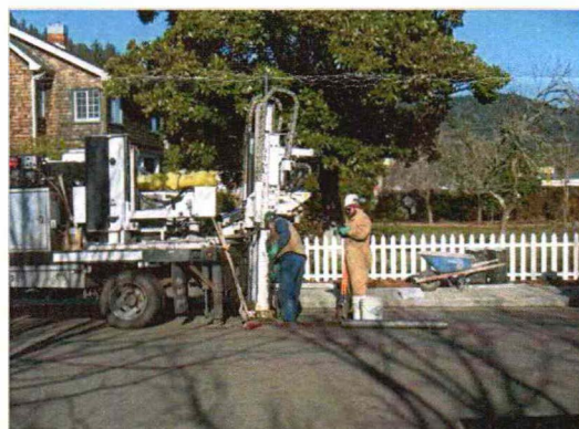
Collecting soil samples next to a leaking underground storage tank.

Responsible parties are required to cleanup any leak from an underground storage tank in accordance with OAR 340-122-0217.