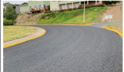
Pictured: A recent fog seal application on E Scenic Dr. – The Dalles.

FOG SEAL - Fog sealing is an application of asphalt emulsion sprayed onto a pavement surface. The emulsion is diluted to the proper consistency to obtain complete coverage of the roadway. Fog sealing has been shown to extend the life of chip seal and scrub seal treatments.