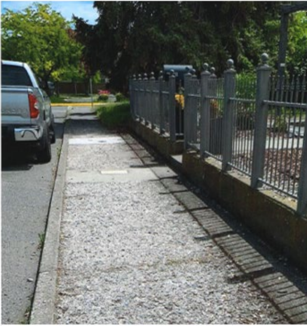
Before Sidewalk Rehabilitation