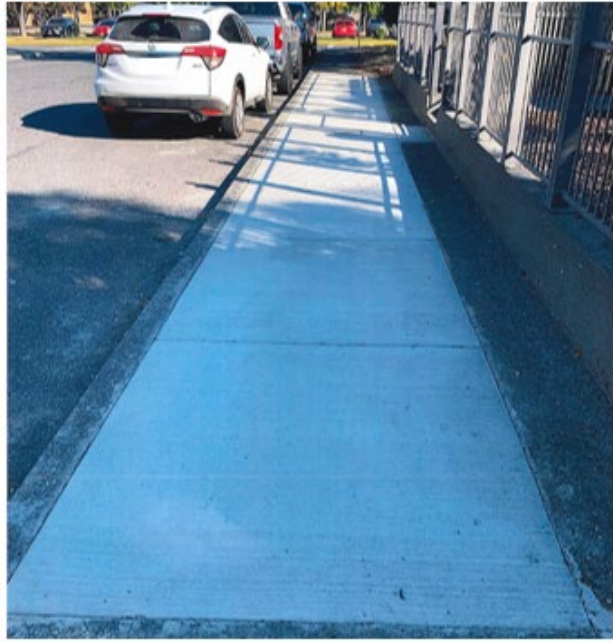
After Sidewalk Rehabilitation

The amount the City will cost-share is variable based on the type of property: