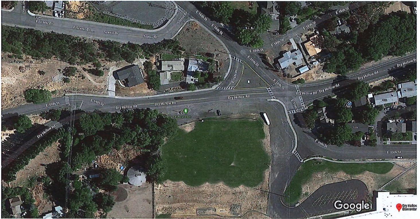
Imagery ©2023 CNES / Airbus, Maxar Technologies, State of Oregon, Map data ©2023 Google 50 ft