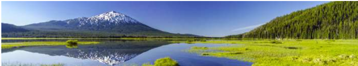
DEQ Water Quality Program Activities