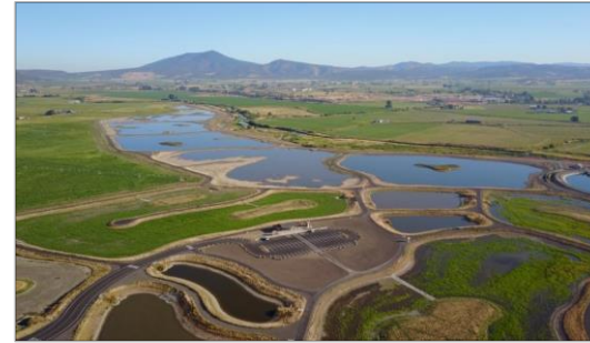
Prineville's treatment wetlands