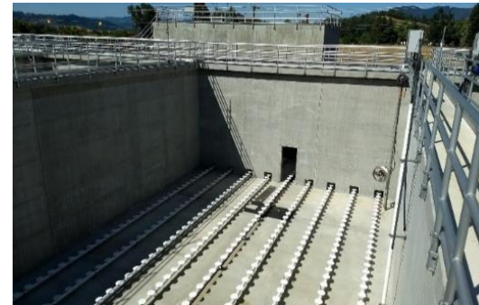
Wastewater aeration basin