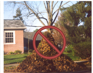
Please help us with Operation Clean Sweep in The Dalles, OR. Do not rake leaves from your yard into the street. Citizens are asked to park off the street during street sweeper work hours on weekdays 7:00 a.m. to 3:30 p.m.