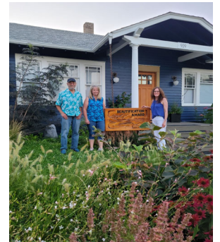
August Beautification Award goes to: