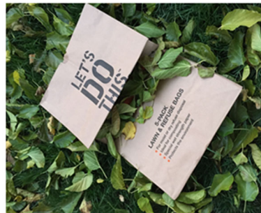
Please join us in Operation Clean Sweep in The Dalles, OR. Put leaves in compostable paper bags. Take bagged leaves to The Dalles Disposal, located at 1317 West 1 st Street, Monday through Friday between 9 am and 4:30 pm.