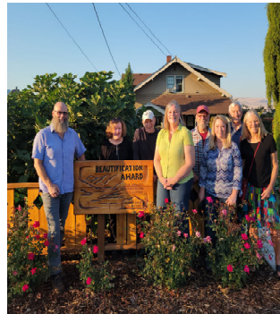
October Beautification Award goes to:

This is a project of the Beautification Committee. At this time the committee members are making recommendations to the sub committee for the Monthly Award. If you see a yard you feel is deserving please email the address and owner name to igrossman@ci.the-dalles.or.us . Staff will forward the information to the Beautification Committee for consideration.