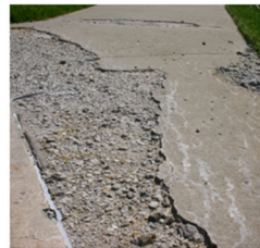
The City of The Dalles is accepting applications for a cost sharing program to rehabilitate sidewalks until June 30, 2023 or until funds run out. Apply online at thedalles.org/publicworksdocs

The City of The Dalles Municipal Code 2.20.010 provides that it is the responsibility of property owners to maintain public sidewalks adjacent to their properties "in good repair and a safe condition." The Dalles Municipal Code also identifies that the adjacent real property owner bears the legal liability "for any personal injury or property damage which occurs because of the owner's failure to maintain the sidewalk in good repair or a safe condition." The 50/50 Sidewalk Rehabilitation Program will help provide some financial assistance to property owners to meet that responsibility.