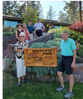
September Beautification Award goes to: