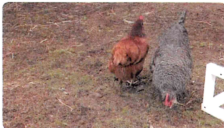
Highly contagious avian influenza found in Oregon; Bend owner of chickens taking precautions - KTVZ