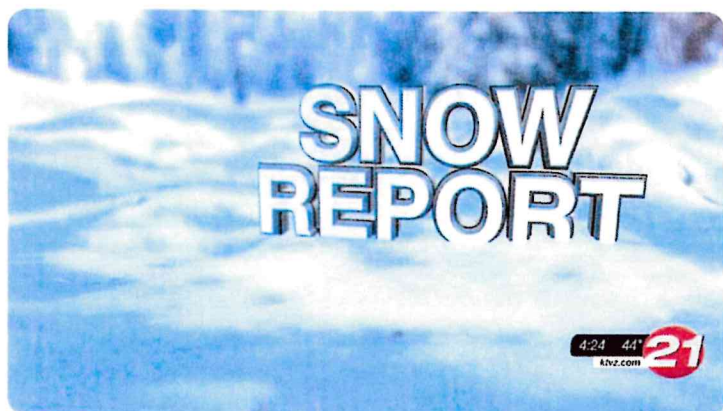
Lots 'o Snow On The Way - KTVZ