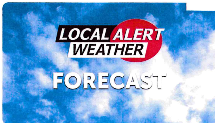
Chilly, breezy, stormy - KTVZ