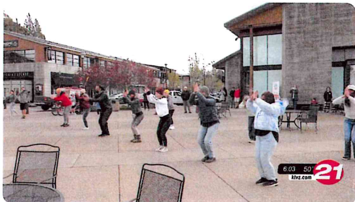
A flash mob breaks out at the Old Mill to promote the Bend Yoga Festival